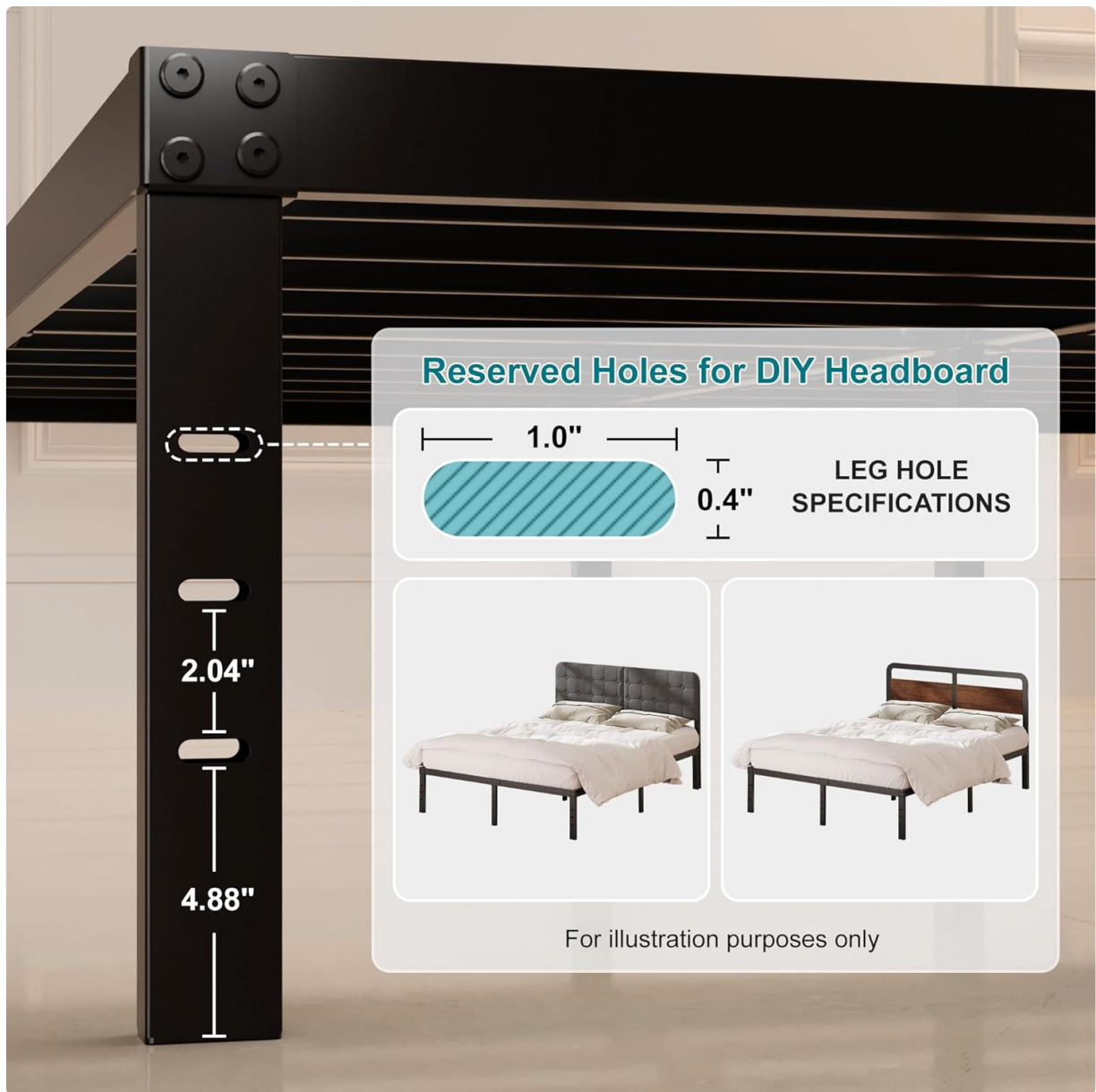
Image: A close-up diagram detailing the reserved holes on the bed frame legs for optional headboard attachment.