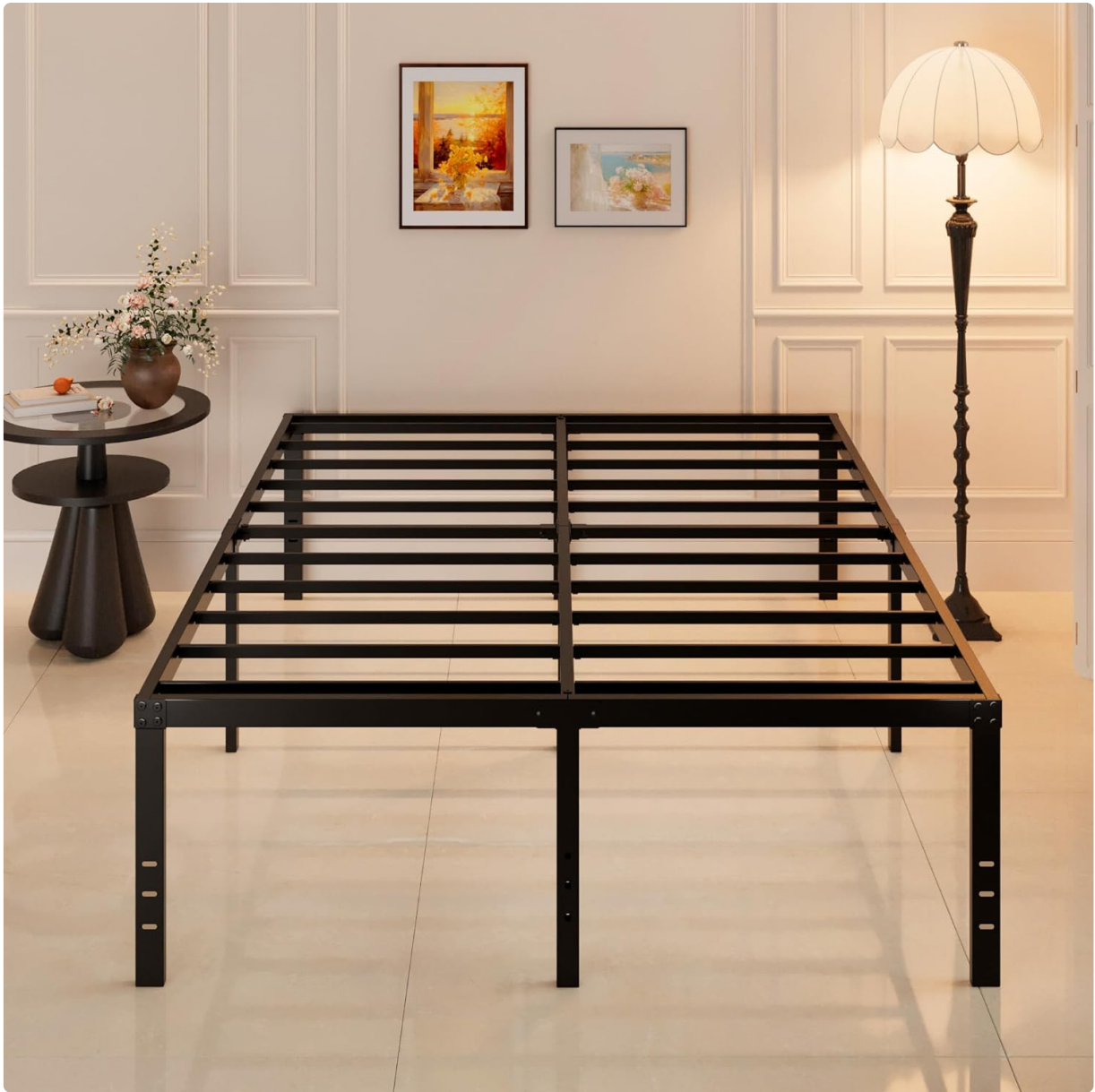
Image: The Maenizi 20 Inch Queen Bed Frame, showcasing its minimalist design in a bedroom environment.