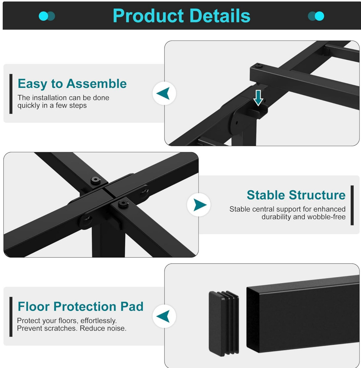
Image: Product details highlighting easy assembly, stable central support, and floor protection pads.

Carefully remove all components from the packaging. Lay them out on a clean, soft surface to prevent scratches. Refer to the included parts list in your manual to identify each piece.