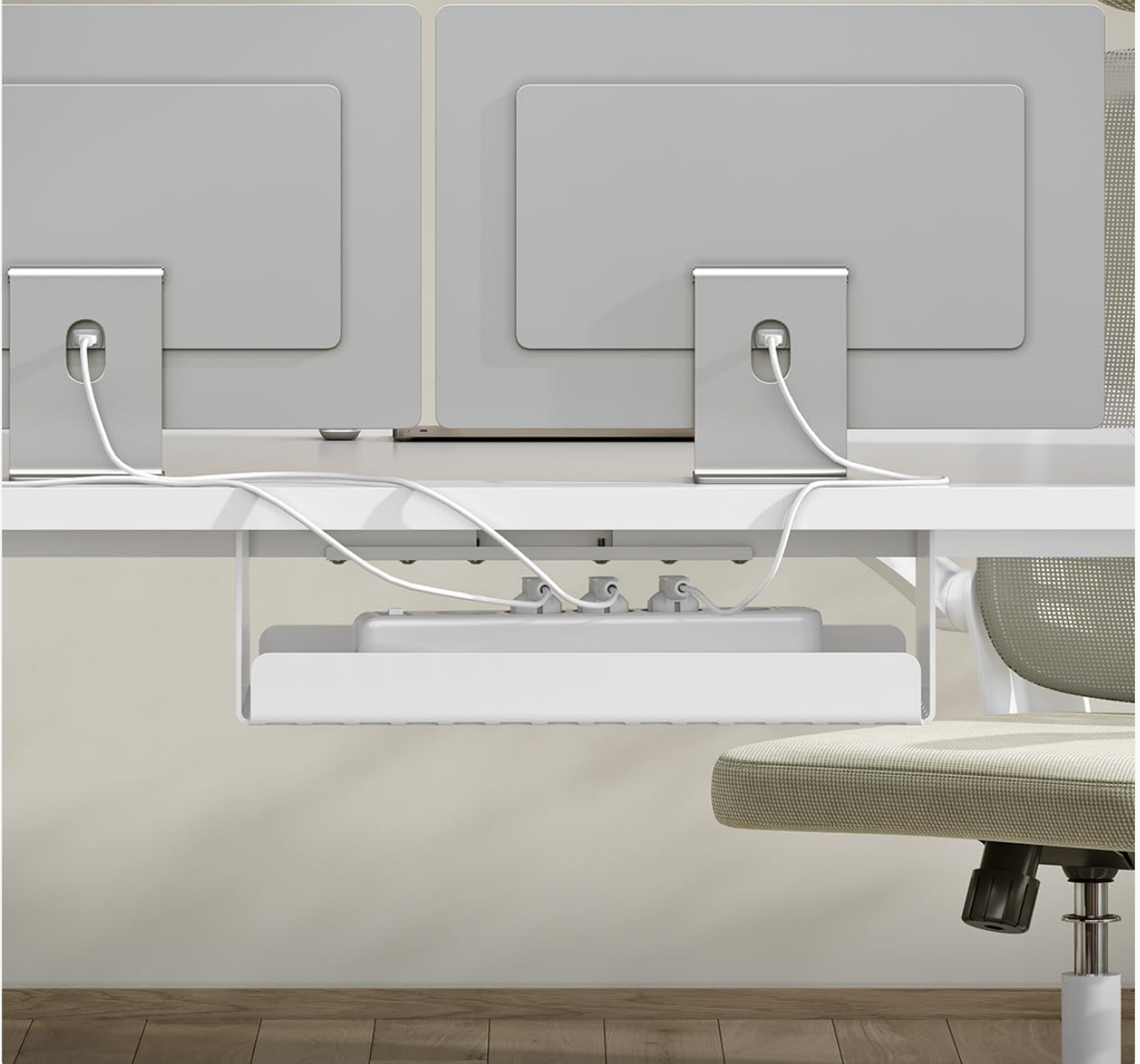
Image: The cable management tray helps keep your workspace tidy.