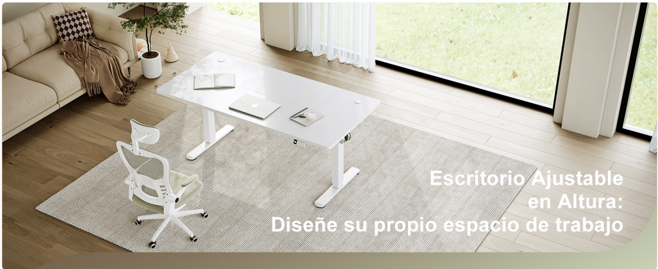
Image: The desk features pre-drilled holes for quick and easy assembly.

Your Devoko Electric Standing Desk is now assembled.