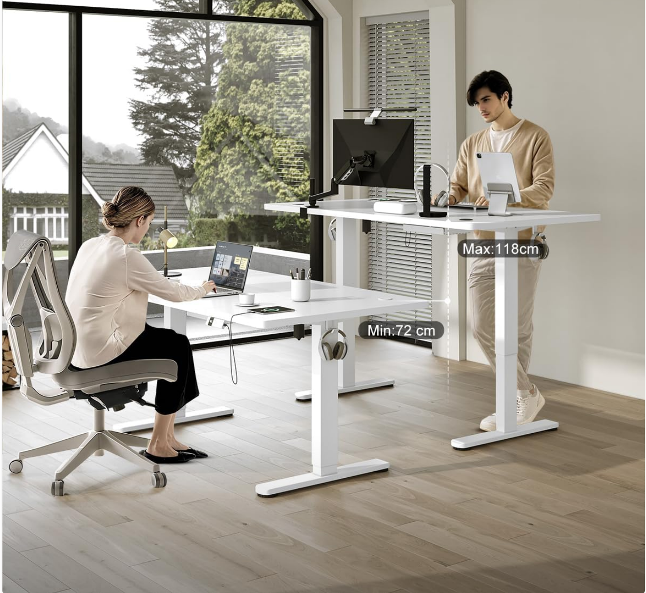
Image: The desk's flexible height adjustment allows users to easily switch between sitting and standing positions.