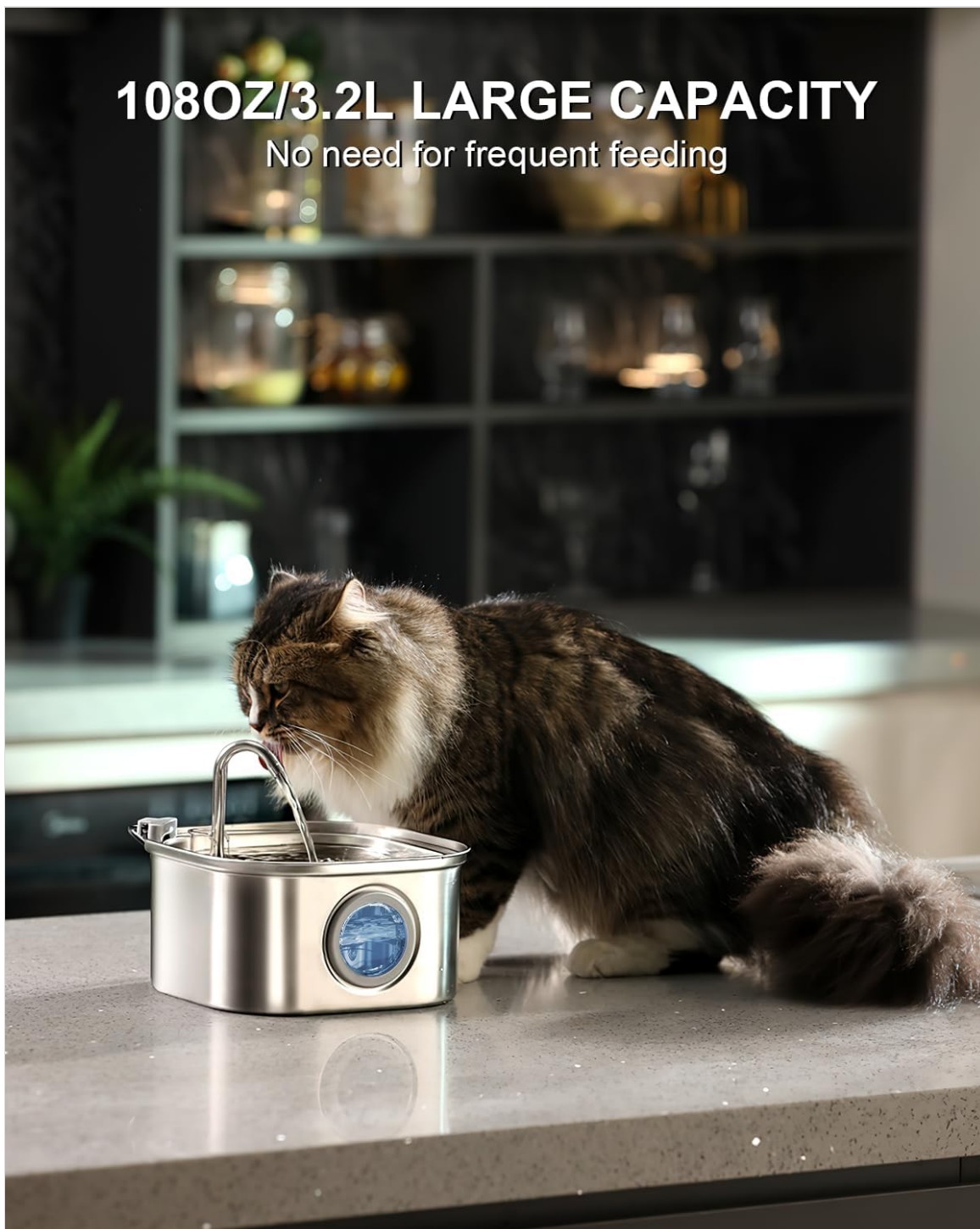
Image: A cat drinking from the NautyPaws pet water fountain, illustrating the fountain's appeal to pets and its large water capacity.