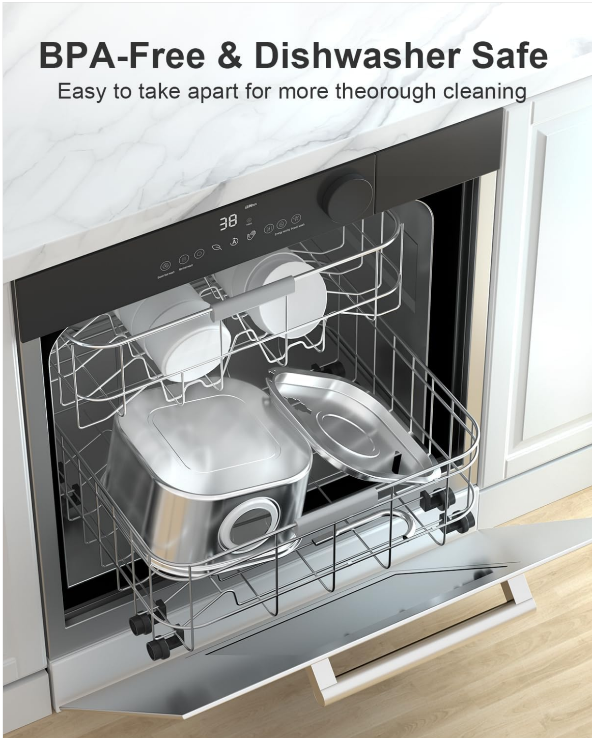
Image: The stainless steel base and top tray of the NautyPaws pet water fountain placed in a dishwasher, demonstrating their dishwasher-safe feature.