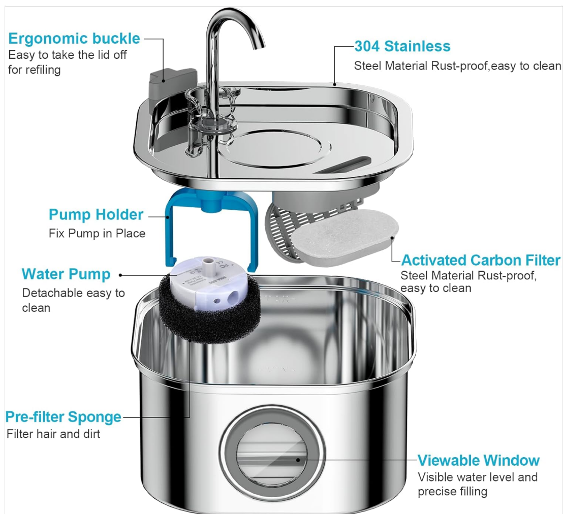
Image: Exploded view showing the individual components of the NautyPaws pet water fountain, including the stainless steel base, top tray, water pump, pre-filter sponge, and activated carbon filter.