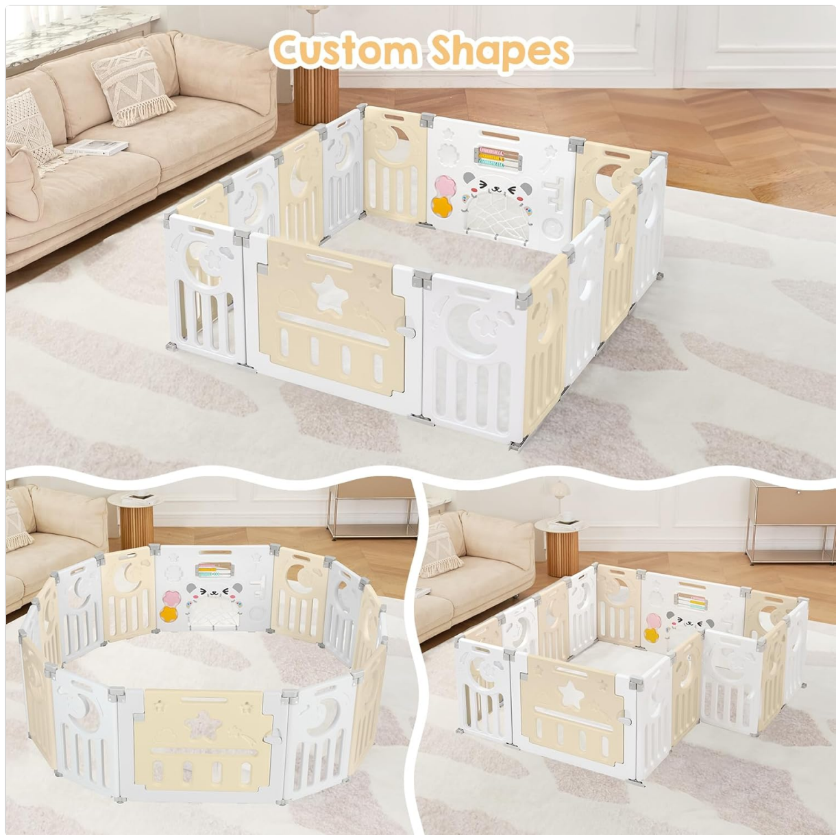
Figure 2: Examples of the playpen configured into different shapes, including square, octagonal, and rectangular, demonstrating its adjustable nature.