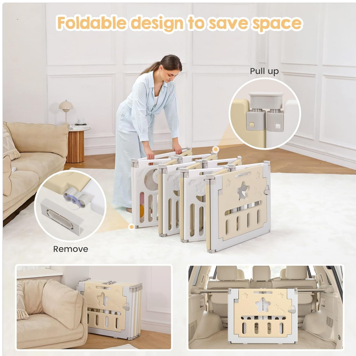
Figure 6: A woman demonstrating the foldable design of the playpen, showing how it can be compactly stored or transported in a car boot.