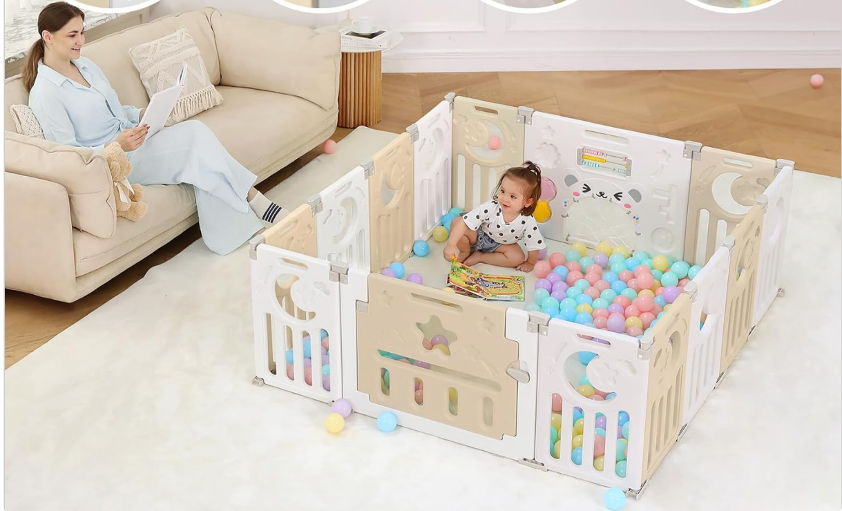
Figure 4: A child playing safely within the playpen, showcasing the lockable door and the interactive game panel.