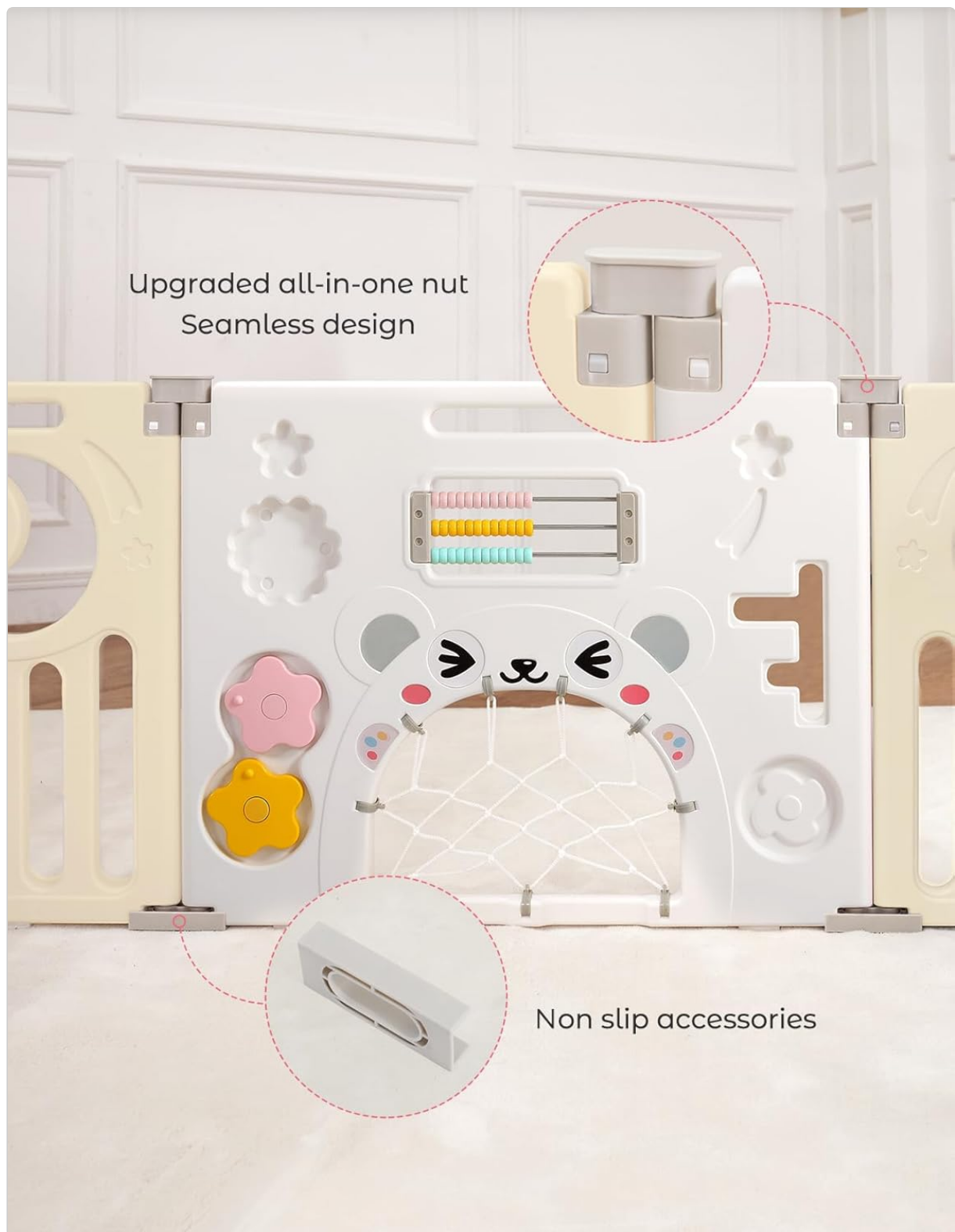
Figure 5: A detailed view of the game panel, highlighting the abacus, spinning flowers, and the mini soccer goal with a cute cat design.