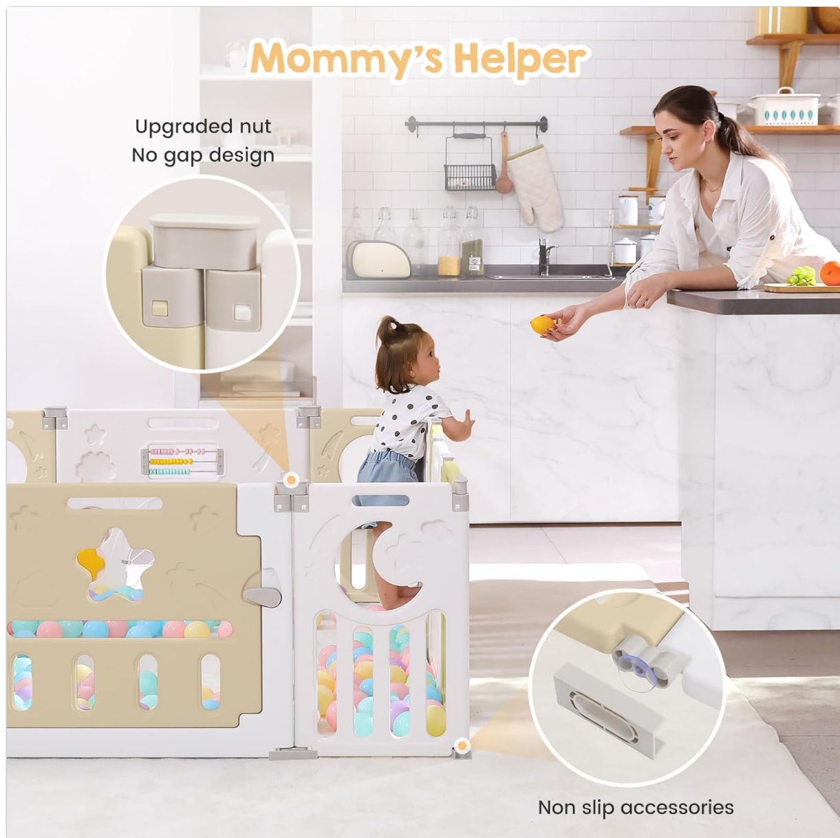
Figure 3: Detailed view of the upgraded nut for secure panel connection and the non-slip accessories at the base, highlighting the no-gap design.