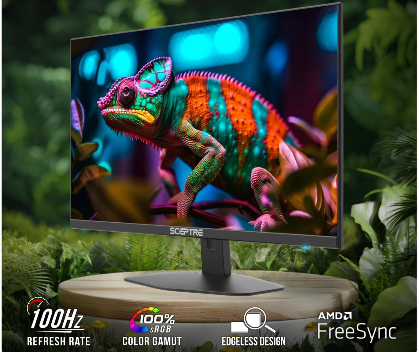
Figure 2: Monitor Front View