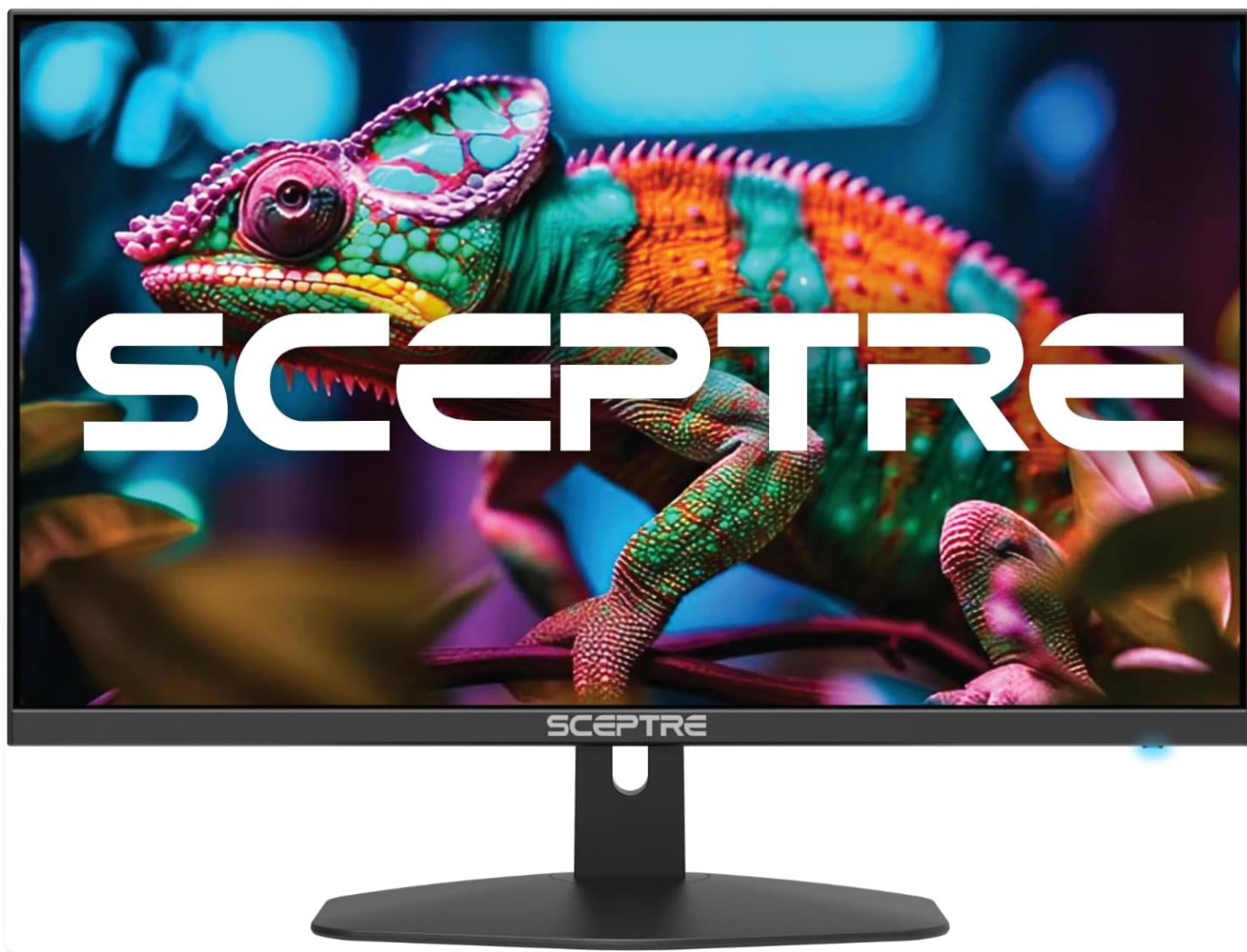
Figure 1: Sceptre 27-inch Gaming Monitor (E275W-FW100T)