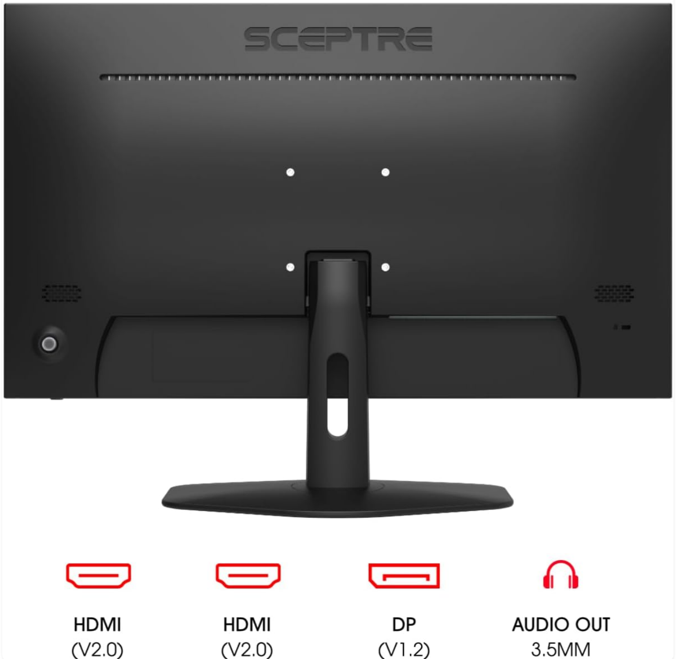
Figure 4: Monitor Rear Ports