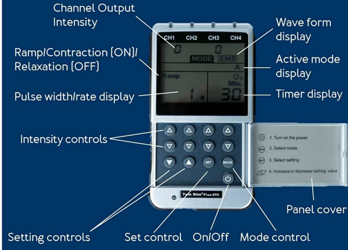
Image: Detailed view of the device's liquid crystal display and control panel, highlighting channel output, intensity, waveform display, active mode, pulse width/rate, timer, and various control buttons.