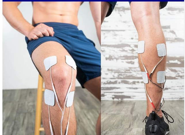
Image: Visual guide for electrode placement on different body areas to target pain in the hand, neck, upper back, lower back, shoulder, elbow, knee, and calf.