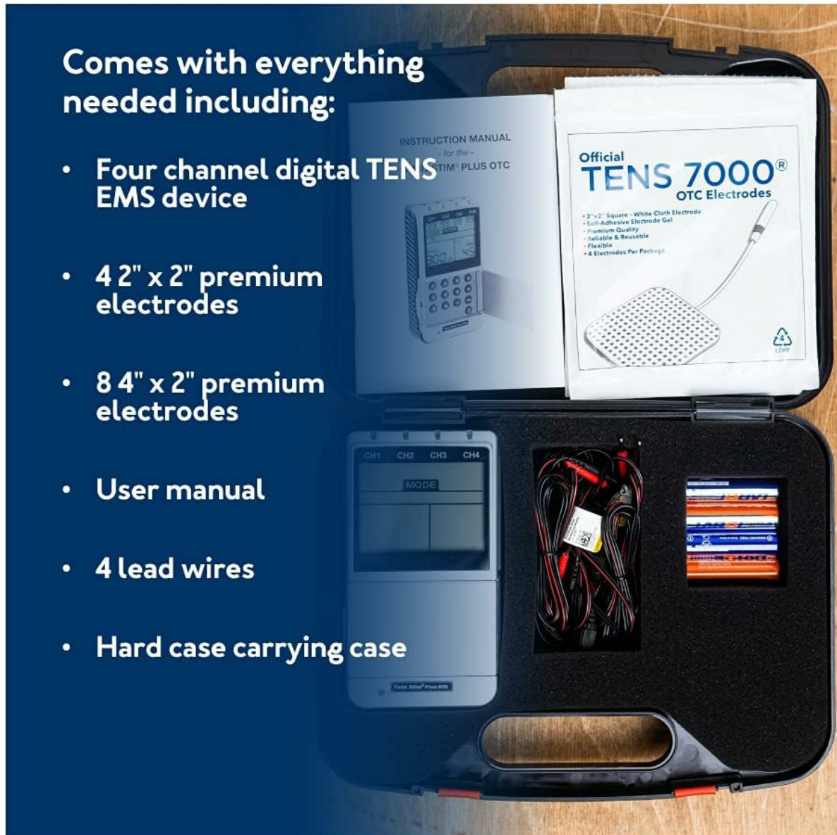
Image: The Roscoe Medical 4-Channel EMS and TENS Unit, along with lead wires, electrodes, user manual, and batteries, neatly organized within its hard carrying case.