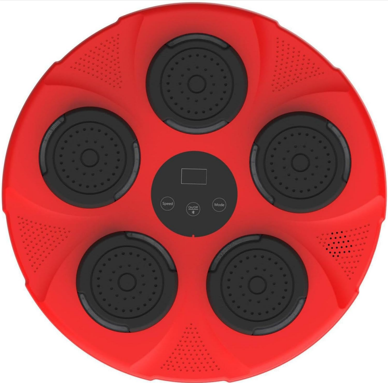
Image Description: This image displays a top-down view of the red Musical Boxing Machine. It is circular in shape with five black circular target pads arranged symmetrically around a central control panel. The control panel features buttons for 'Speed', 'On/Off', and 'Mode', along with a small digital display. The outer edge of the machine has a textured surface.