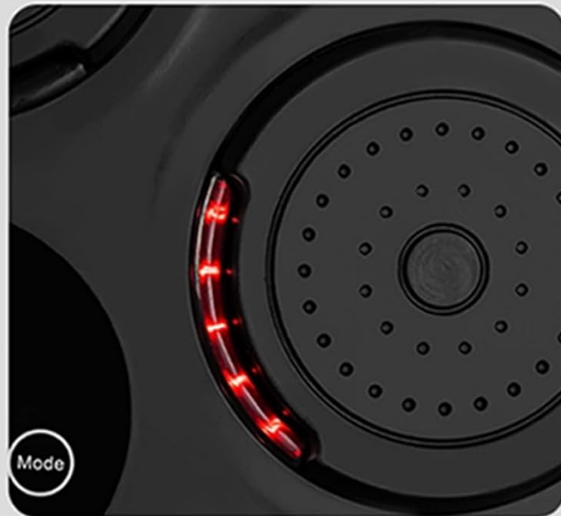
Image Description: This image highlights the upgraded smart music boxing target, showing the five circular target pads with red LED light strips illuminating around them. This visual feedback is synchronized with music, indicating active hit points and enhancing the dynamic training experience.