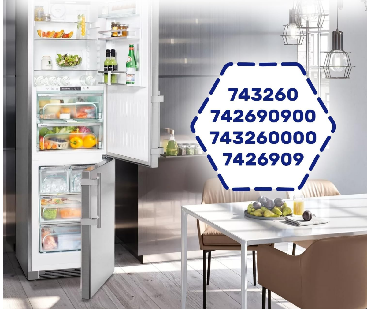
Image 2.1: A Liebherr refrigerator, illustrating the type of appliance this handle is compatible with, alongside a graphic highlighting the compatible original part codes.