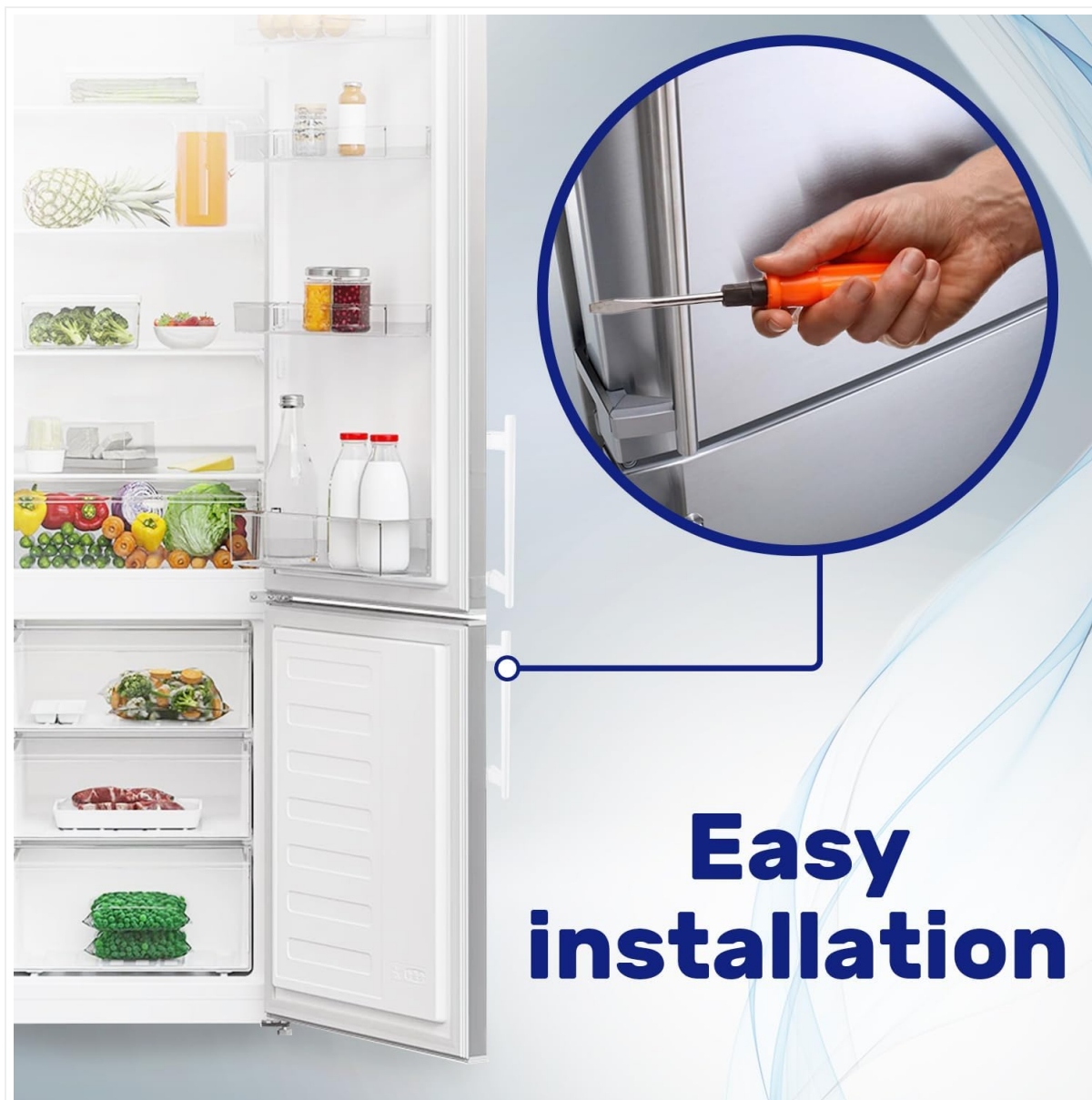
Image 4.1: An illustration of the easy installation process, showing a hand using a screwdriver to secure the handle.