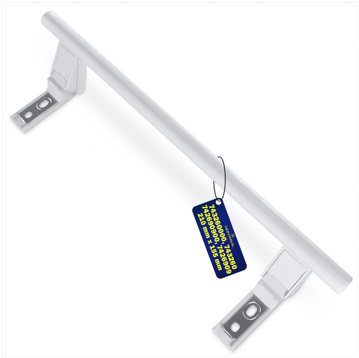
Image 1.1: The MONTERAL Fridge Door Handle, showing its design and an attached tag with compatibility codes and dimensions.