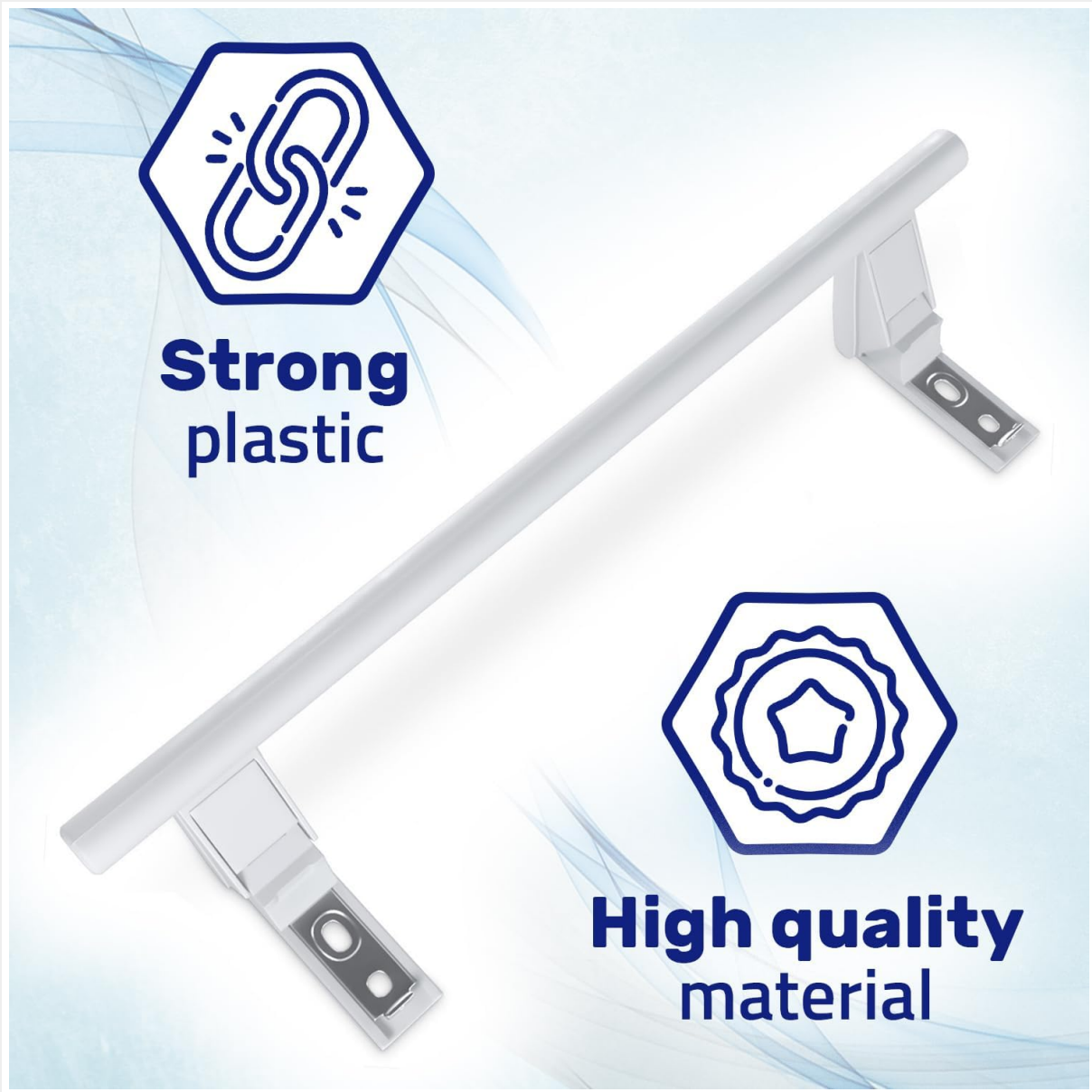
Image 3.2: Visual representation emphasizing the strong plastic and high-quality material used in the handle's construction.