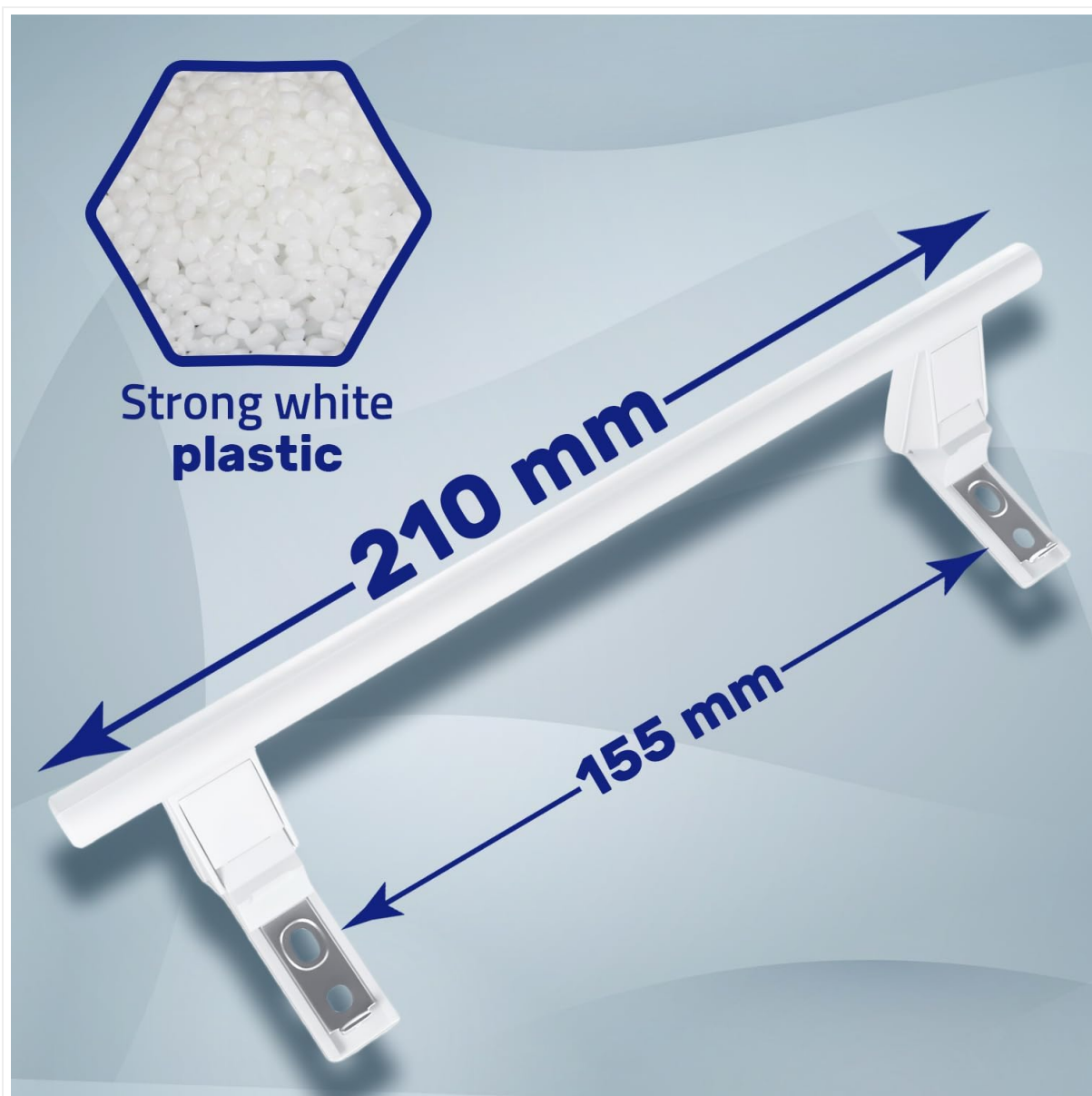
Image 3.1: Detailed dimensions of the handle, showing a total length of 210 mm and a hole spacing of 155 mm.