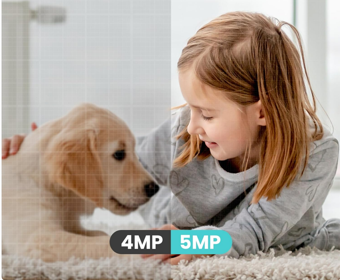
Figure 1: litokam 5MP Indoor Security Camera (Model LF-P1t-5GHz)