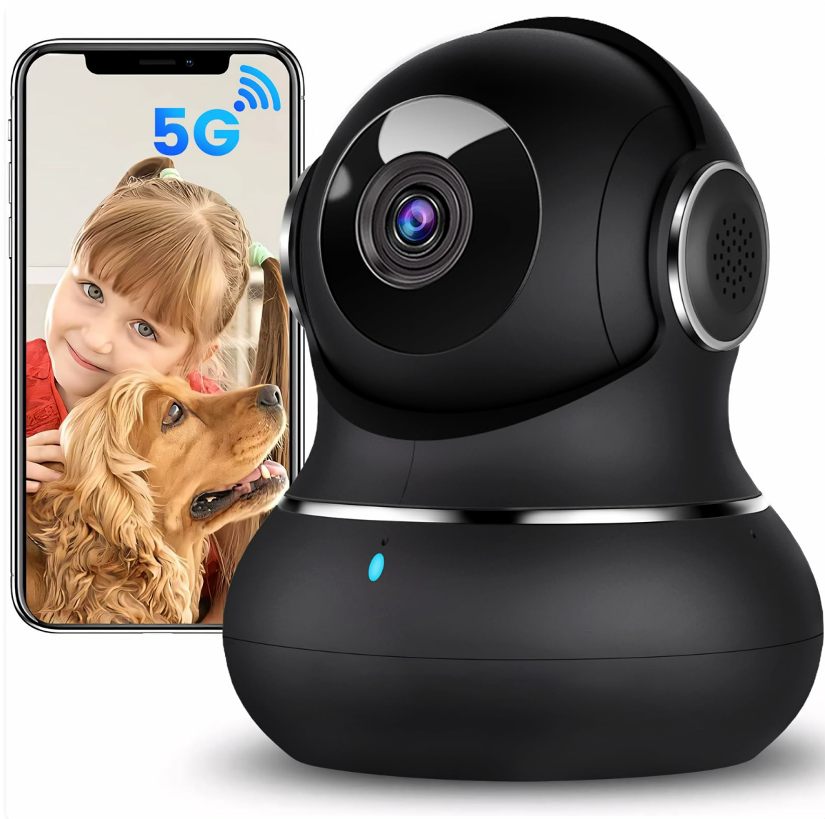
Figure 2: Contents of the litokam camera package.