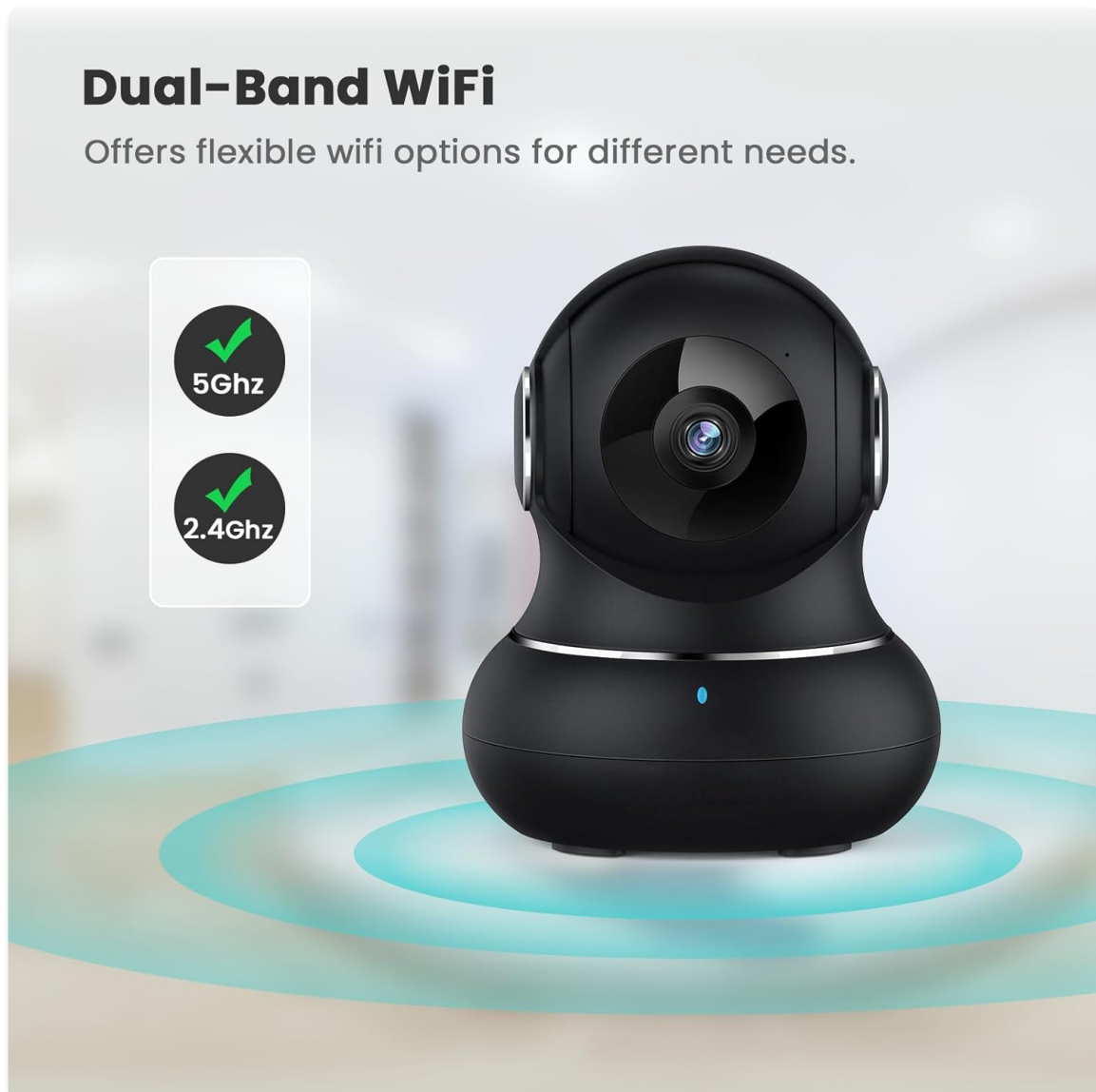
Figure 3: Dual-Band Wi-Fi connectivity options for flexible setup.

Video 1: Instructions on how to insert an SD card into the indoor camera.