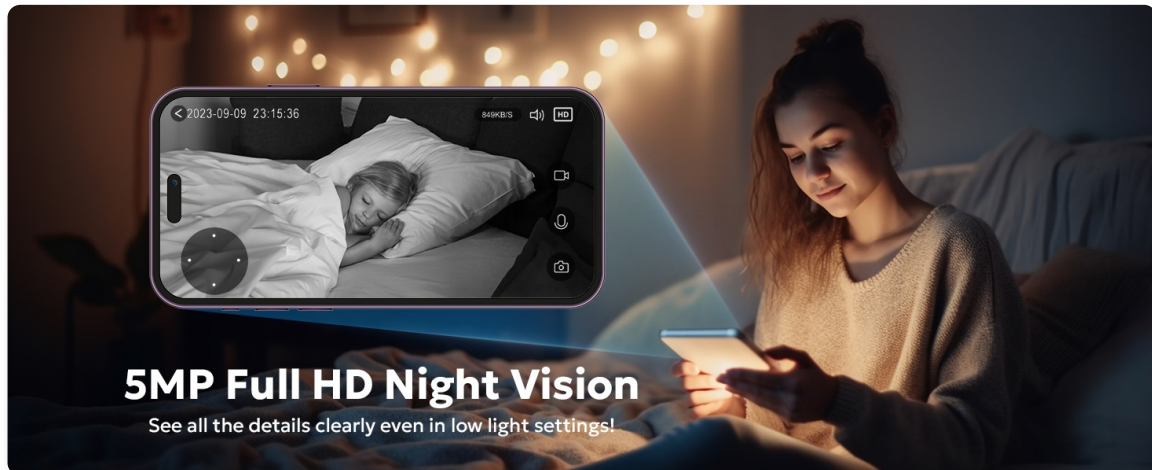
Figure 4: High-resolution 5MP Super HD image quality and clear night vision.

Video 2: Overview of litokam Home Security Camera features for baby, pets, and elders.