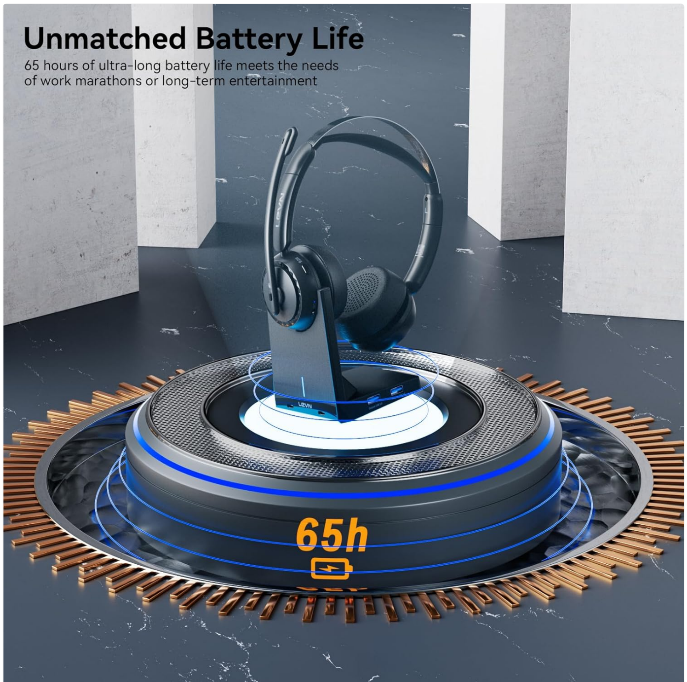
Image: The LEVN headset charging on its base, highlighting its 65-hour battery life.