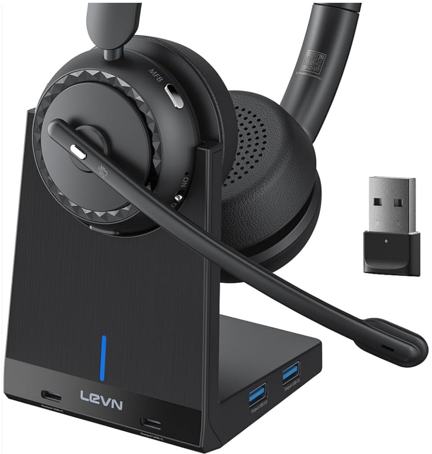
Image: LEVN Wireless Headset, charging base, and USB dongle.