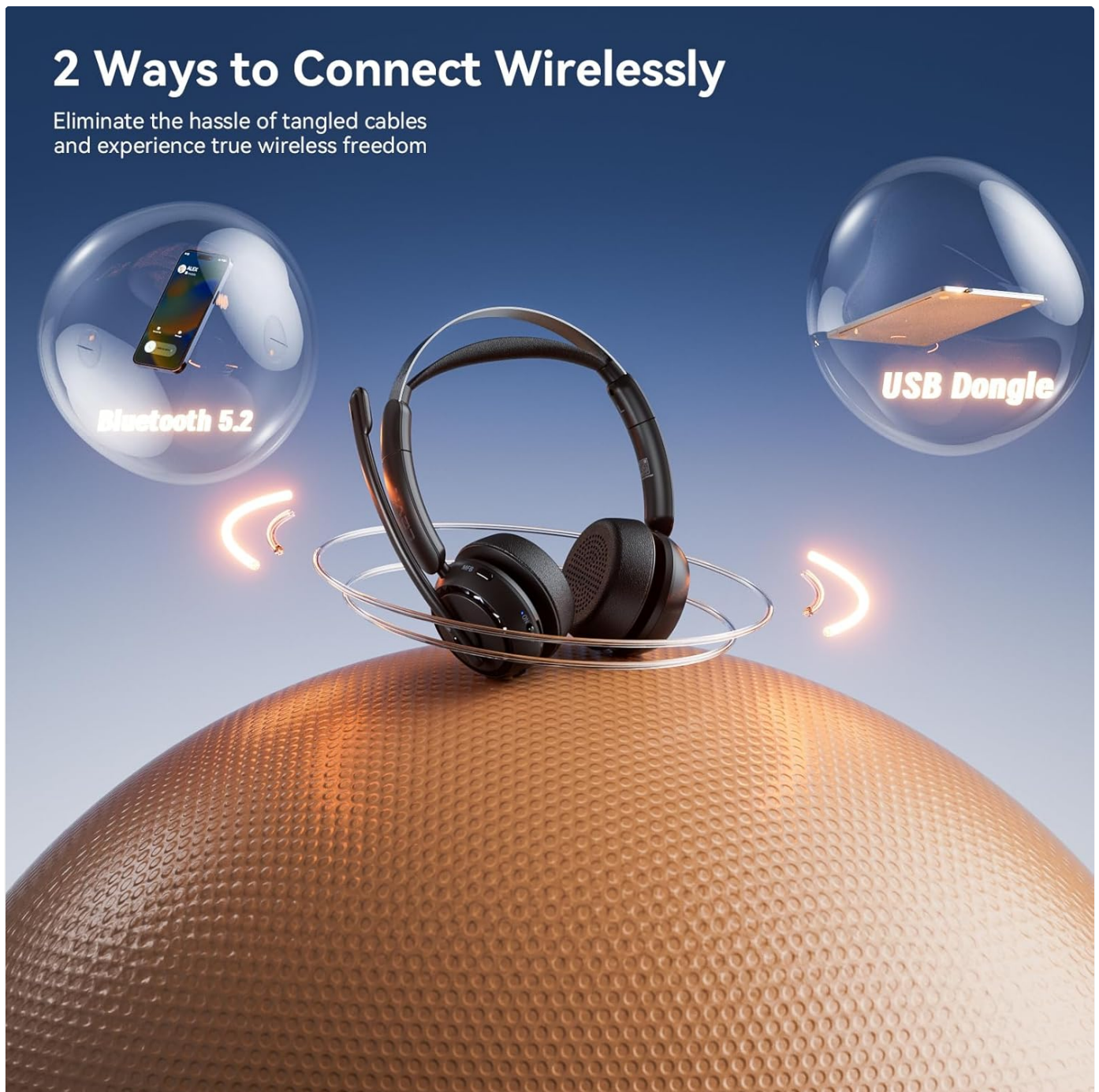
Image: Visual representation of the two wireless connection options: Bluetooth 5.2 and USB Dongle.