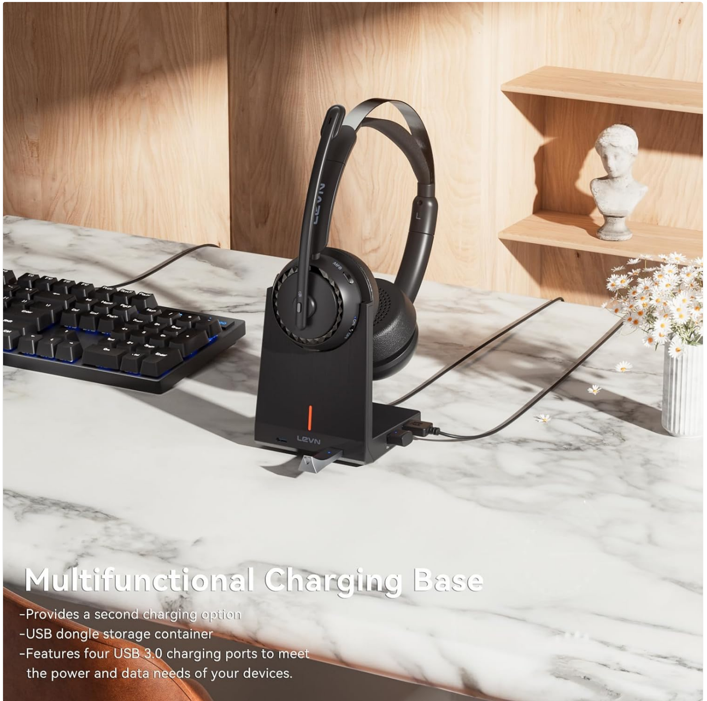
Image: The multifunctional charging base with four USB 3.0 ports and a storage container for the USB dongle.