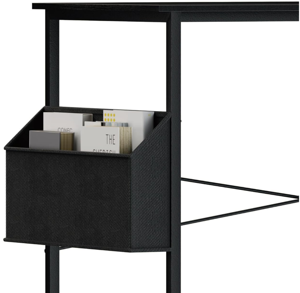
Image: A close-up view of the black fabric side storage bag, designed to hold books or other office supplies, attached to the desk frame.