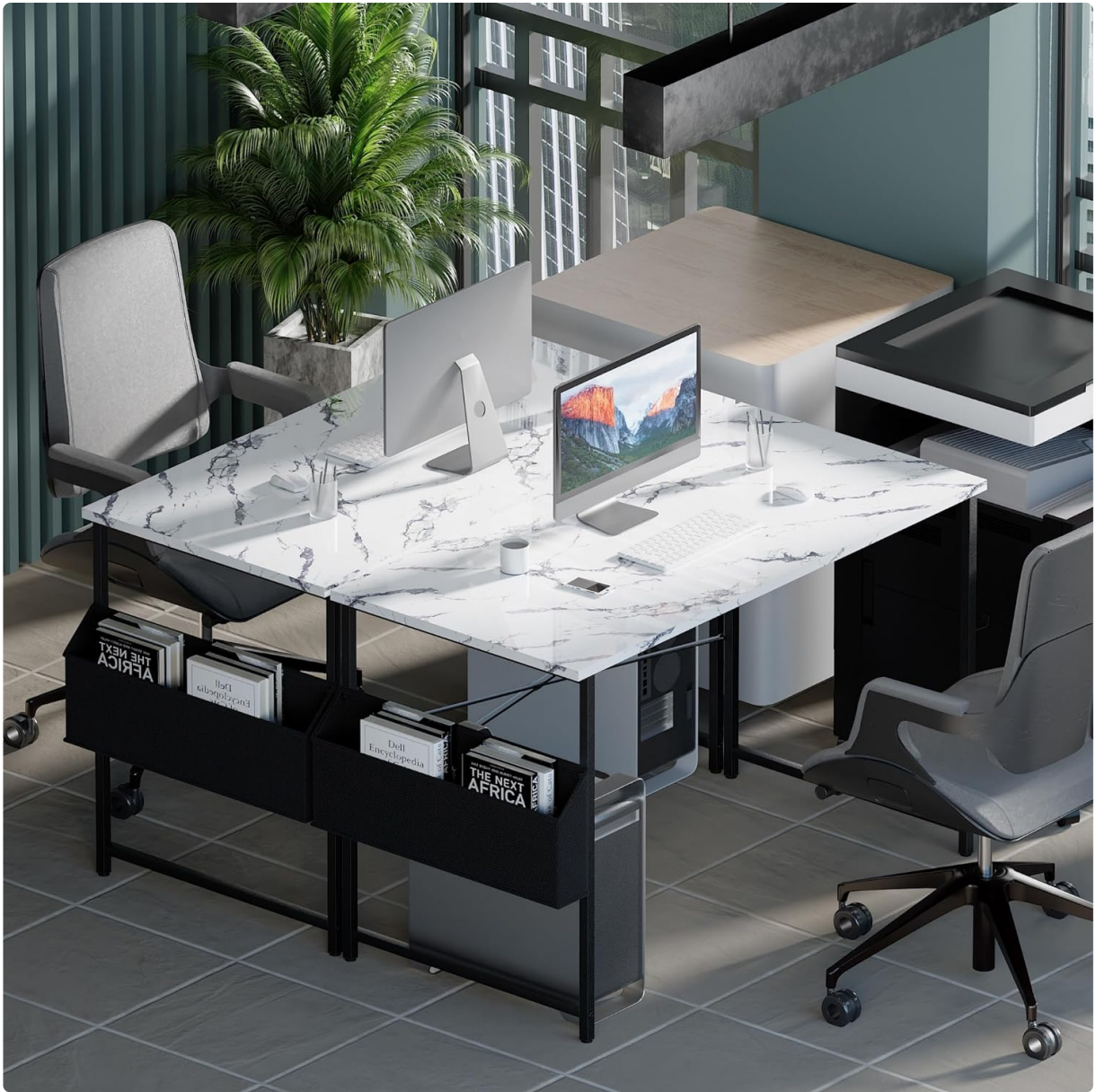
Image: Two Pamray desks arranged in an office environment, each supporting a computer monitor and other office essentials, demonstrating their suitability for collaborative or multi-user setups.