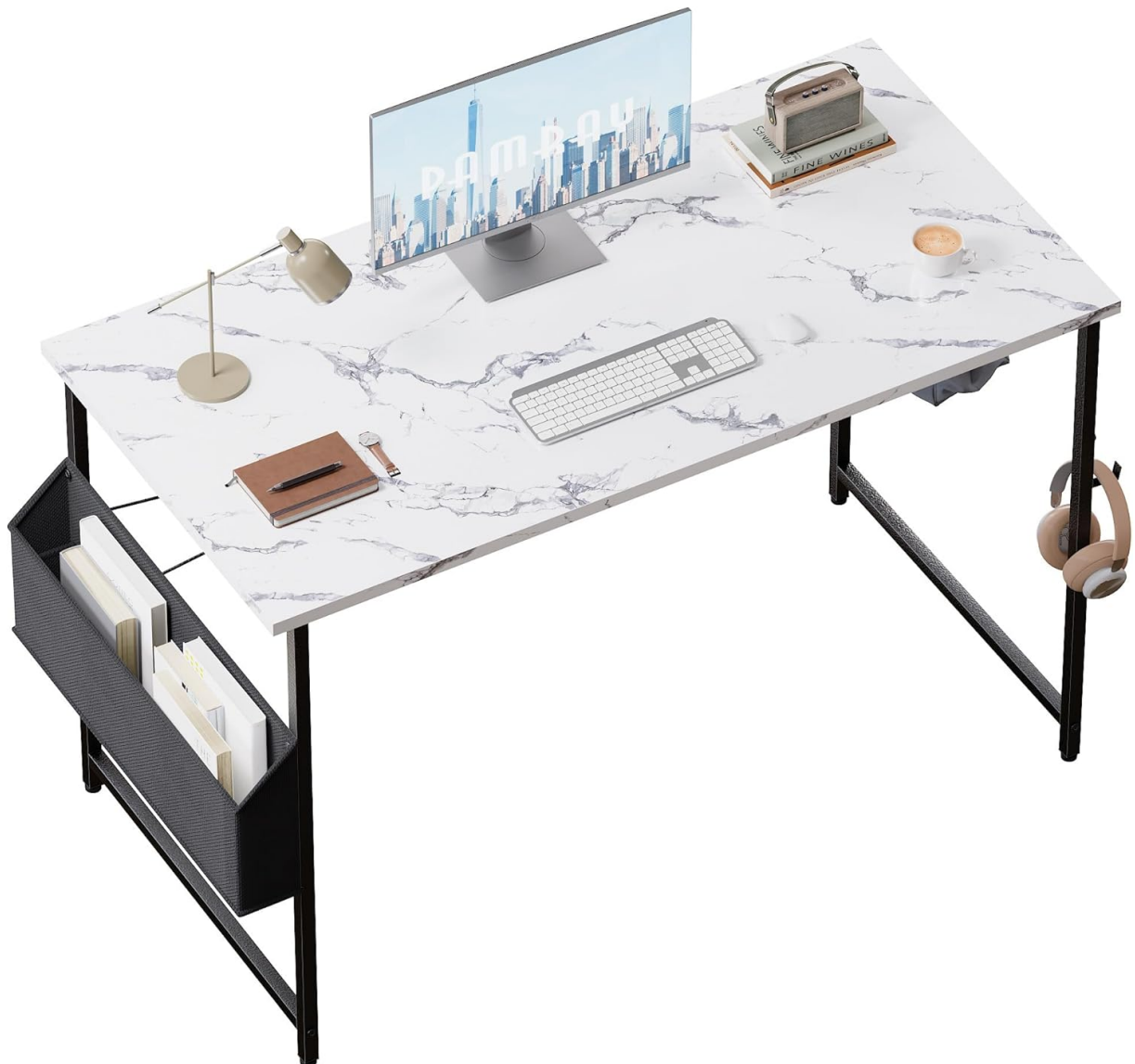
Image: The Pamray 47 Inch Computer Desk, featuring a marble-patterned top, black metal frame, and an attached side storage bag.

Thank you for choosing the Pamray 47 Inch Computer Desk. This manual provides detailed instructions for assembly, operation, maintenance, and troubleshooting to ensure you get the most out of your new desk. Designed for small spaces, this desk offers a functional workspace with convenient storage solutions.