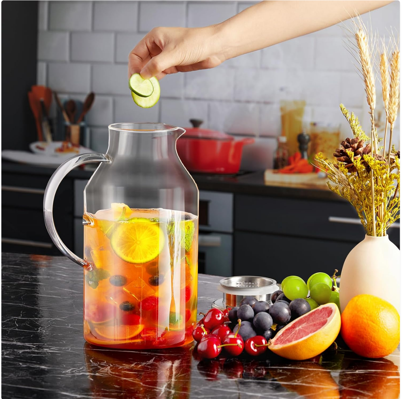
Figure 2: Preparing the pitcher for use, demonstrating the wide opening for adding ingredients.