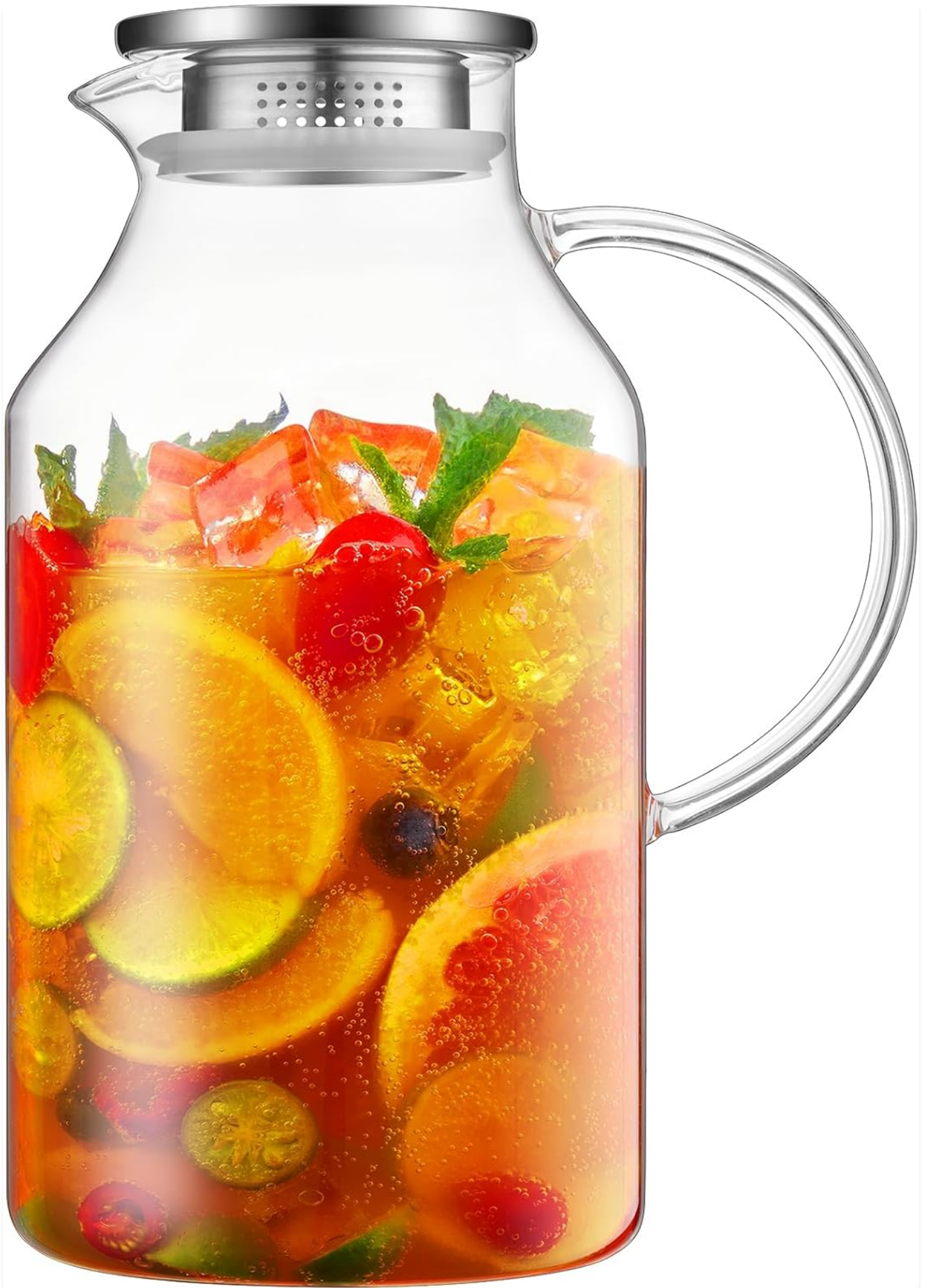
Figure 1: Bivvclaz Glass Pitcher with fruit-infused water, showcasing its clear design and capacity.