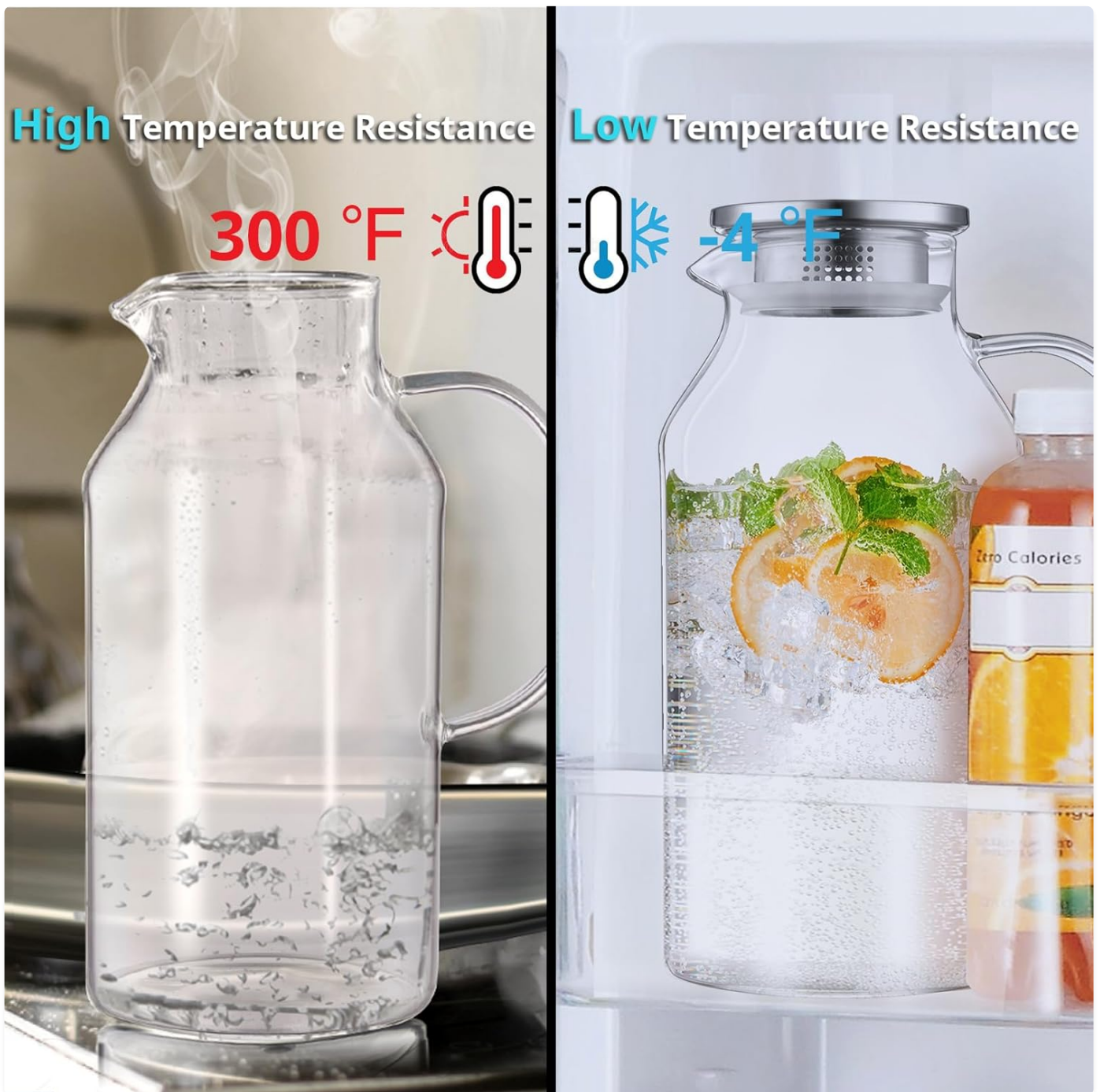
Figure 3: Demonstrating the pitcher's high and low temperature resistance for various beverages.