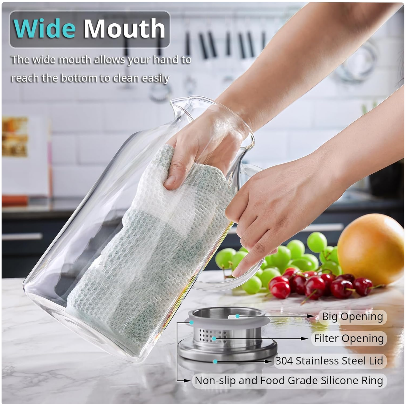
Figure 5: The wide mouth design facilitates easy hand cleaning of the pitcher's interior.

The wide mouth allows your hand to reach the bottom to clean easily