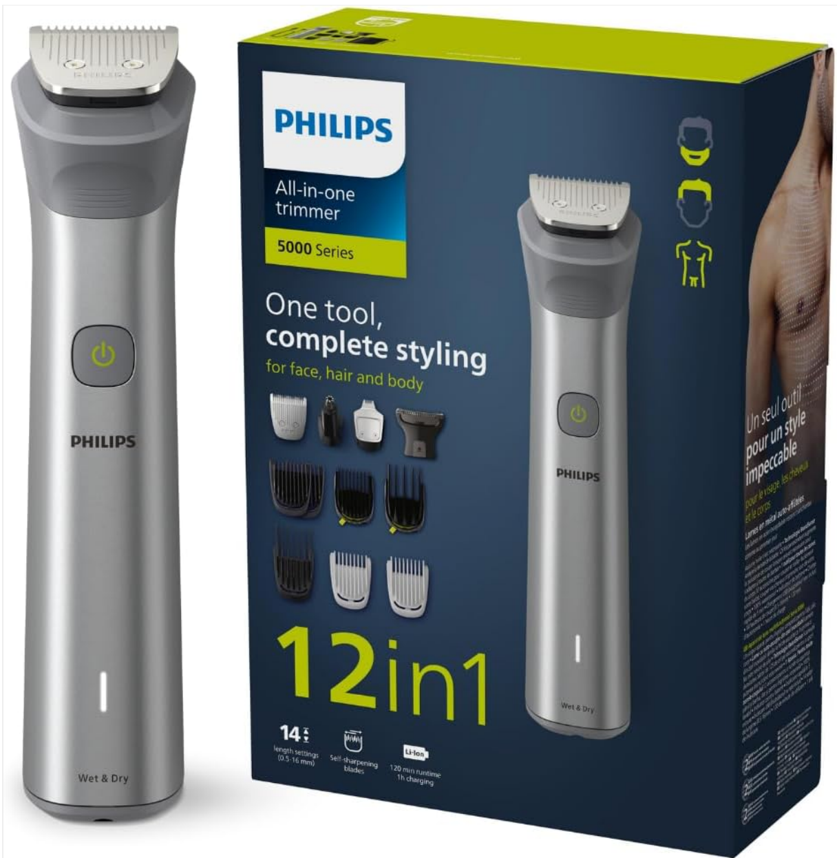
The Philips All-in-One Series 5000 Trimmer, model MG5950/15, shown alongside its retail packaging, highlighting its 12-in-1 versatility for face, hair, and body styling.