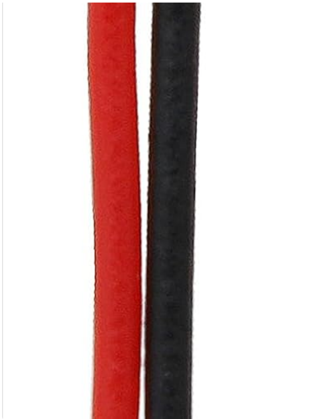
Image 4.1: Close-up view of the battery's two-pin connector. Ensure this connector is properly aligned and securely attached to the corresponding port on your headphone's circuit board during installation.