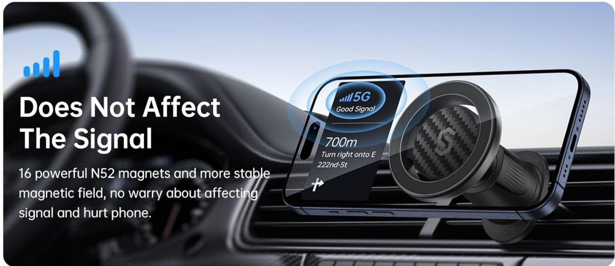
Image: Phone attached to the mount, illustrating the 360-degree flexible viewing angle.

16 powerful N52 magnets and more stable magnetic field, no worry about affecting signal and hurt phone.