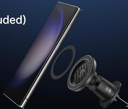
Image: Visual guide to device compatibility, showing direct MagSafe attachment and use with included metal rings for other phones.