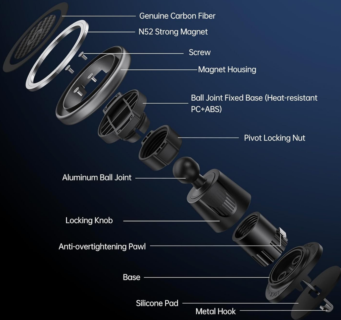
Image: Detailed breakdown of the mount's high-quality and well-constructed components.