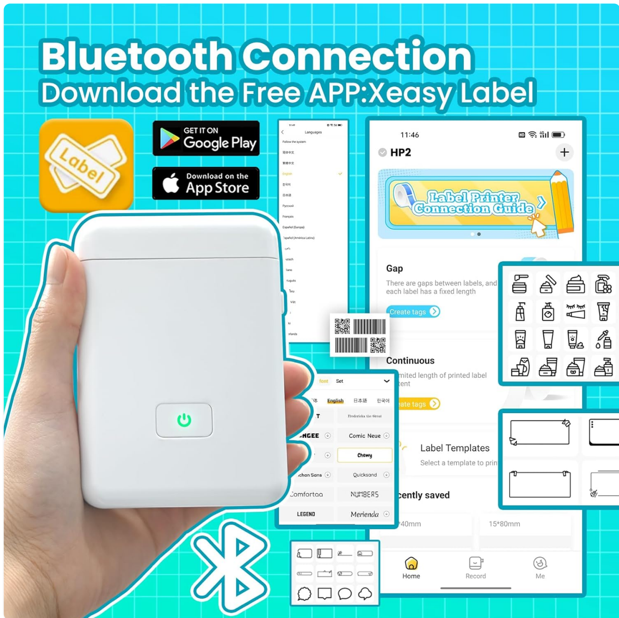
Figure 2: Visual guide for connecting the vretti HP2 label maker via Bluetooth and downloading the XeasyLabel app from app stores.