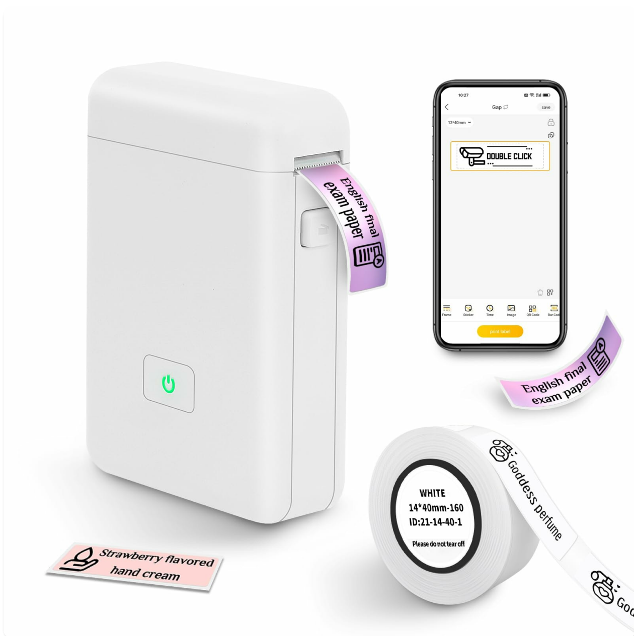
Figure 1: The vretti HP2 Portable Bluetooth Label Maker Machine, a compact white device with a power button, shown on a countertop.