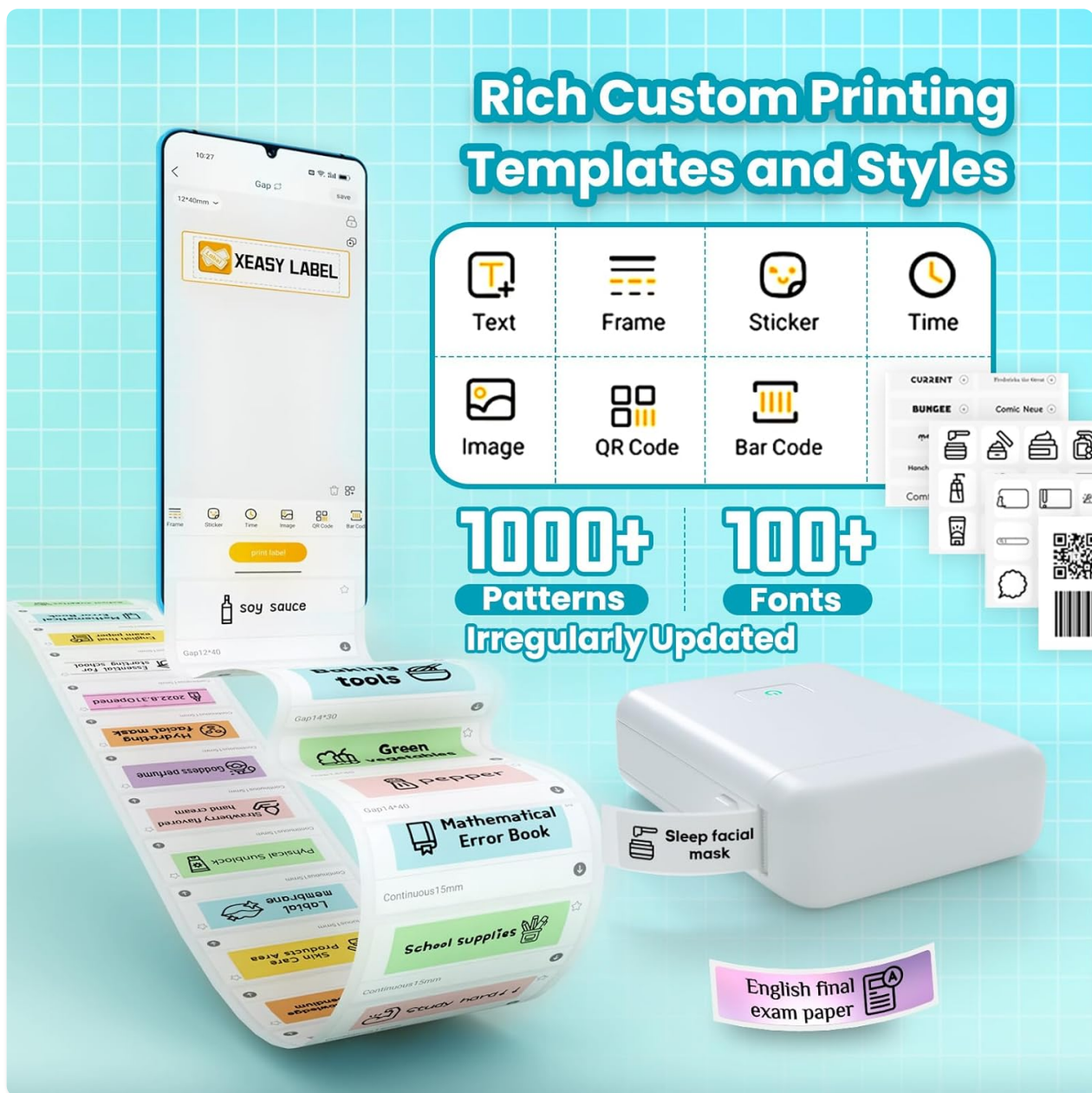
Figure 4: An overview of the XeasyLabel app's rich customization options, including various templates, patterns, and fonts for label design.