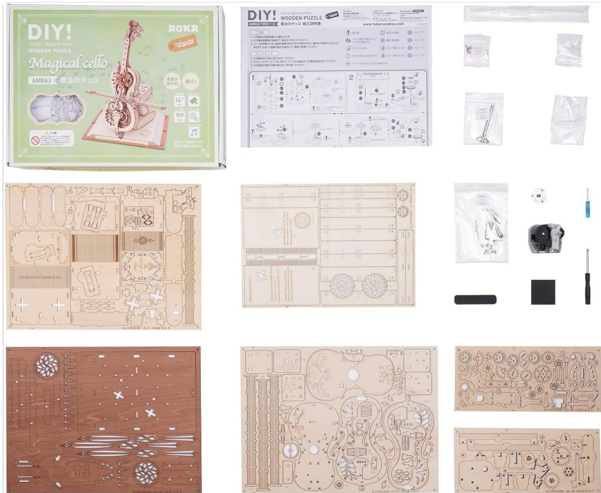
Image: Kit contents showing various wooden sheets, sandpaper, and other small parts.

If any parts are missing or damaged, please contact customer support for assistance.