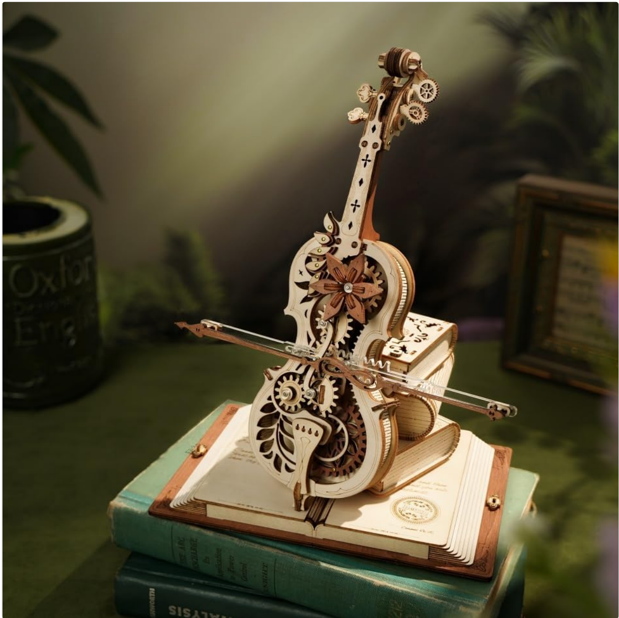
Image: The assembled music box in a display setting.