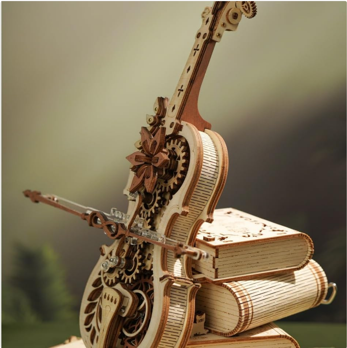
Image: Detailed view of the internal gears and decorative elements.