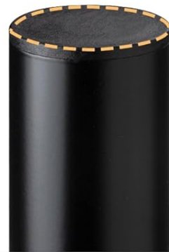
Image: Details of noise-free foam, U-shaped groove, and protective foot pads for enhanced bed frame performance.