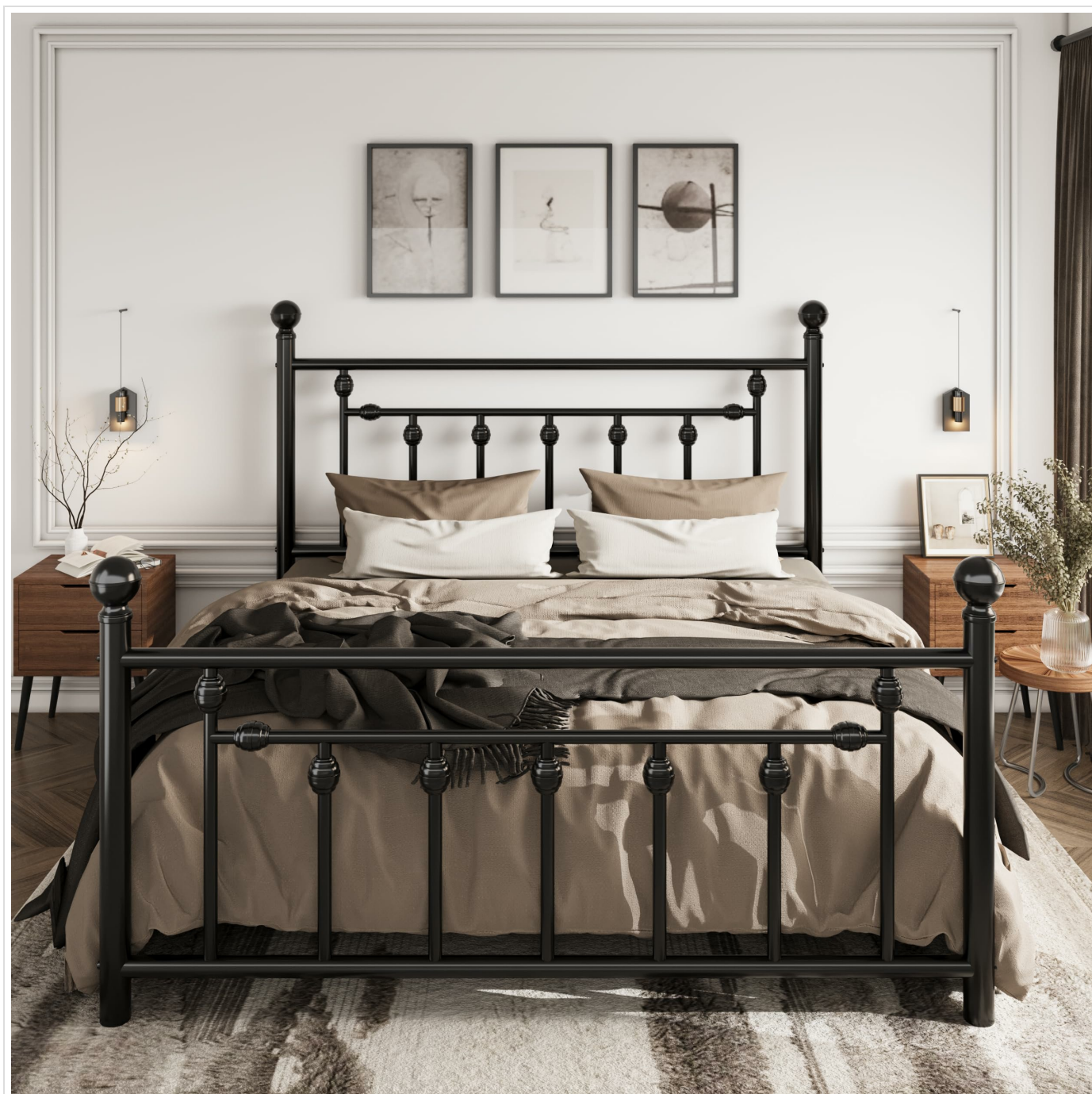
Image: SHA CERLIN Full Size Metal Platform Bed Frame in black with Victorian headboard and footboard, shown in a bedroom setting.