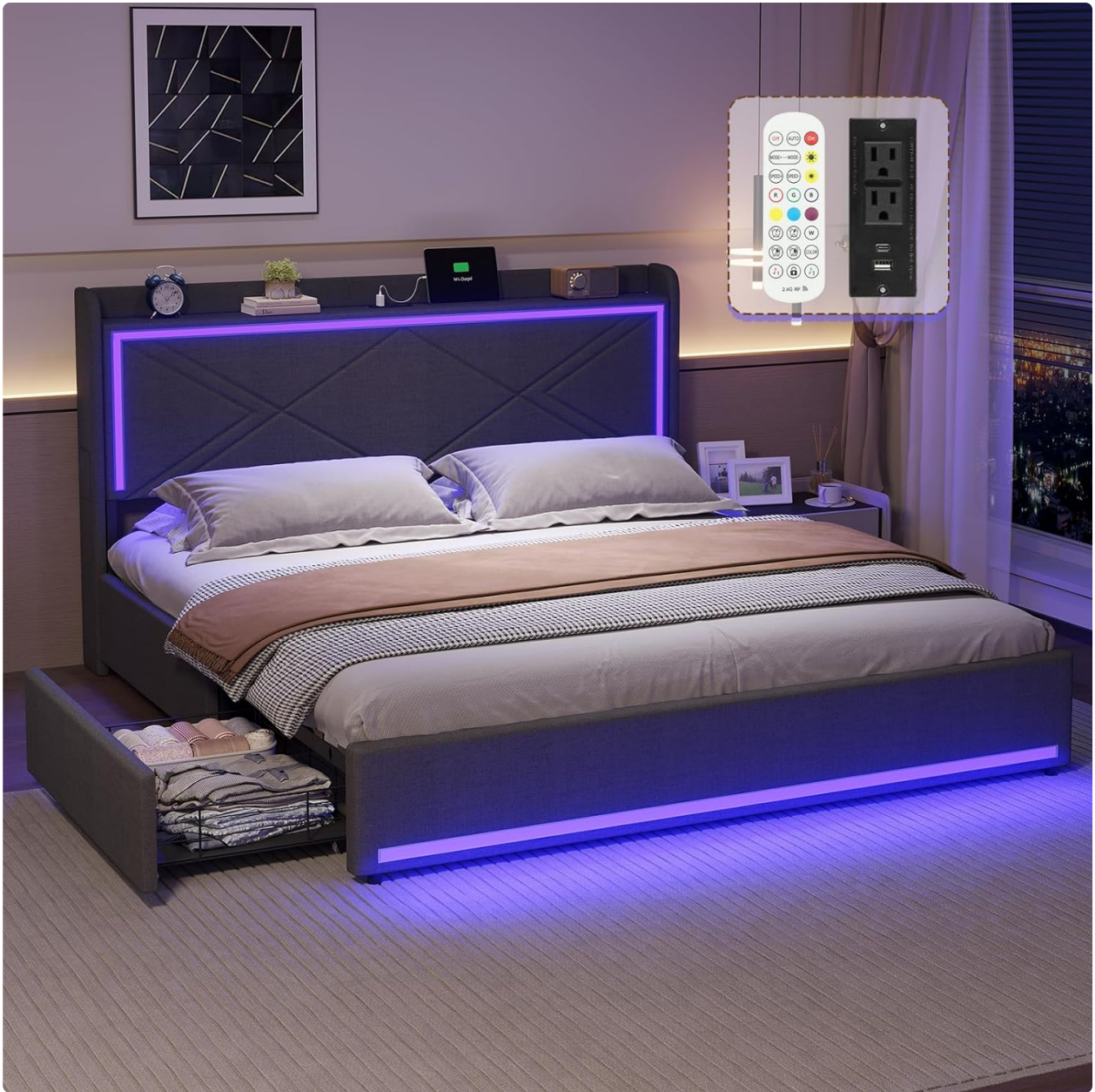
Image 1.1: BTHFST Queen Bed Frame with RGB LED lights and integrated charging station.