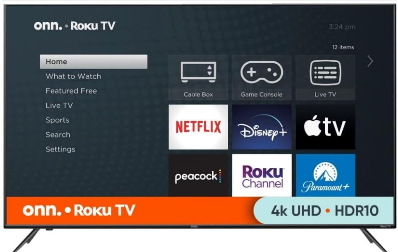
Figure 4: The main home screen of the ONN Roku TV, showing various streaming app icons and input options.

The ONN Smart TV features the intuitive Roku operating system. The home screen provides easy access to live TV, streaming services, and connected inputs. You can customize your home screen by adding or rearranging channels.