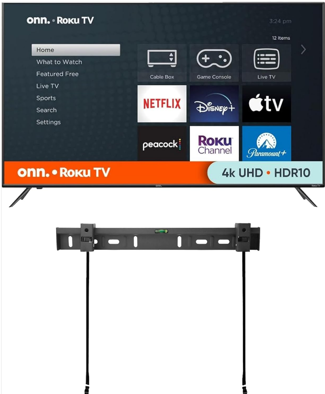
Figure 1: ONN 50-Inch 4K Smart TV with its accompanying wall mount.