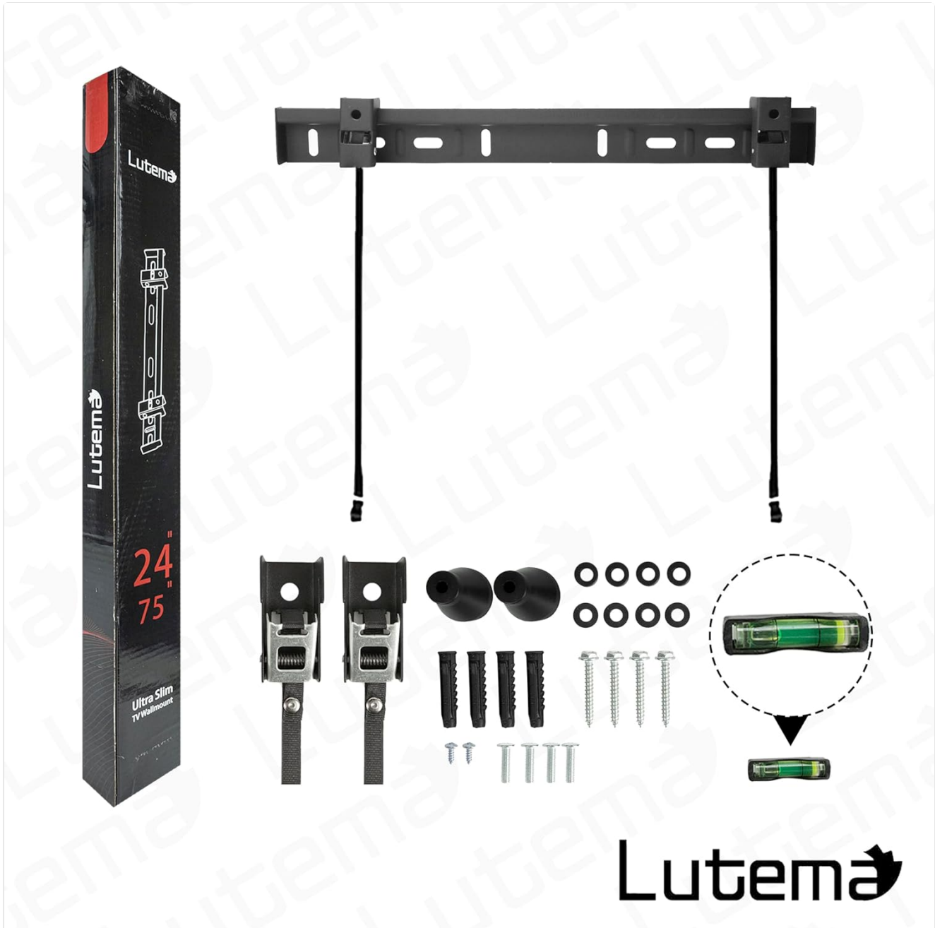
Figure 2: Components of the wall mount kit, including the main bracket, TV brackets, and mounting hardware.