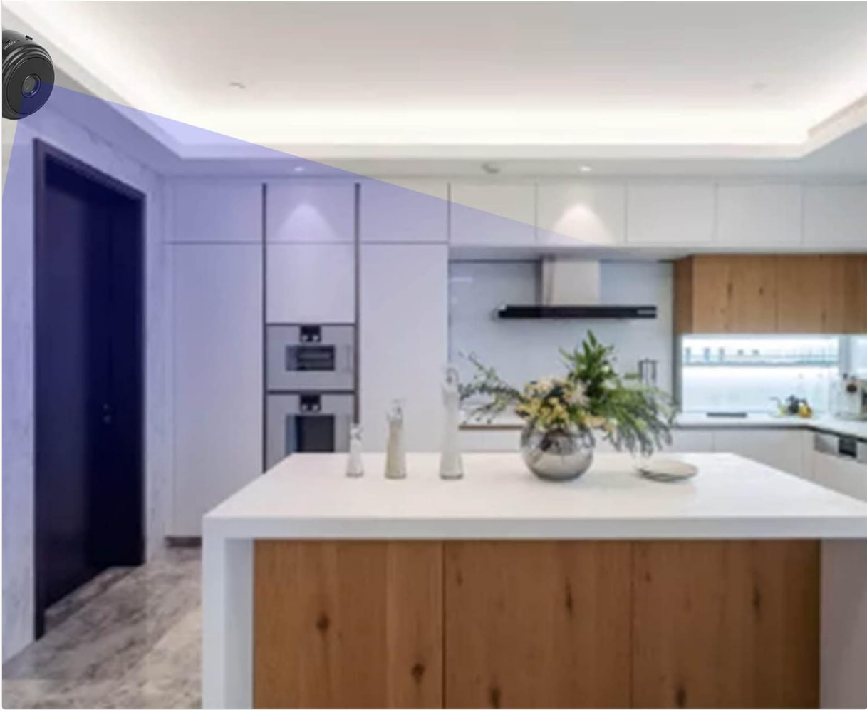
Figure 6.1: The camera's wide-angle view captures a broad area, suitable for rooms like kitchens.

The camera features 120° wide angle lens and 720P, camera is able to take and record details clearly.