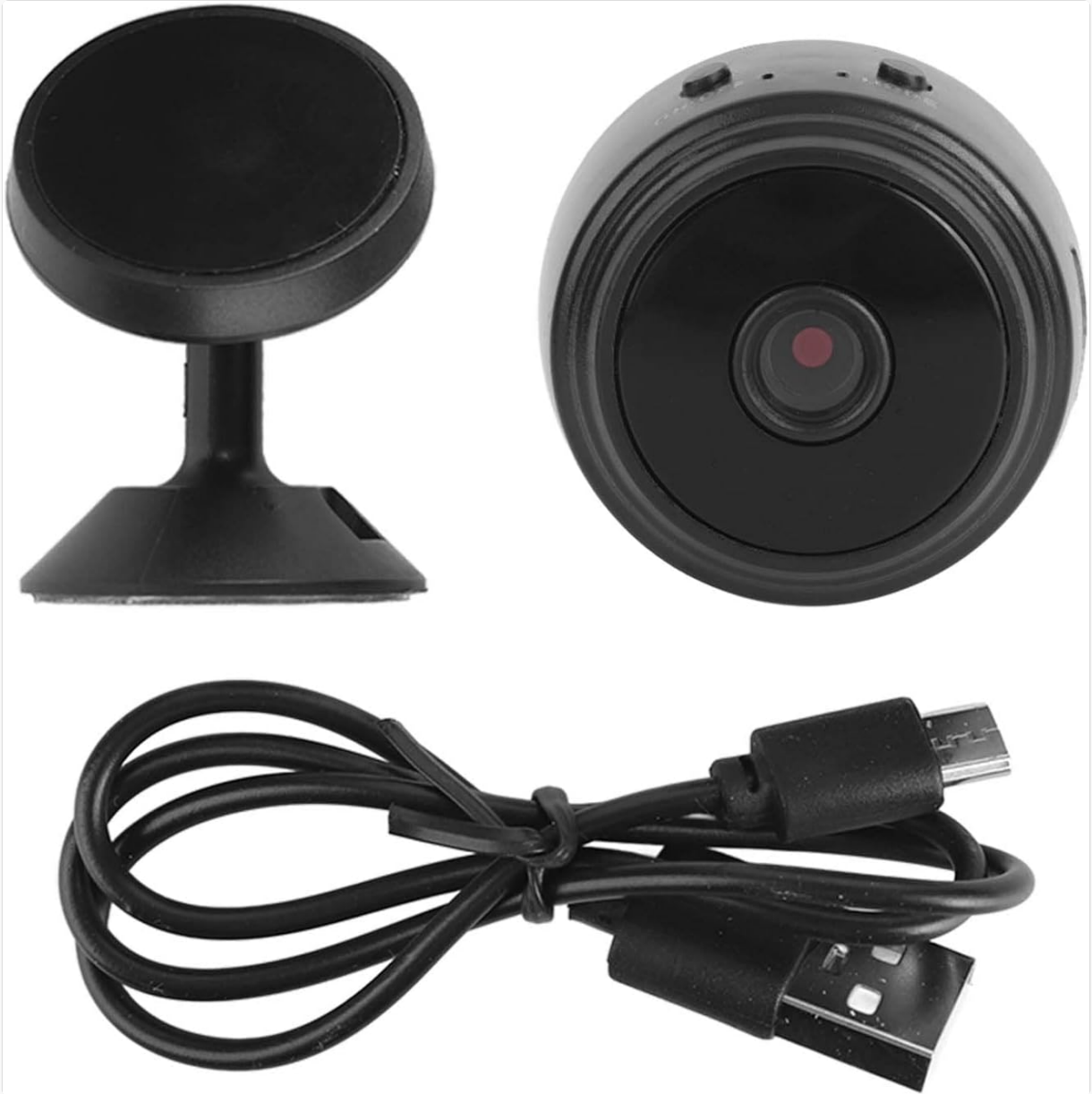
Figure 3.1: Included components of the Walfront Indoor Security Camera.