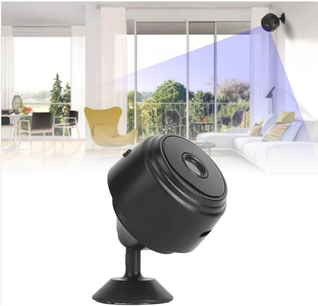
Figure 4.1: Walfront Indoor Security Camera in a typical indoor setting.