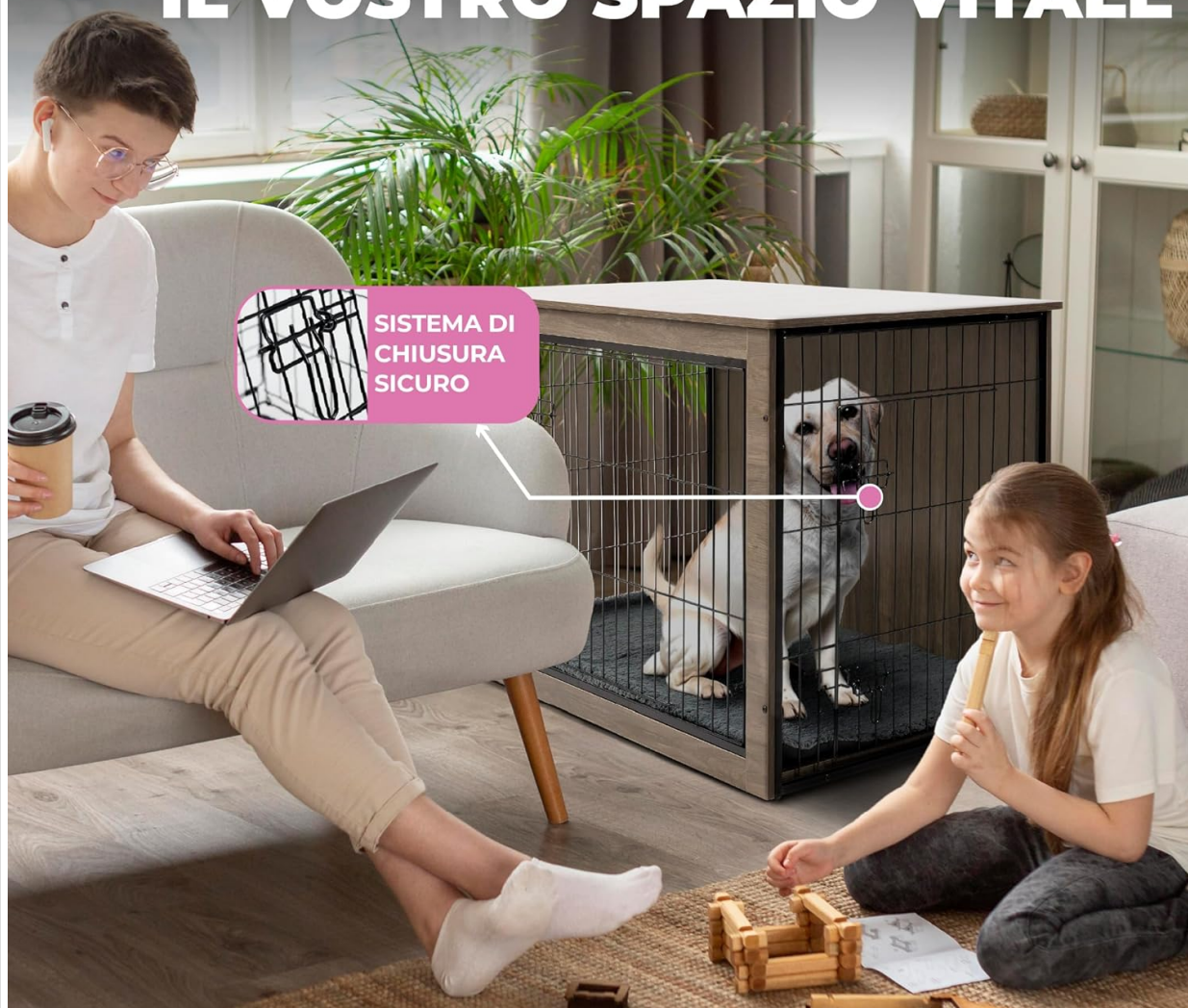
Image Description: The dog crate blends seamlessly into a home environment, providing a safe and stylish space for your pet. The image highlights the secure locking mechanism on the crate door, ensuring pet security.