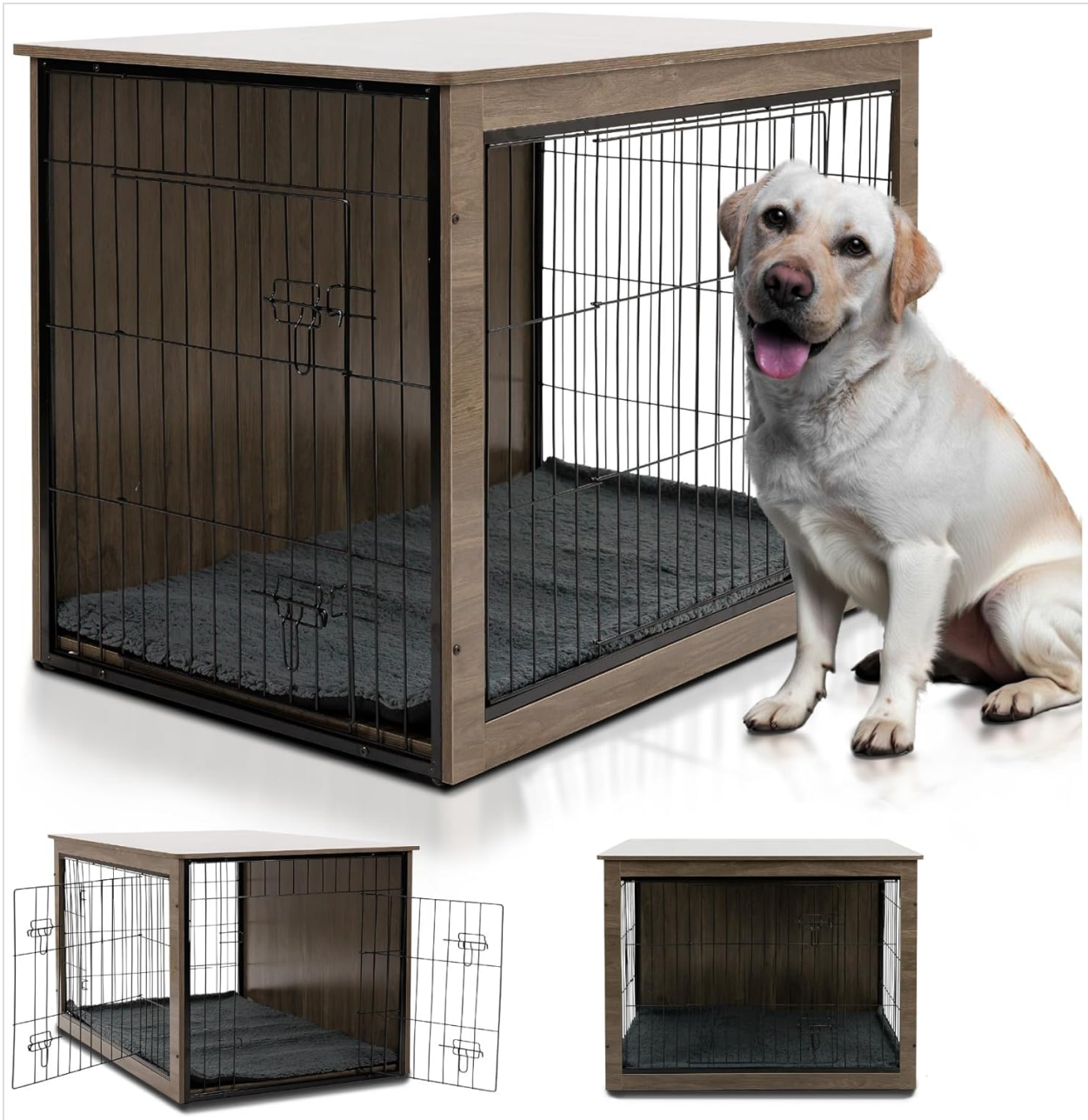
Image Description: The MaxxPet dog crate, featuring a wooden frame and metal bars, provides a comfortable and secure space for your dog. A soft mat is included for added comfort. This image shows the fully assembled crate with a dog.

edges or loose components that could harm your pet.