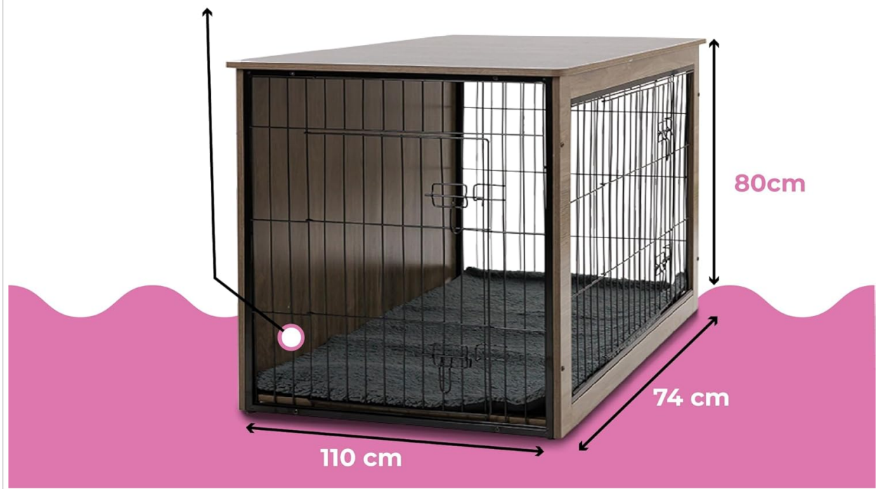
Image Description: This diagram shows the overall dimensions of the MaxxPet dog crate (110 cm length, 74 cm width, 80 cm height) and includes a guide for appropriate dog body measurements (35-50cm body height, 50-70cm body length) to ensure a comfortable fit. It also highlights the soft floor mat.