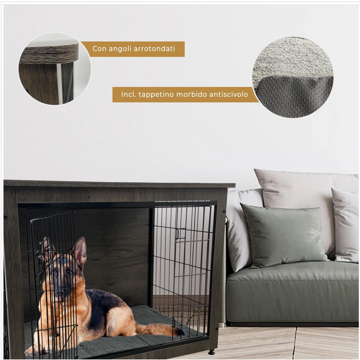
Image Description: This image provides a closer look at the design details, specifically the rounded corners for safety and aesthetics, and the soft, anti-slip mat that comes with the crate for your pet's comfort.