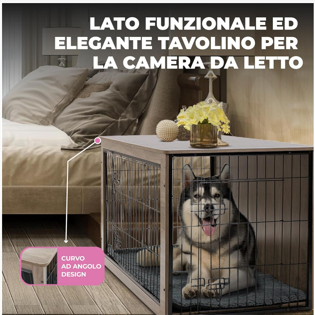
Image Description: This image demonstrates the versatility of the MaxxPet dog crate, showing it used as a stylish and functional bedside table, integrating pet comfort with home decor. The curved angle design is also highlighted.