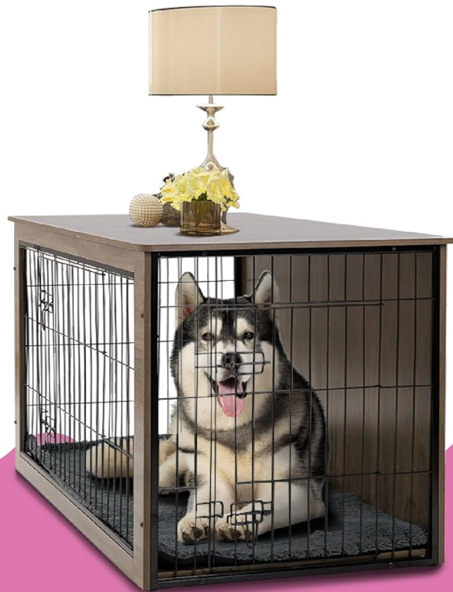
Image Description: This infographic illustrates key features of the MaxxPet dog crate, including its multifunctional design, enhanced ventilation for pet comfort, robust wood construction for durability, and use of eco-friendly materials.