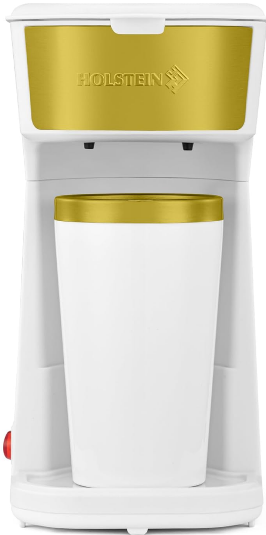
Figure 1: Front view of the Holstein Housewares Personal Coffee Maker, showcasing its compact design and included travel mug.

The Holstein Housewares Personal Coffee Maker is designed for convenience and efficiency, allowing you to enjoy a fresh cup of coffee quickly.