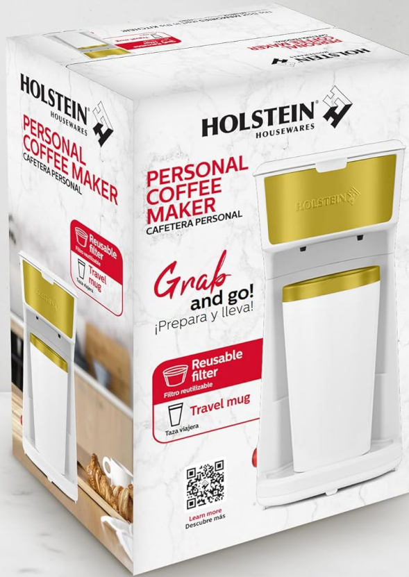
Figure 5: The included 14oz stainless steel travel mug, designed for convenience and easy cleaning.