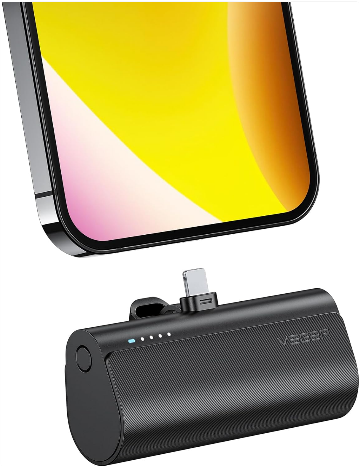
Image: The VEGER Mini Portable Charger, a compact black device, shown connected to the bottom of an iPhone, illustrating its direct plug-in design.