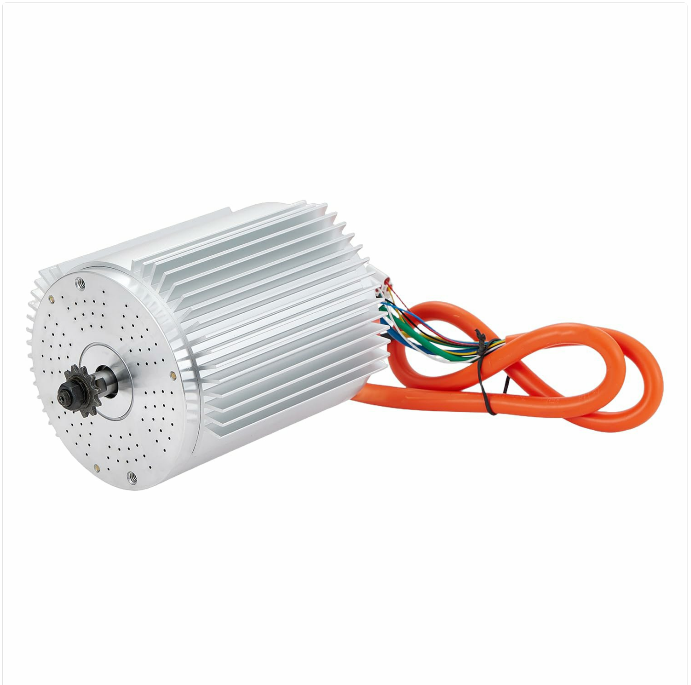
Figure 1.1: Kunray 48V 2000W Electric DC Motor with wiring harness.