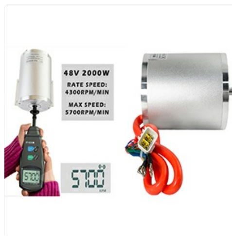
Figure 5.1: Illustration of motor speed measurement.

The motor's rated speed is 4300 RPM, with a maximum speed capability of 5700 RPM. The torque output is approximately 5.4 N/M, suitable for propelling vehicles with a load capacity of 100-200 KG. Monitor motor temperature during extended operation, especially under heavy loads, using the integrated temperature sensor.