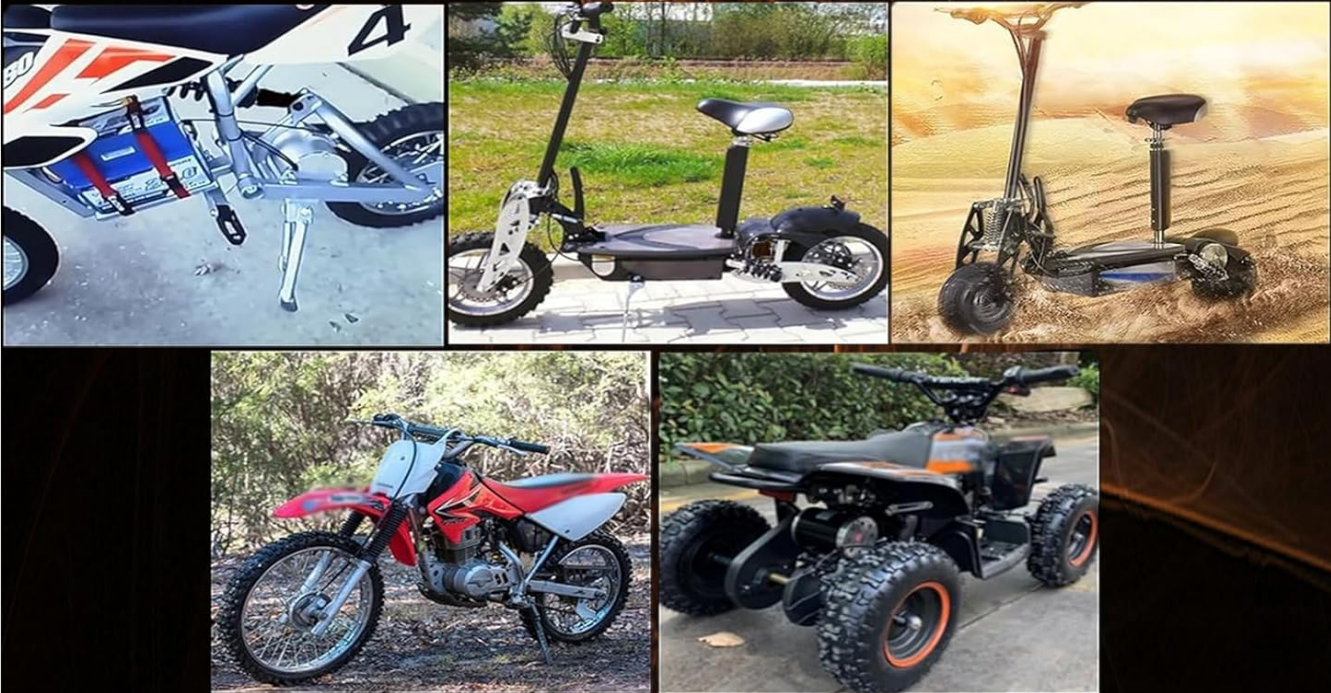
Figure 8.1: Examples of electric vehicles compatible with the Kunray motor.

THIS PRODUCT CAN BE USED IN MULTIPLE SITUATIONS: ELECTRIC SCOOTER UPGRADES, ELECTRIC OFF-ROAD VEHICLE PARTS REPLACEMENT