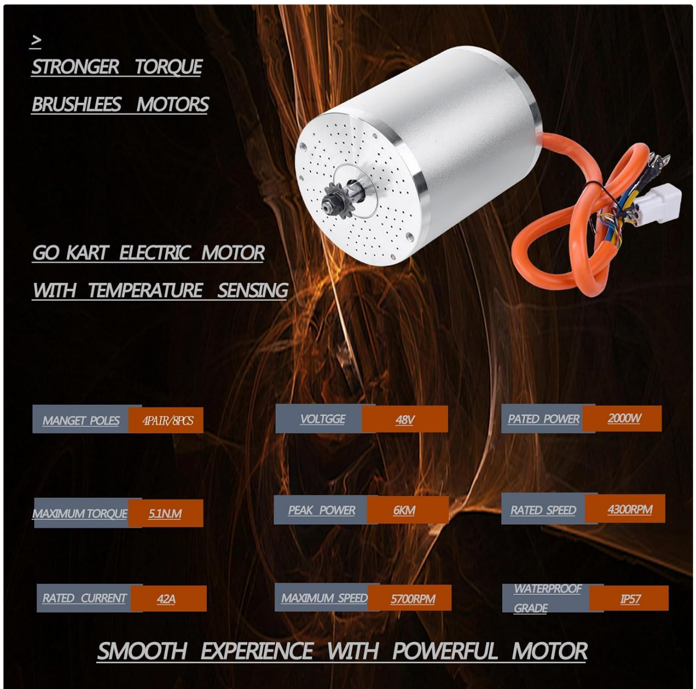
Figure 3.1: Key performance specifications of the Kunray motor.