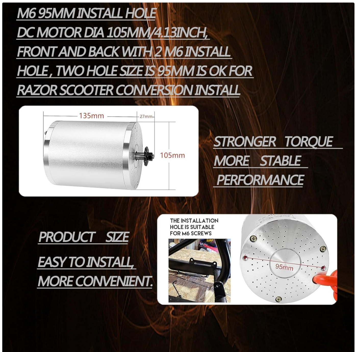
Figure 4.1: Motor dimensions and details of the M6 installation holes.

The motor features M6 installation holes with a 95mm spacing on both the front and back, making it versatile for various mounting configurations. The motor diameter is 105mm (4.13 inches).