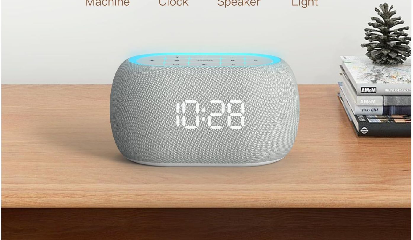
Image: The ANJANK device highlighting its four primary functions: Sound Machine, Alarm Clock, Bluetooth Speaker, and Night Light.