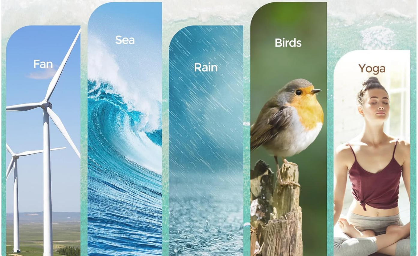
Image: Visual representation of the 21 soothing sounds available, categorized into White Noise, Fan Sounds, and Nature Sounds.