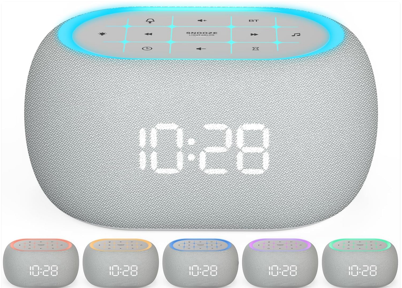
Image: The ANJANK sound machine displaying the time, with examples of different night light colors.