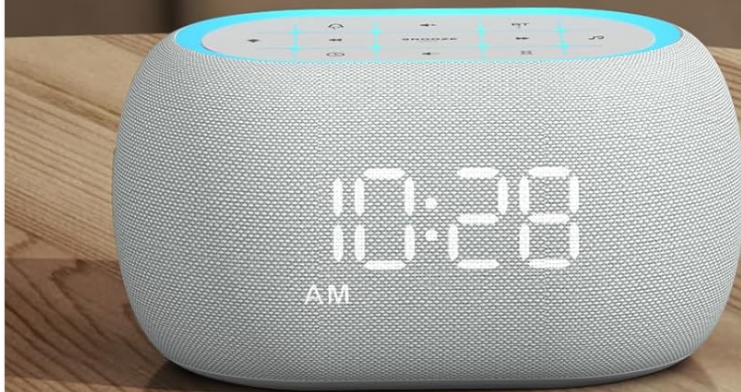
Image: Key features of the alarm clock, including the number of ringtones, dimmer functionality, and volume control.