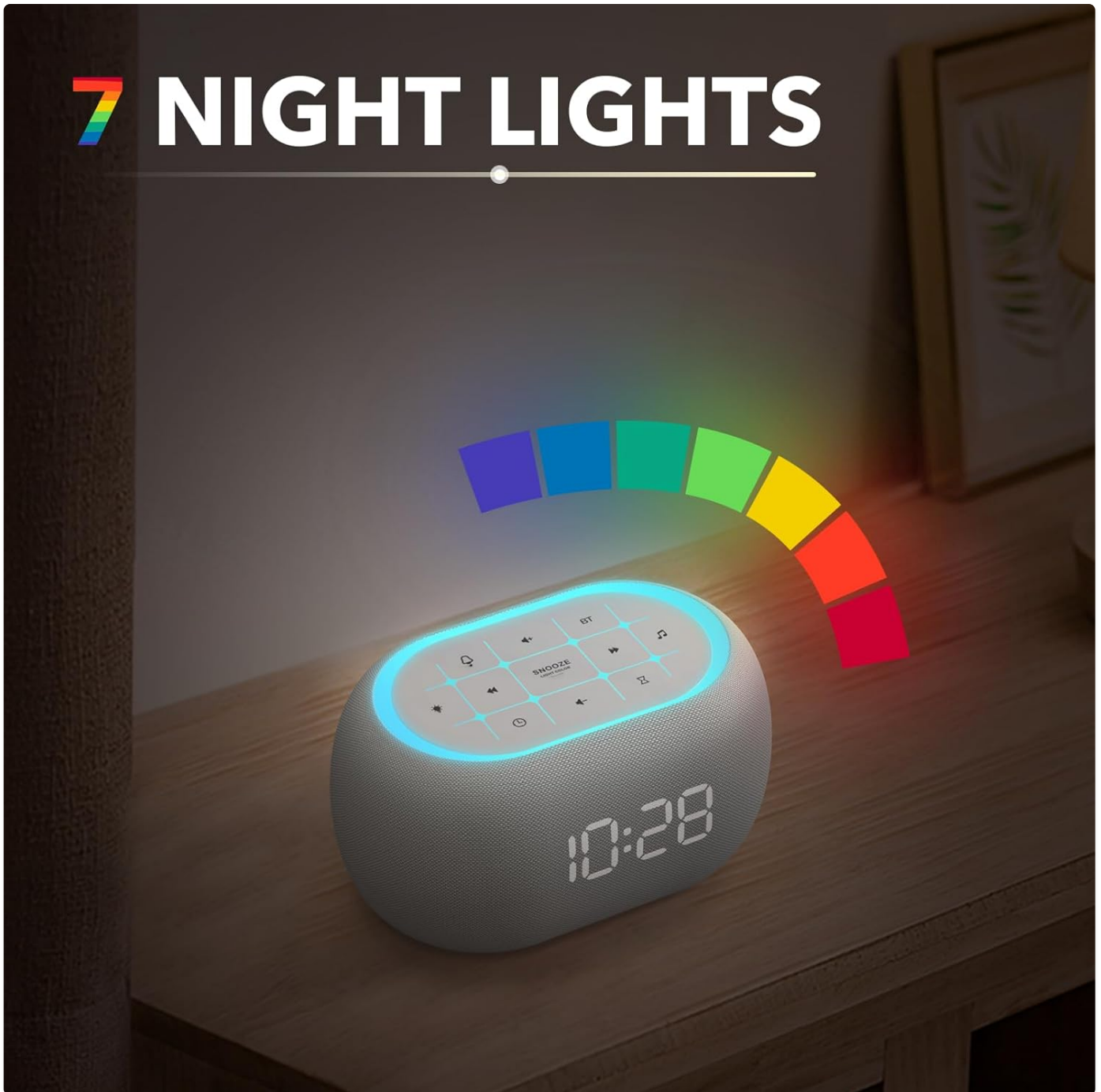
Image: Illustrates the seven available night light colors, ranging across the spectrum.