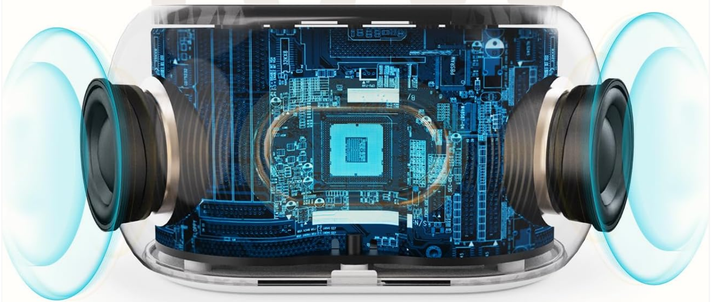
Image: An internal view highlighting the 10W dual speakers, emphasizing high sound quality.