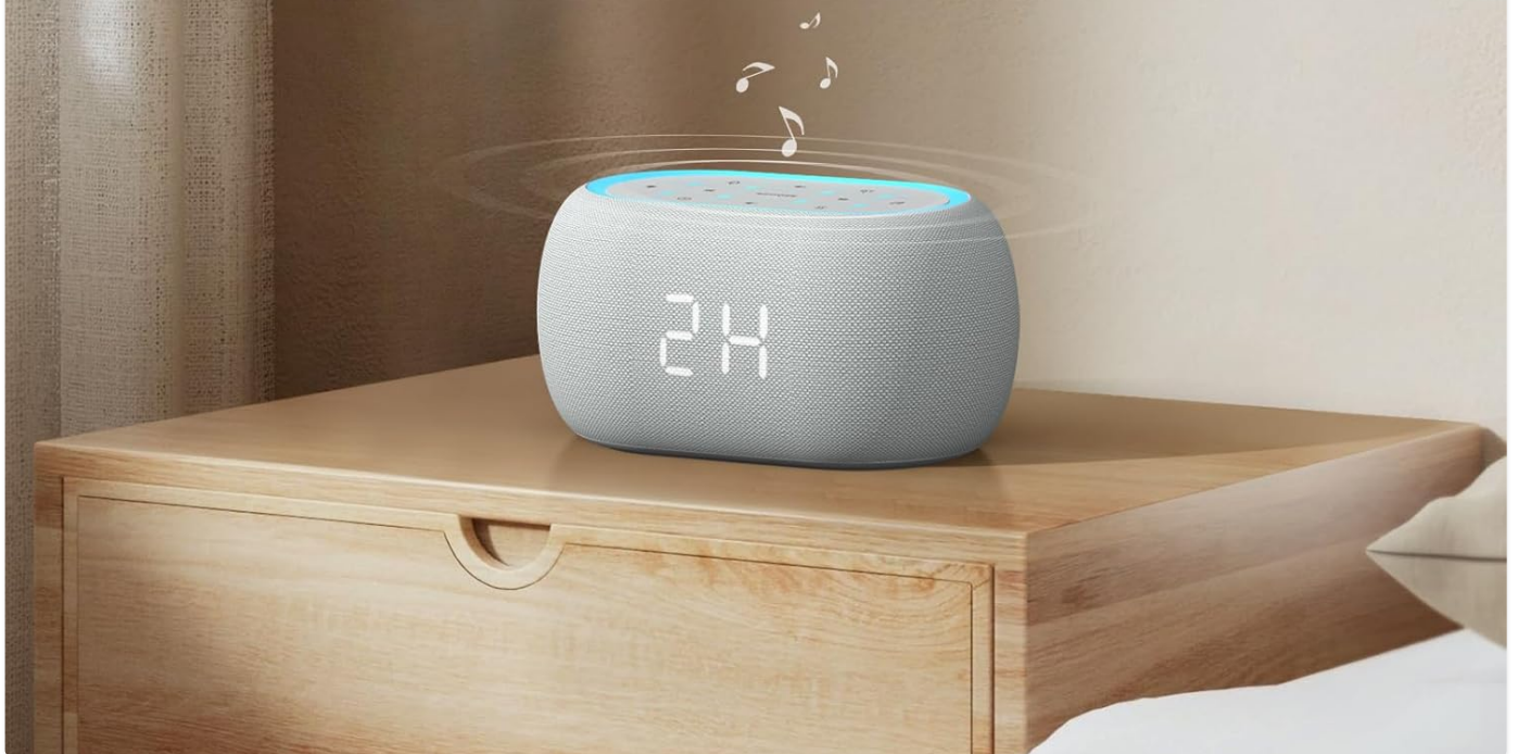
Image: Displays the auto-off timer settings, offering options for 1, 2, 3, or 4 hours.