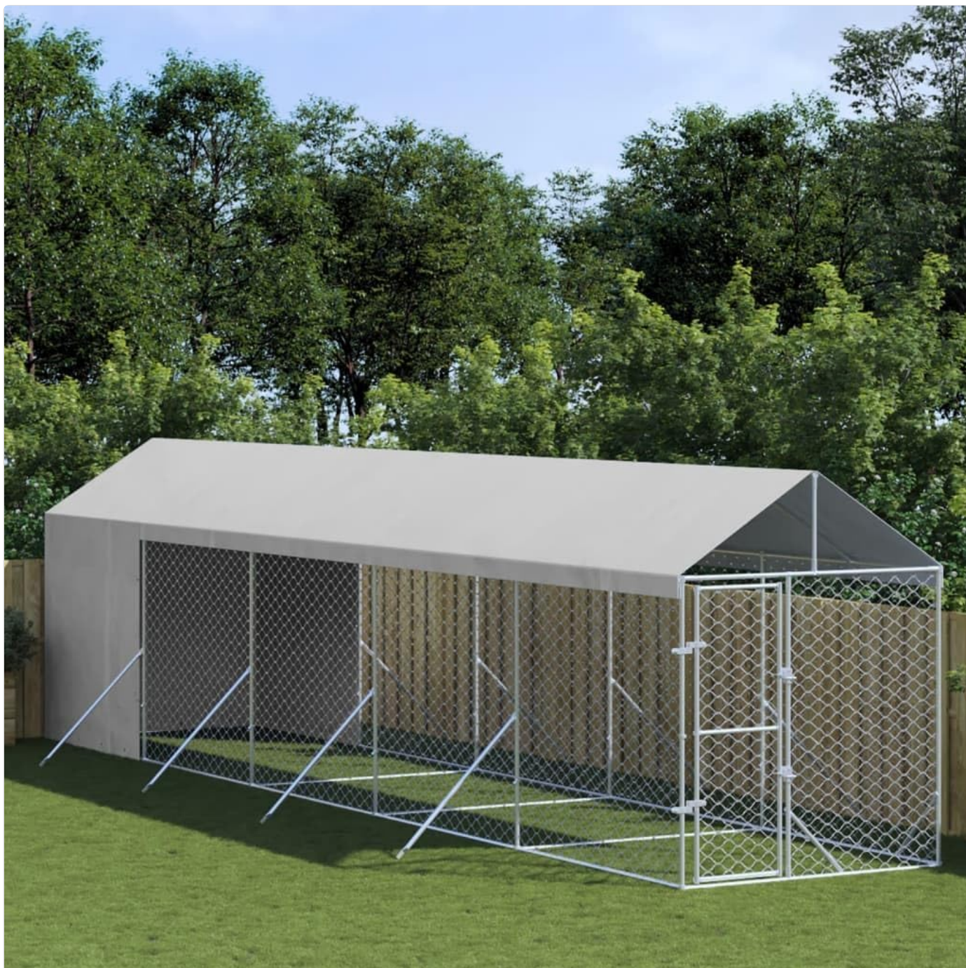
Image 4.1: The assembled kennel situated in an outdoor environment. This image provides a visual reference for the completed structure in a typical setting.