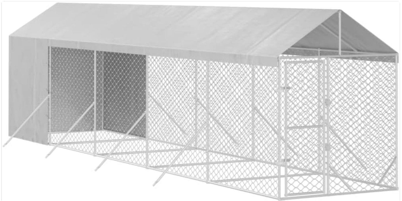
Image 1.1: Overview of the vidaXL Outdoor Dog Kennel. This image displays the full structure of the kennel, highlighting its spacious design and the silver roof.

The vidaXL Outdoor Dog Kennel with Silver Roof is designed to provide a safe and comfortable outdoor enclosure for various small animals, including dogs, chickens, rabbits, and ducks. Its robust construction of galvanized steel ensures durability, while the polyethylene roof and side walls offer protection against sun, rain, and snow. The mesh design promotes ventilation, and a lockable door enhances security for your pets.