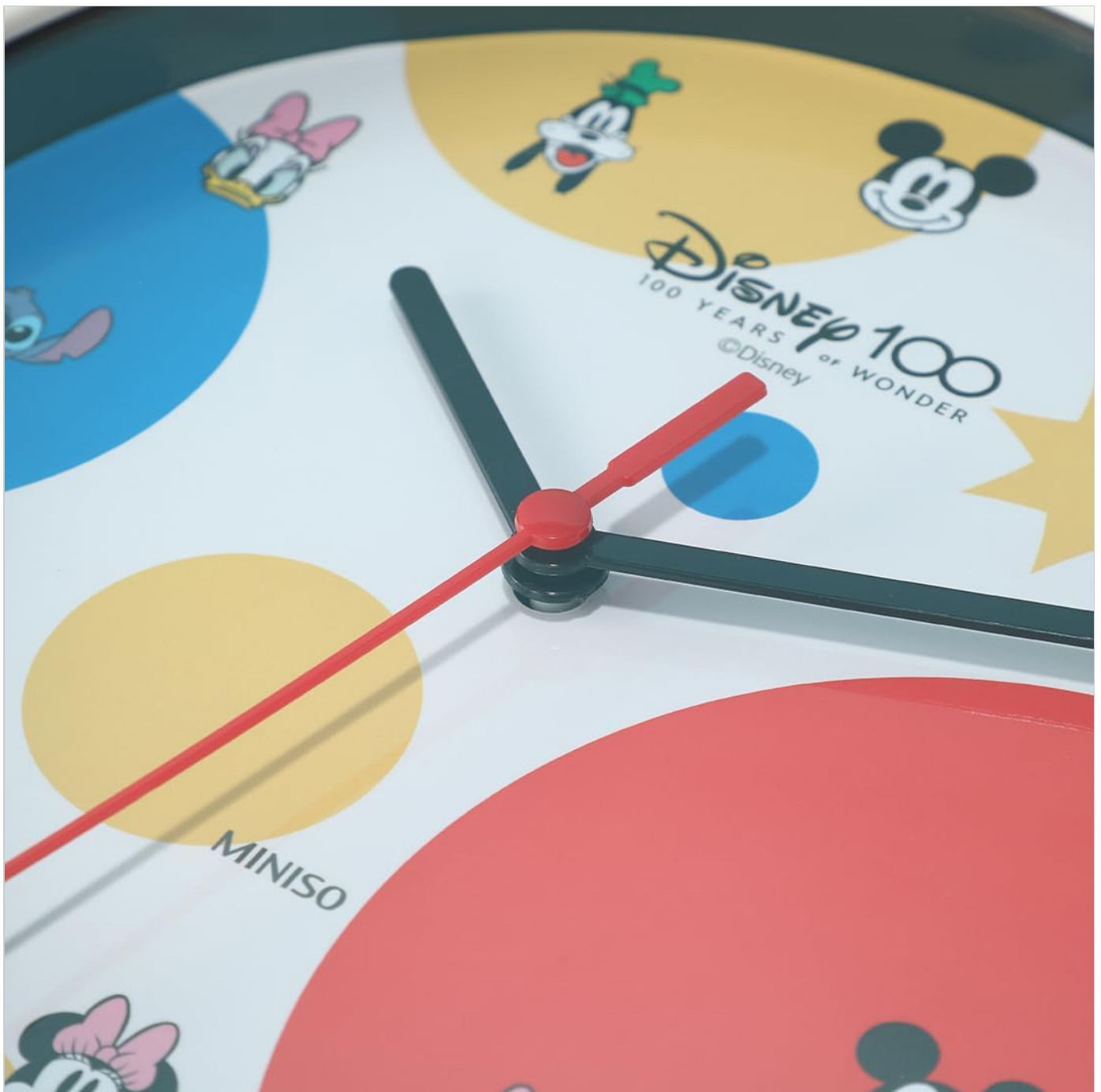
Image 1.1: Front view of the MINISO Disney 100 Celebration Wall Clock, highlighting its colorful character design and clear analog display.