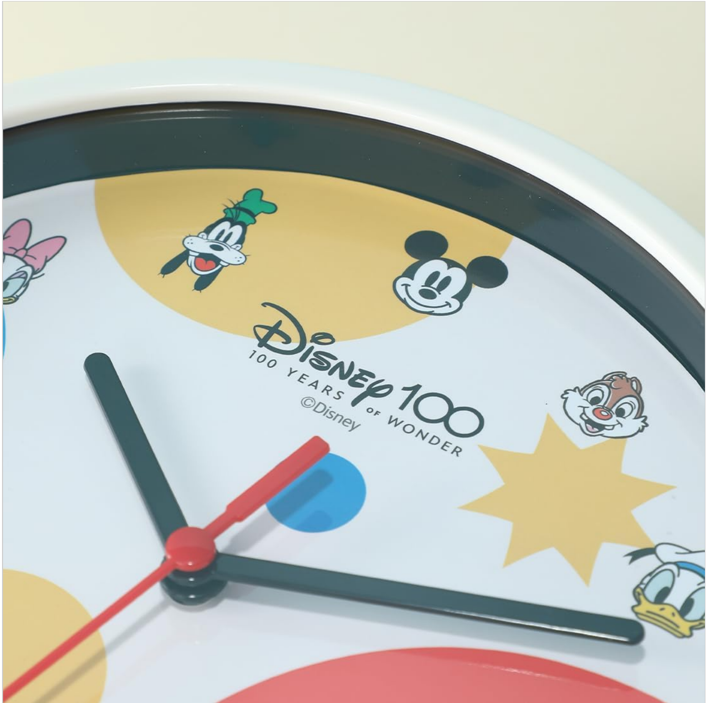
Image 5.1: Detail of the clock face and hands, illustrating the analog time display.