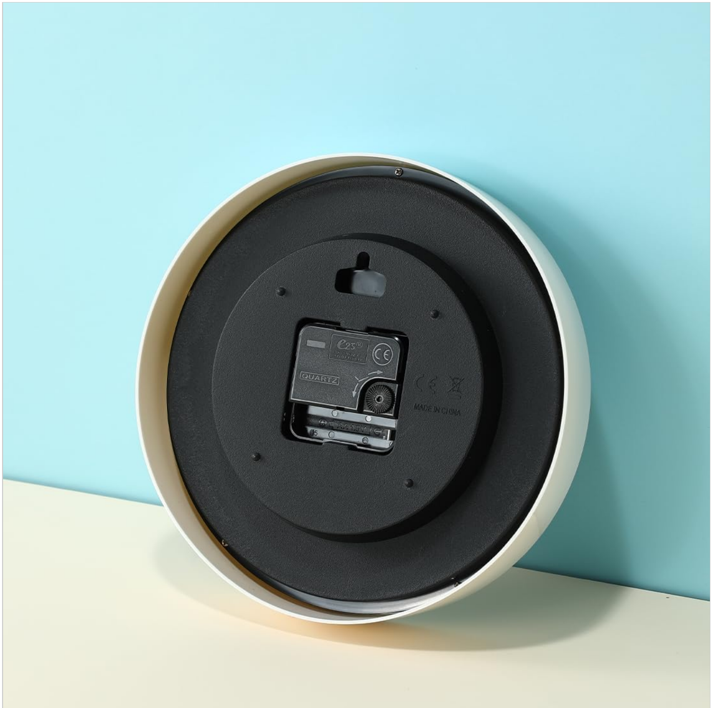
Image 4.1: Rear view of the clock, illustrating the battery compartment and wall mounting hook.