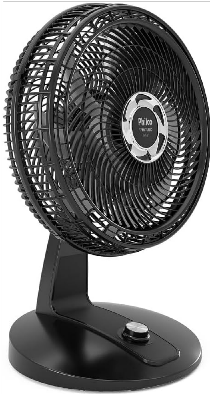
Figure 2: Side view of the fan, illustrating its base and adjustable head for various angles.