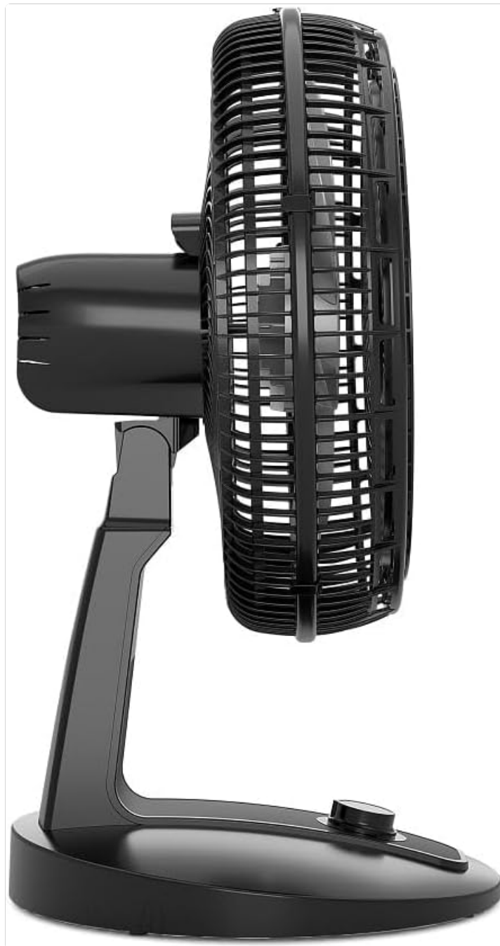
Figure 3: Detail of the control knob on the fan's base, used for power and speed selection.