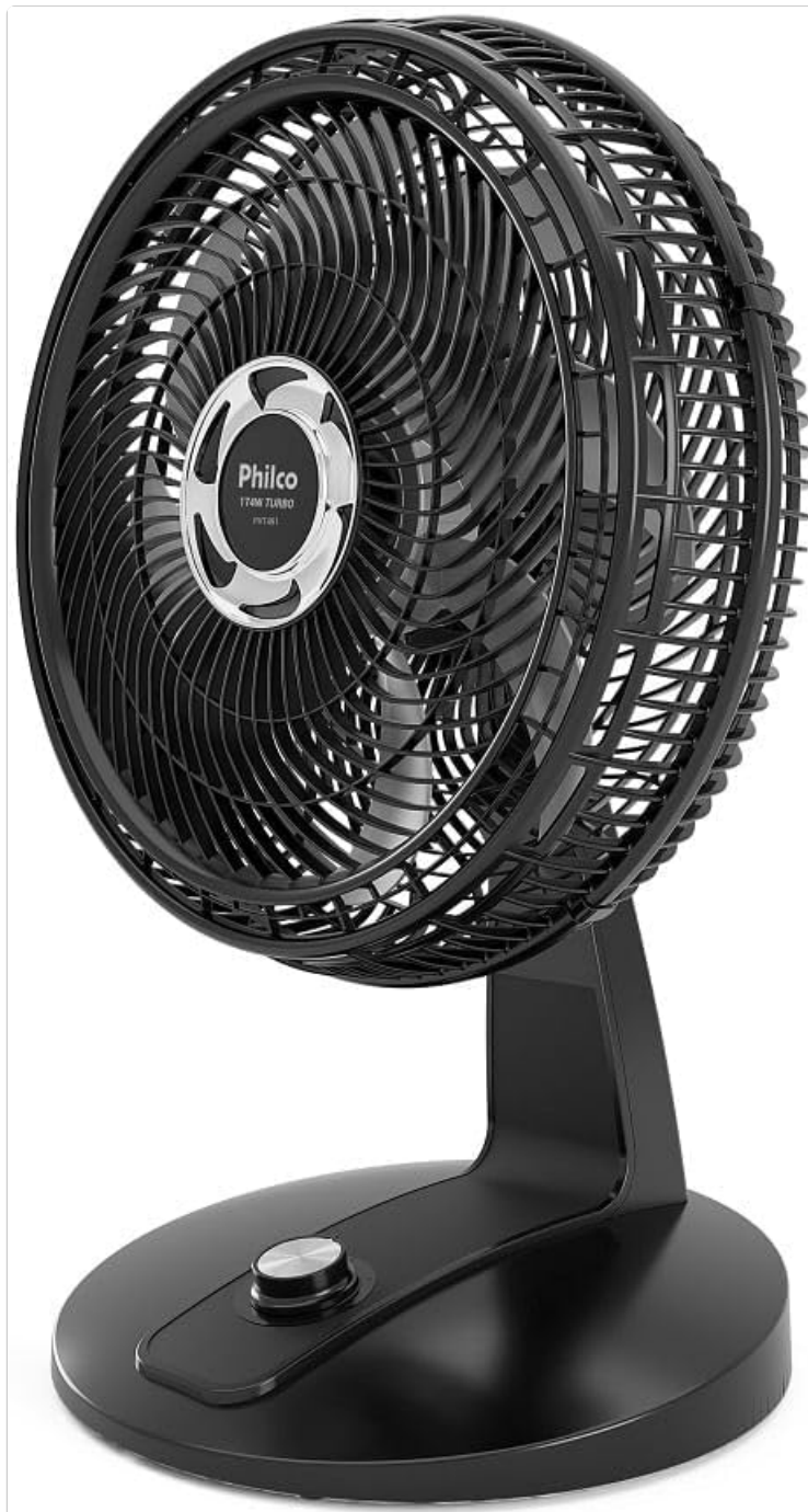
Figure 1: Front view of the Philco PVT491 Maxx Force 2-in-1 Fan, showcasing its 8-blade design and protective grille.