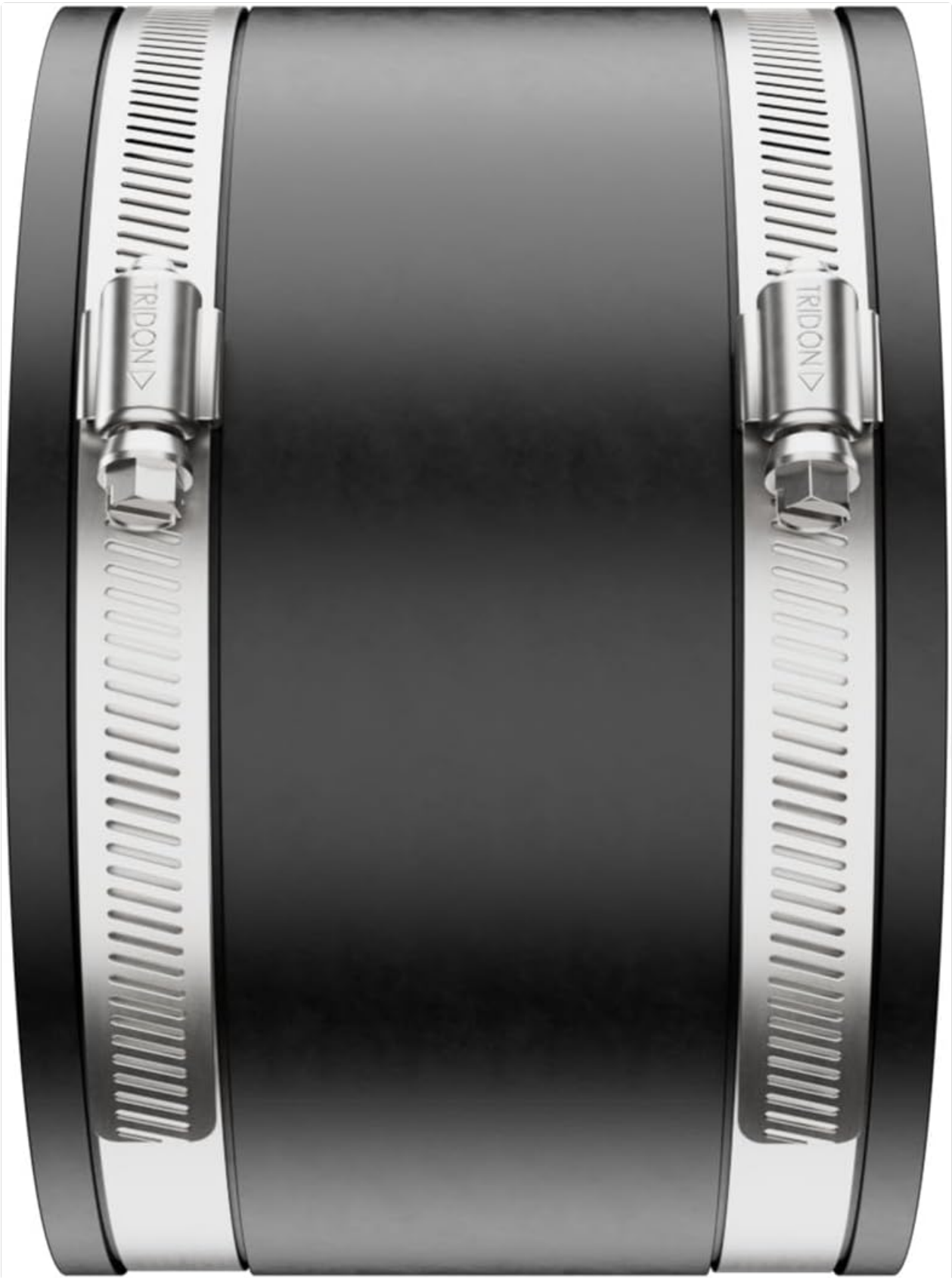
Side view of the Fernco P1001-88 Flexible PVC Pipe Coupling, showing the flexible PVC body and stainless steel clamps.