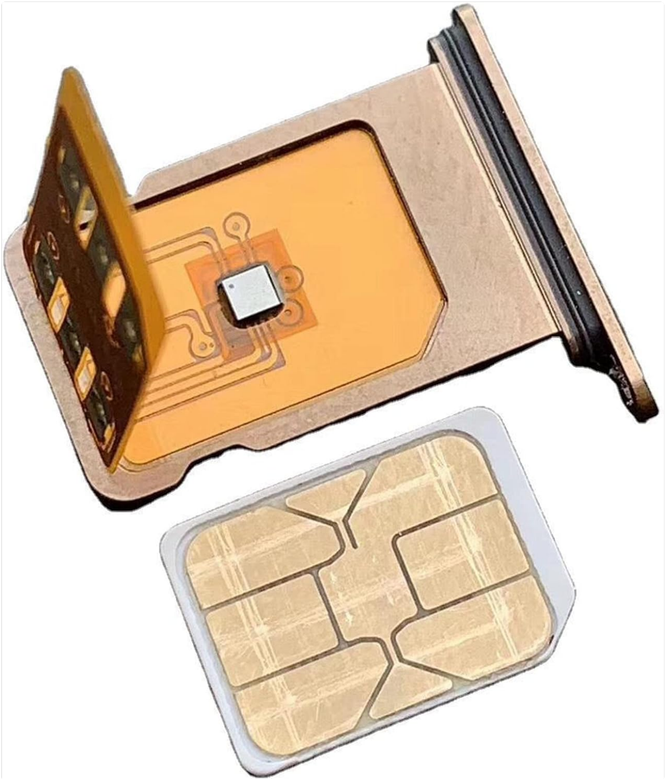
Image: A detailed view showing the USIM Unlocking Card being carefully placed into the SIM card tray of a mobile phone. This demonstrates the correct orientation and positioning for installation.