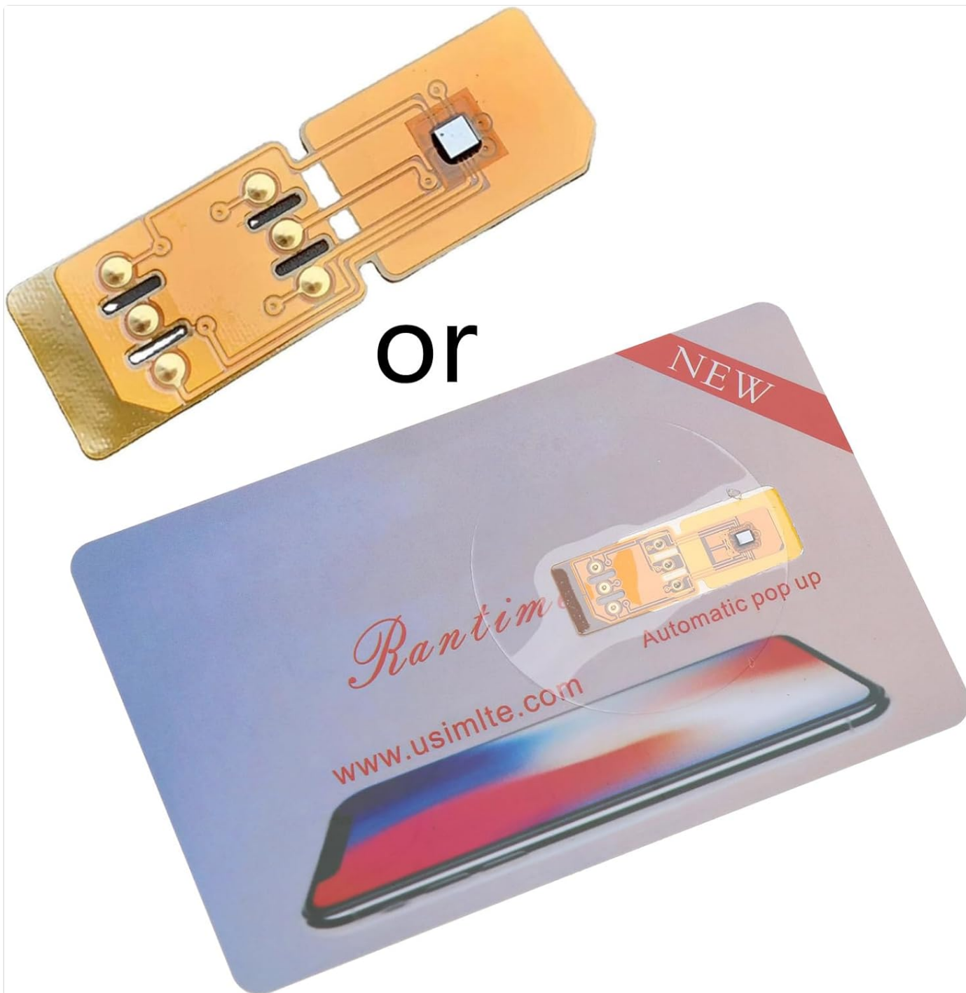
Image: The MobilePhone USIM Unlocking Card shown alongside its retail packaging, which features a phone screen graphic and the text "Rantim www.usimlte.com". The image also shows the unlocking chip itself, indicating it can be used either as a standalone chip or integrated into a card.