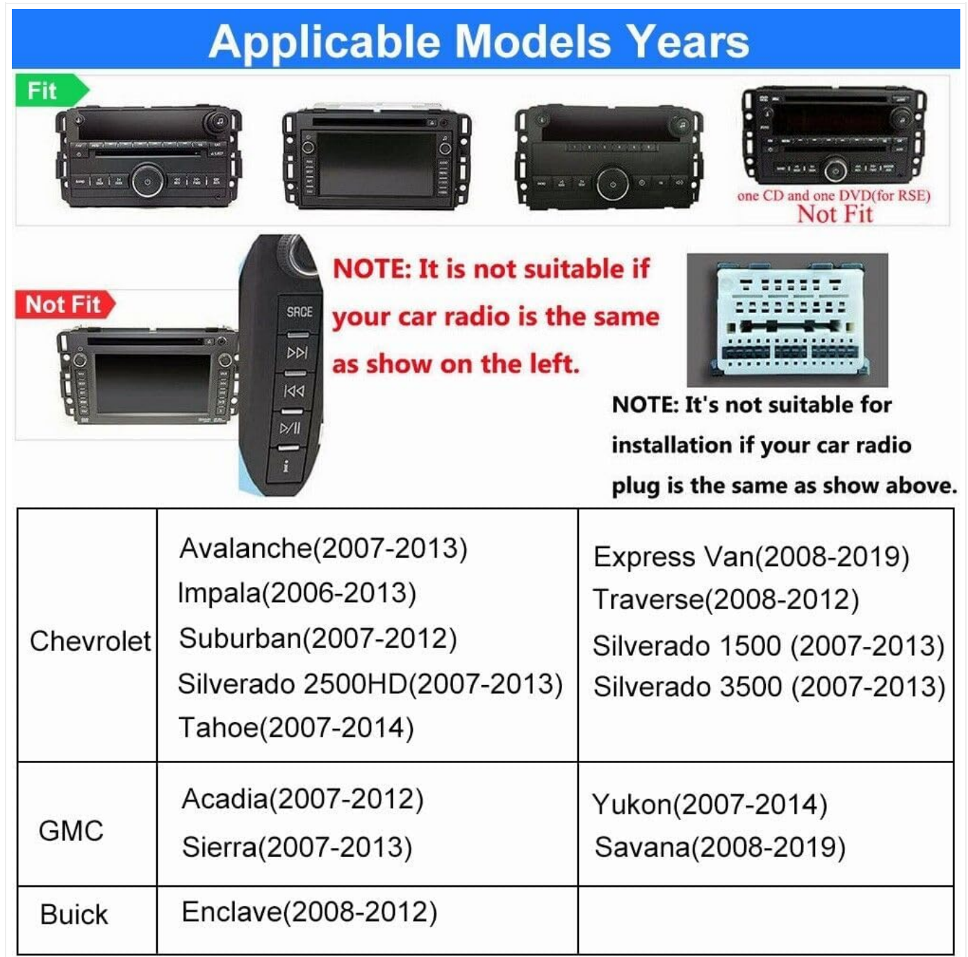
Image: A chart detailing compatible and incompatible car radio types and vehicle models. It shows examples of "Fit" and "Not Fit" car radio designs and a table of compatible Chevrolet, GMC, and Buick models with their respective year ranges.

This car stereo is designed for specific GM-C vehicle models and years. Please verify your vehicle's compatibility before installation.