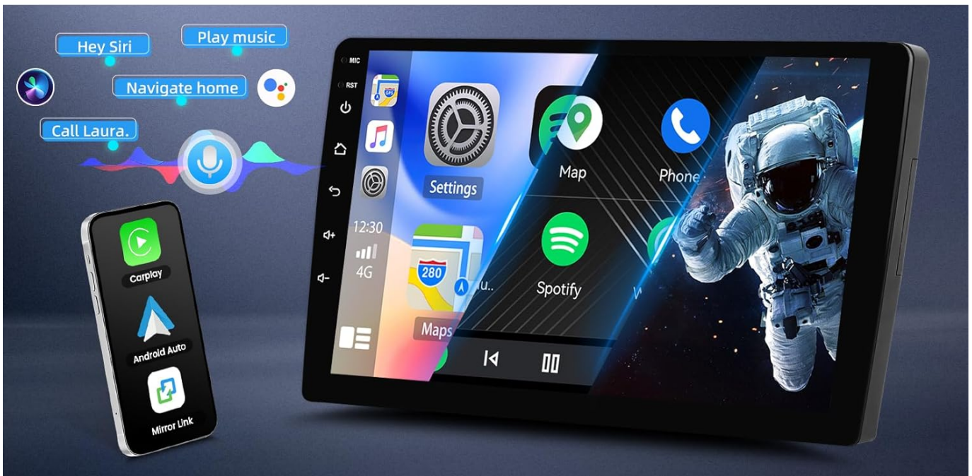
Image: Screenshots demonstrating the user interface for Wireless CarPlay and Android Auto, showing various apps like maps, music, phone, and settings, along with voice command examples like "Hey Siri" and "Call Laura."