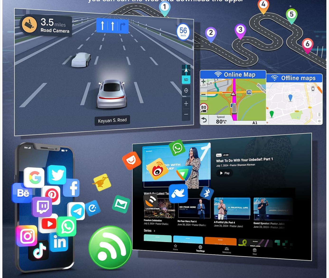
Image: Displays the GPS navigation interface with online and offline map options, showing a route and various applications that can be downloaded and used with Wi-Fi connectivity.

Support both online and offline map. After connecting to wifi, you can surf the web and download the apps.