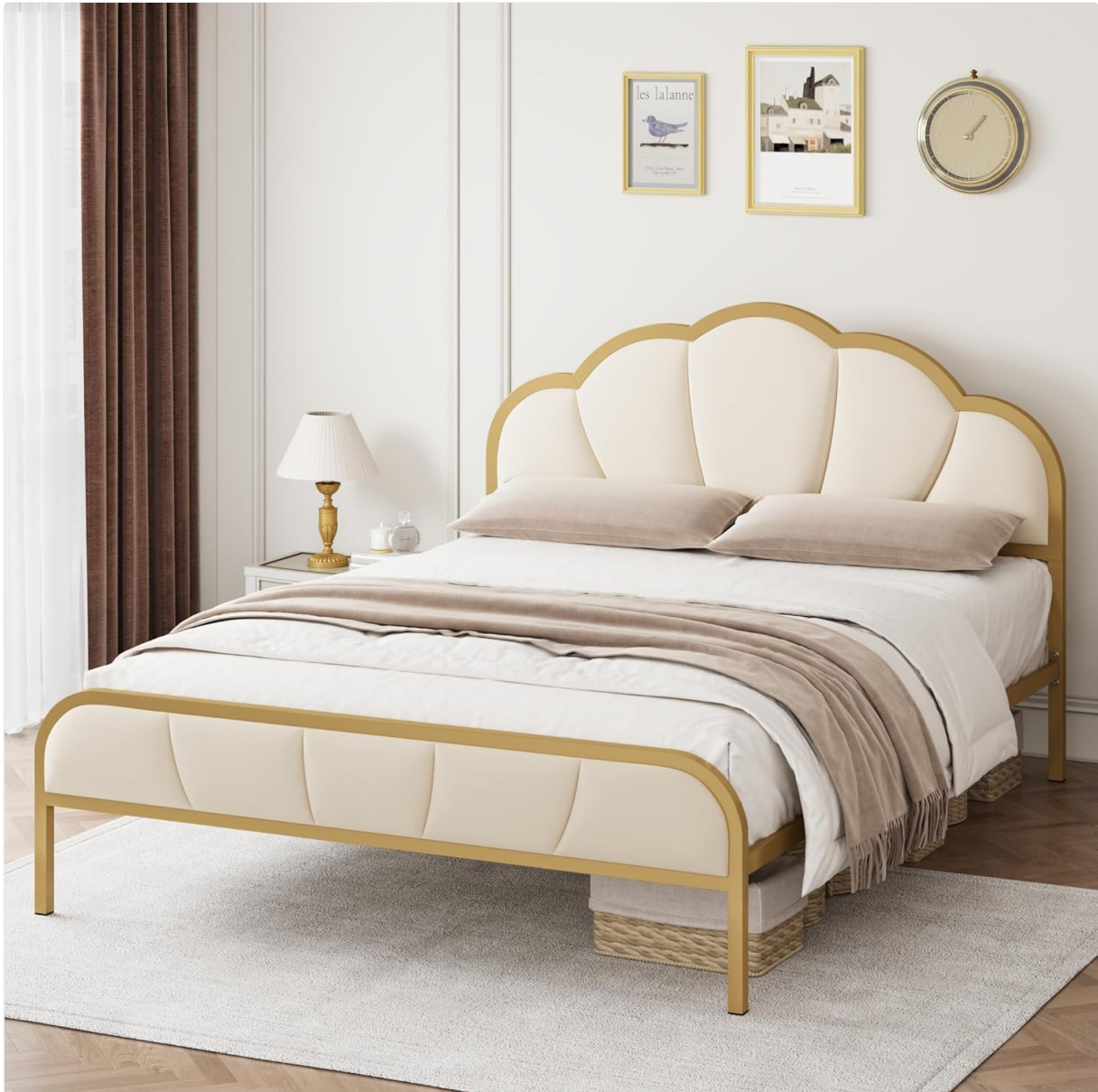
Figure 1: Fully assembled BOTLOG Queen Upholstered Platform Bed Frame in a bedroom setting.