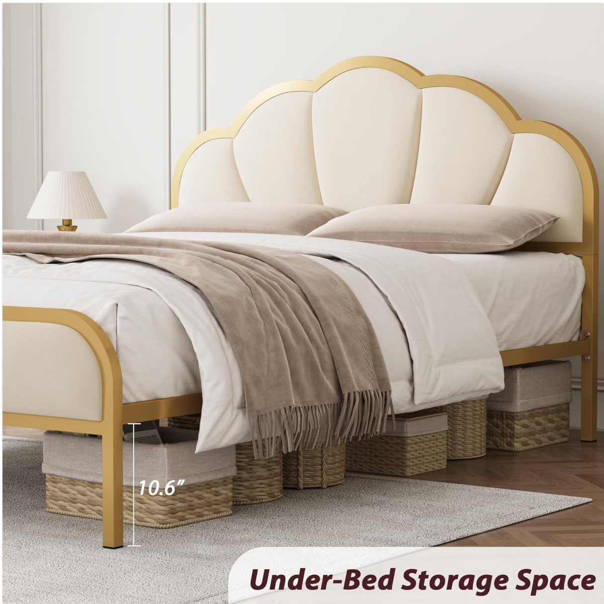
Figure 5: The 10.6-inch under-bed clearance provides ample storage space.