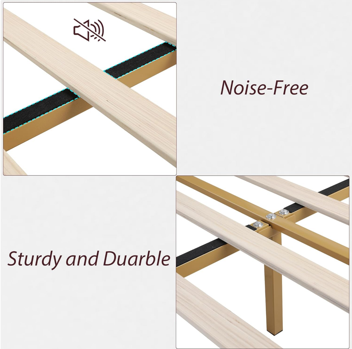
Figure 6: The wooden slats include EVA silent strips for a noise-free experience, and the frame is designed for sturdiness.