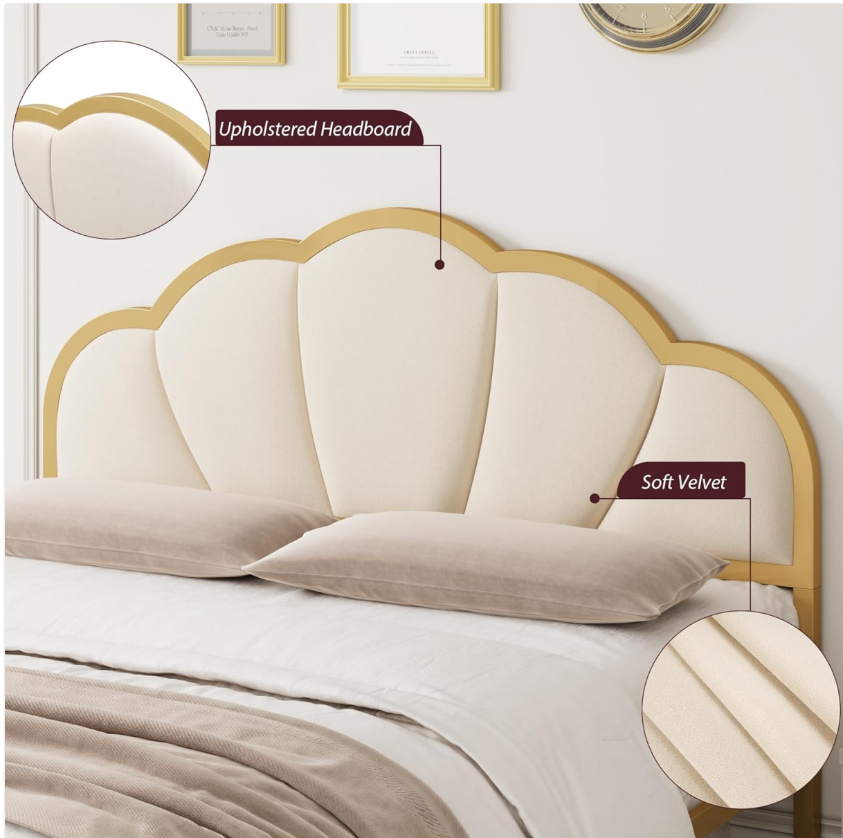
Figure 2: Detailed view of the upholstered velvet petal headboard and soft velvet fabric.

The bed frame features a petal-shaped velvet headboard with high-gloss metal surrounds and soft velvet fabric, providing both comfort and an elegant aesthetic. The footboard also includes upholstered velvet panels.