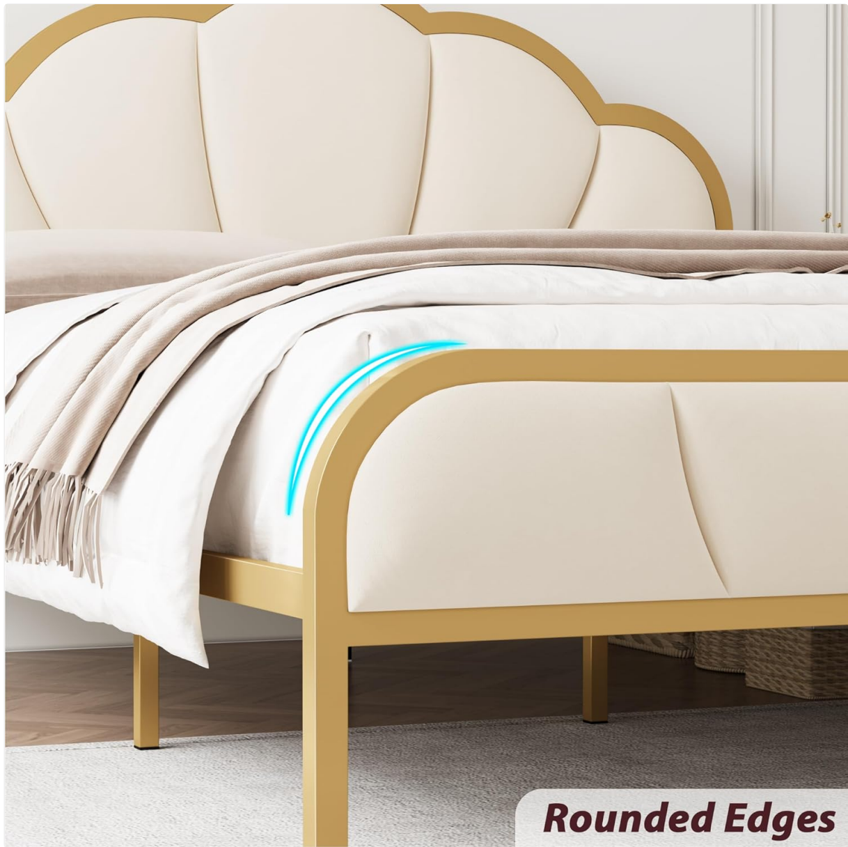
Figure 3: The bed frame features rounded edges for enhanced safety and a sleek design.