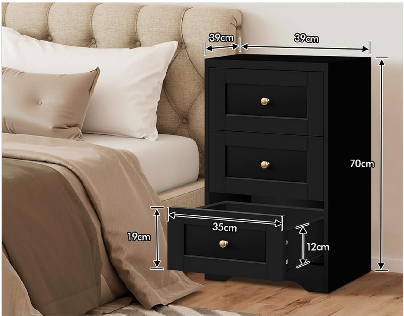
Overall dimensions: 39cm (Depth) x 39cm (Width) x 70cm (Height). Drawer interior dimensions: 35cm (Width) x 19cm (Height) x 12cm (Depth).