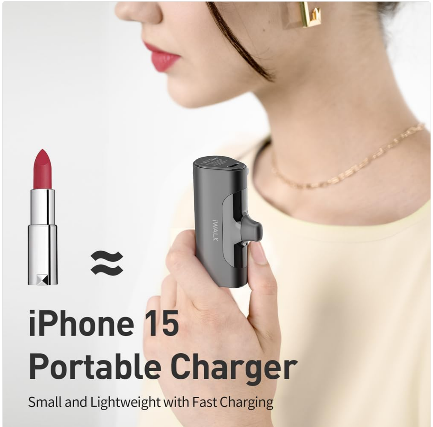
Image: A close-up view of the iWALK portable charger, highlighting the USB-C input port used for recharging the device.