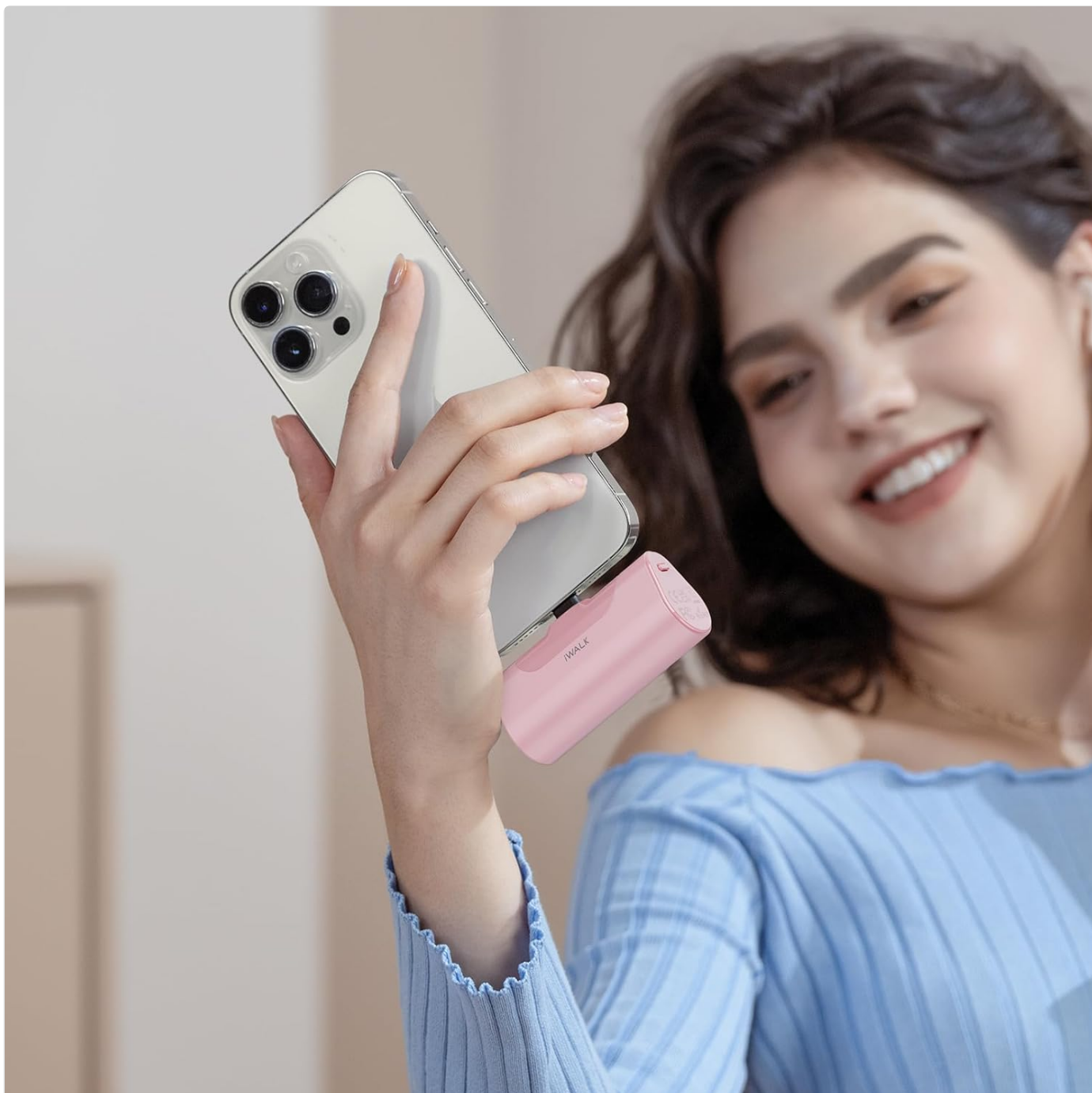
Image: A woman holding a smartphone with the iWALK portable charger attached, demonstrating how the device can be used comfortably while charging.