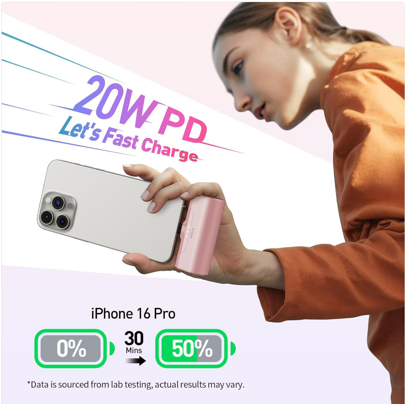
Image: The iWALK portable charger directly connected to the charging port of a smartphone, illustrating its cable-free design for device charging.