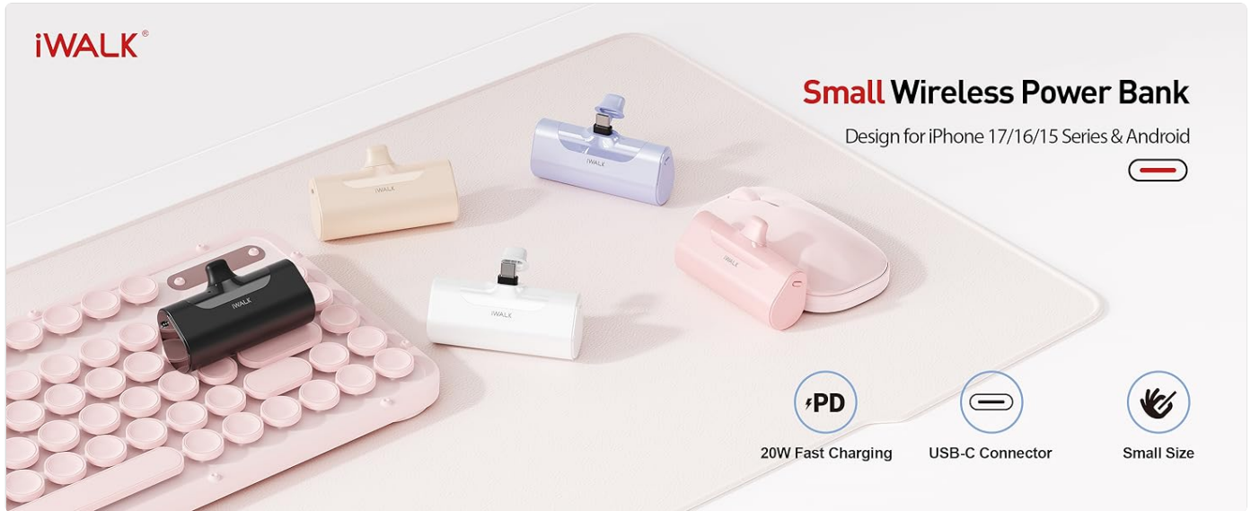
Image: The iWALK portable charger demonstrating its 20W fast charging, capable of charging an iPhone 16 Pro to 50% in 30 minutes.