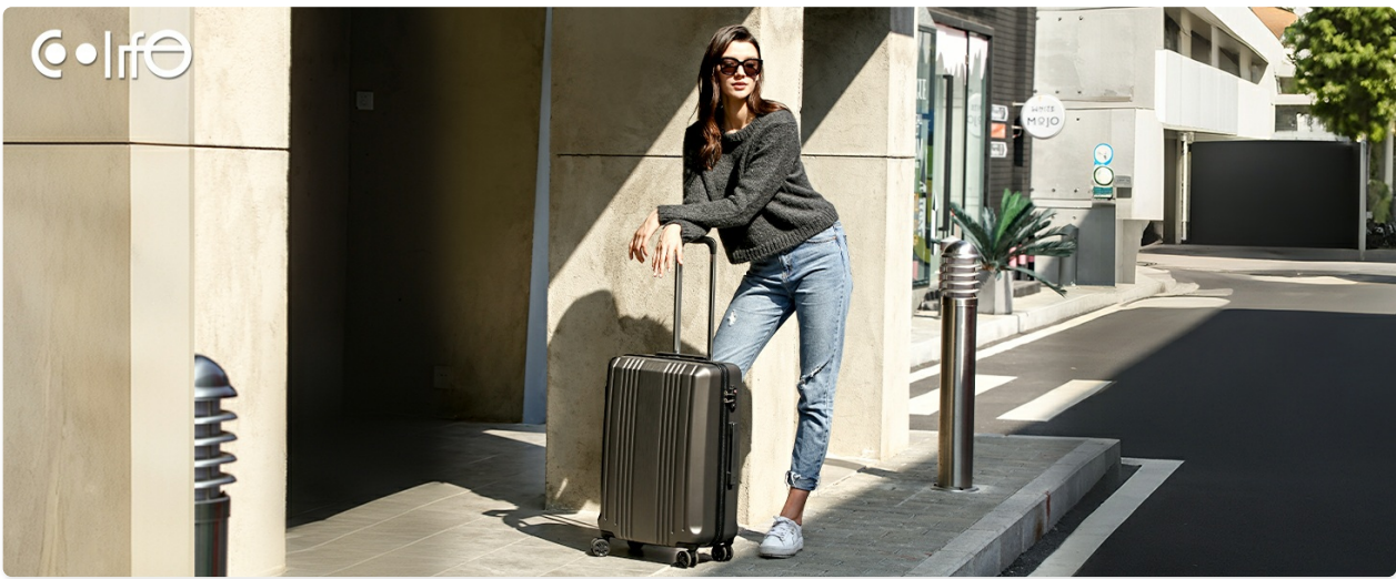
Image 2.2: Illustration of the robust aluminum telescoping handle.