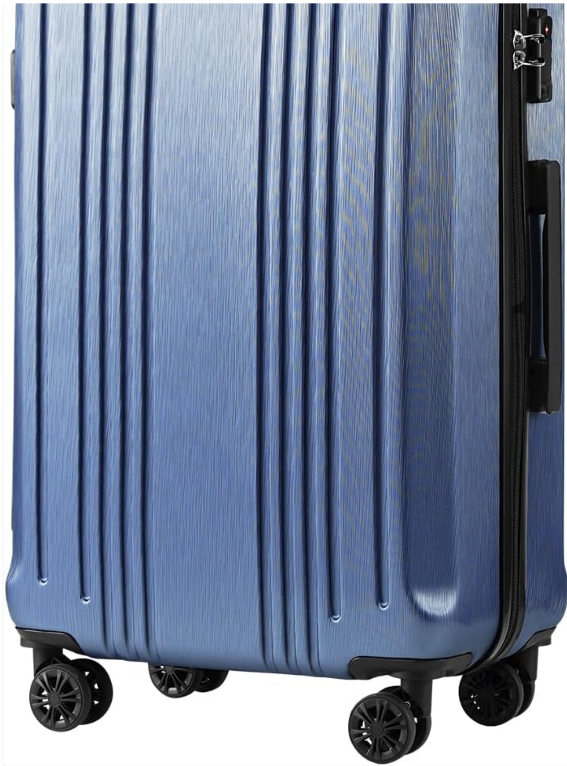
Image 1.1: Front view of the Coolife 20-inch ice blue hardshell carry-on suitcase.