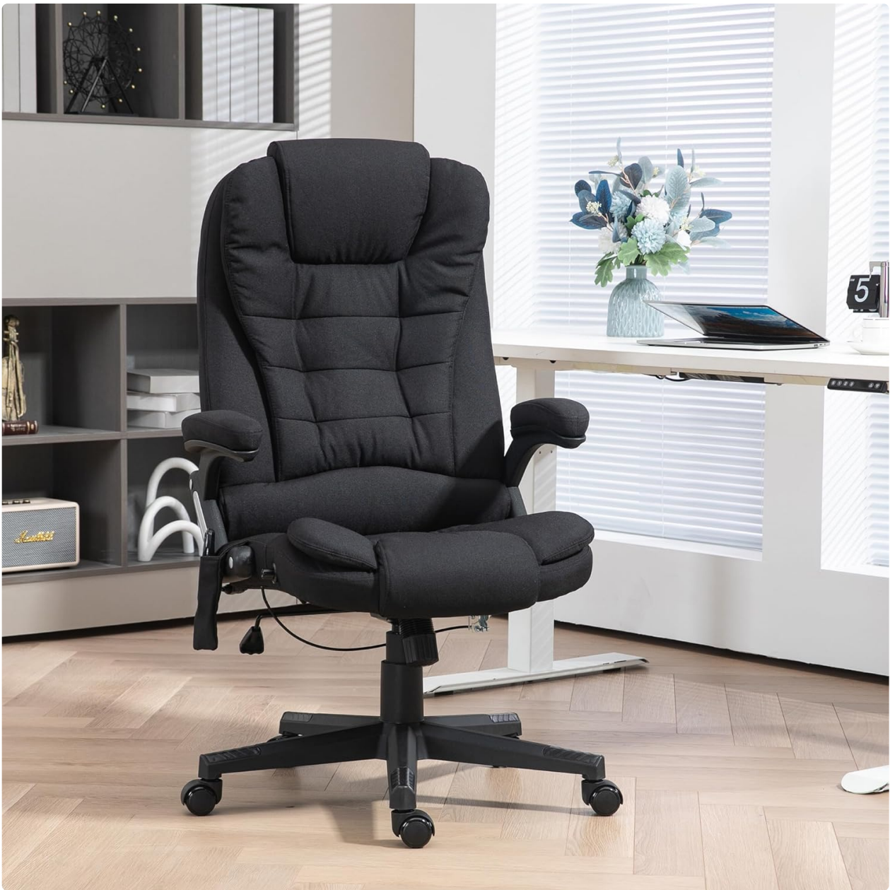
Figure 3.1: The assembled chair in an office environment.

Your browser does not support the video tag.