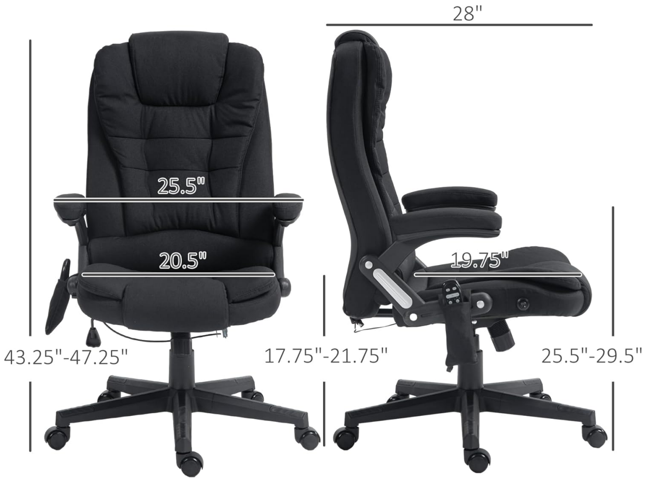
Figure 7.1: Key dimensions of the Vinsetto Massage Office Chair.