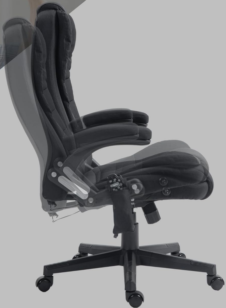
Figure 4.4: Controls for tilt function and tension adjustment.