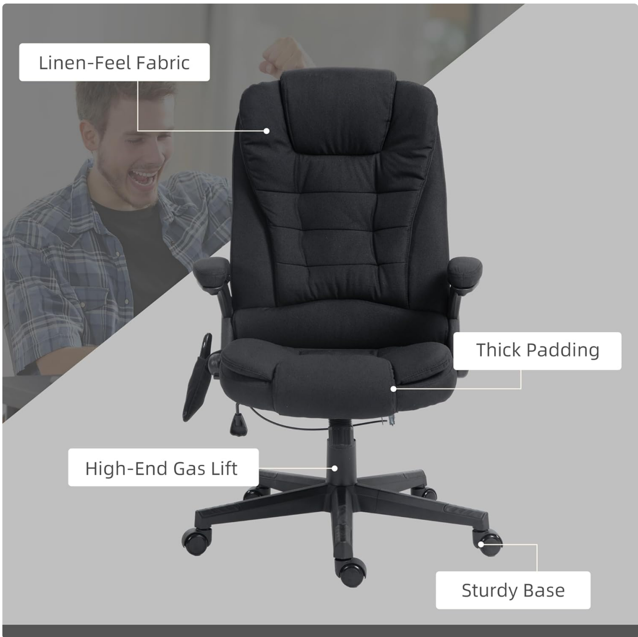
Figure 7.2: Details of the chair's construction materials and components.