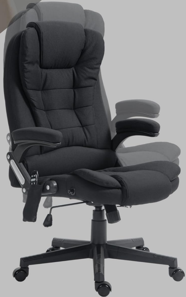
Figure 4.2: Adjusting the chair's height using the lever.