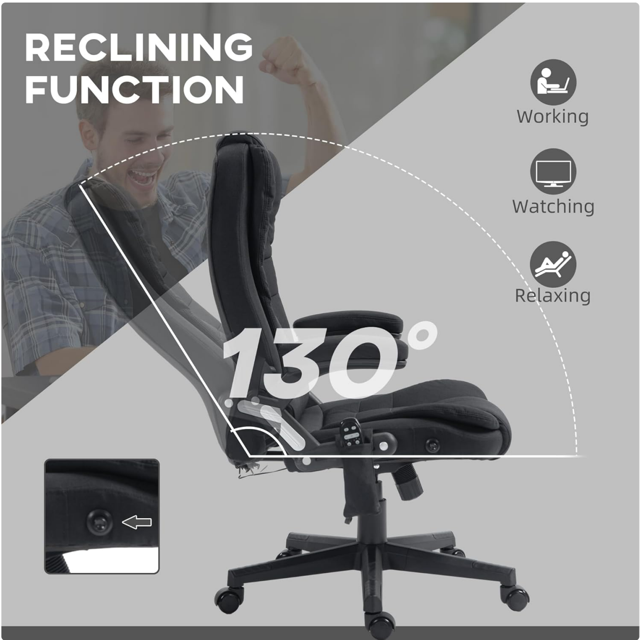
Figure 4.3: Chair demonstrating its reclining capability.