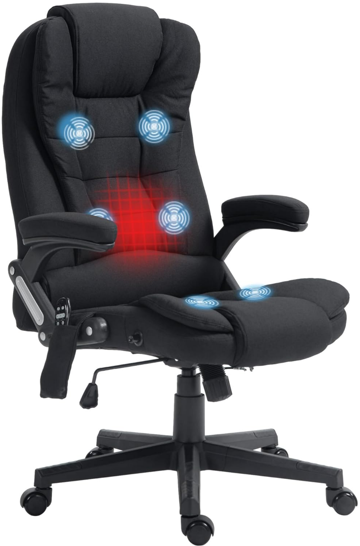
Figure 1.1: Vinsetto 6 Point Vibrating Massage Office Chair.