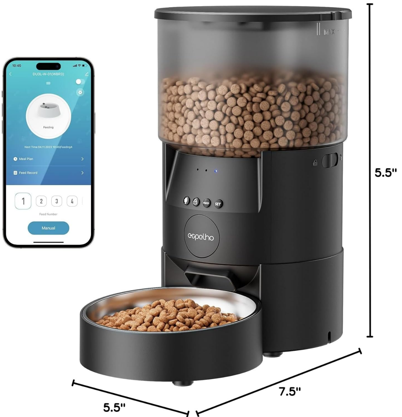
Image 6.1: Product dimensions of the Espelho Automatic Cat Feeder.