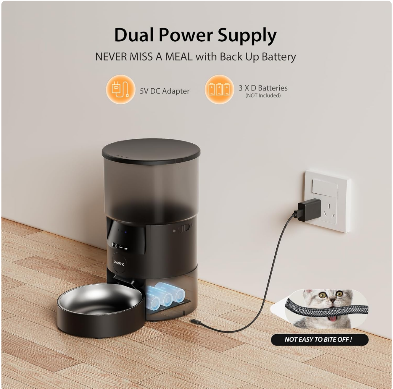
Image 2.1: Dual power supply options for the feeder, showing AC adapter and battery compartment.

The feeder supports dual power options: AC adapter or D-cell batteries. For continuous operation, it is recommended to use the AC adapter and install batteries as a backup.