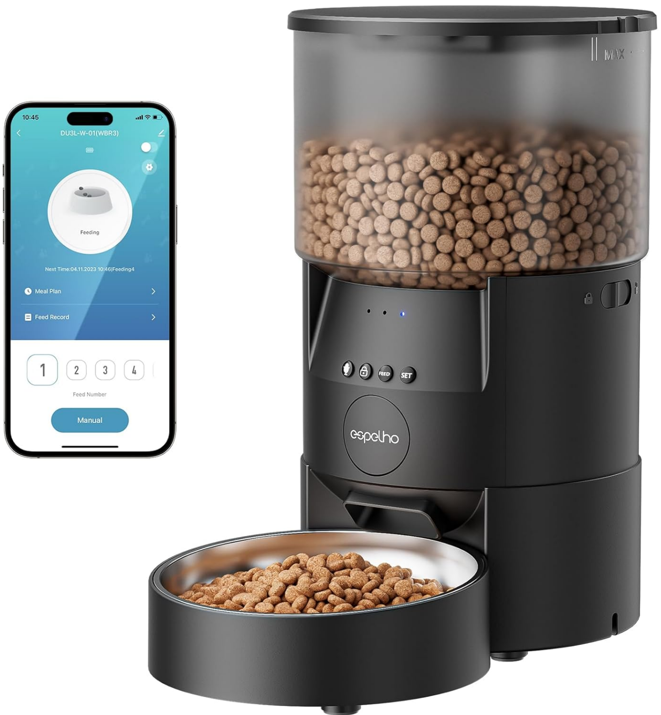
Image 1.1: Espelho Automatic Cat Feeder and its accompanying mobile application interface.