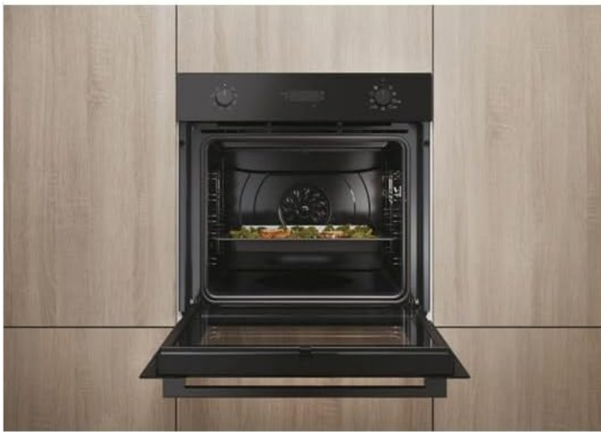
Figure 5: The ROSIERES built-in oven with its door open, revealing a dish being cooked on a rack inside the oven cavity, integrated into light wooden kitchen cabinetry.