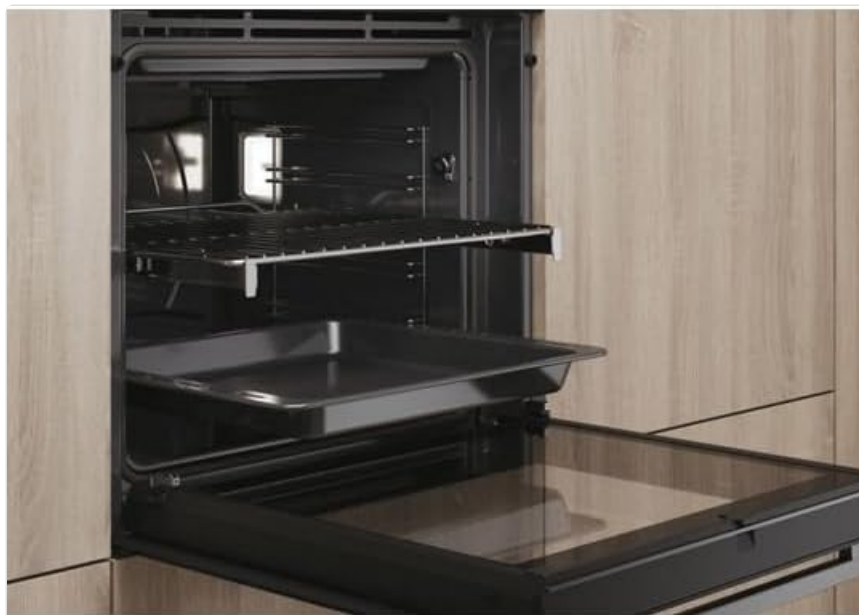
Figure 4: An open view of the ROSIERES oven interior, showing a wire rack and a baking tray positioned on different levels, ready for cooking.