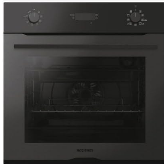
Figure 1: Front view of the ROSIERES RFC5M594PN built-in oven, showing the control panel with two rotary knobs and a central digital display, and the oven door.