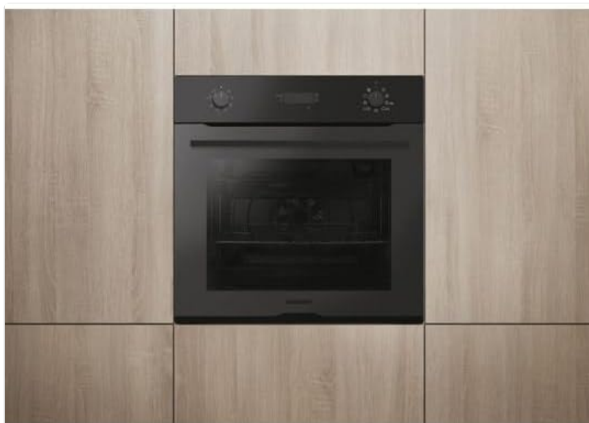
Figure 3: The ROSIERES built-in oven seamlessly integrated into light wooden kitchen cabinetry, with its door closed, showcasing its sleek black finish.