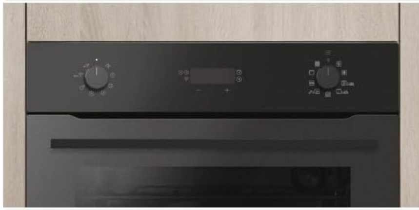
Figure 2: Close-up of the oven's black control panel, featuring two rotary knobs for function and temperature selection, and a central digital display for settings and time.