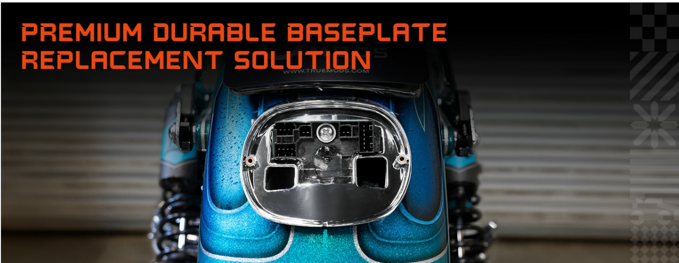
Image: Protective foam pad on the base plate for scratch-free installation.