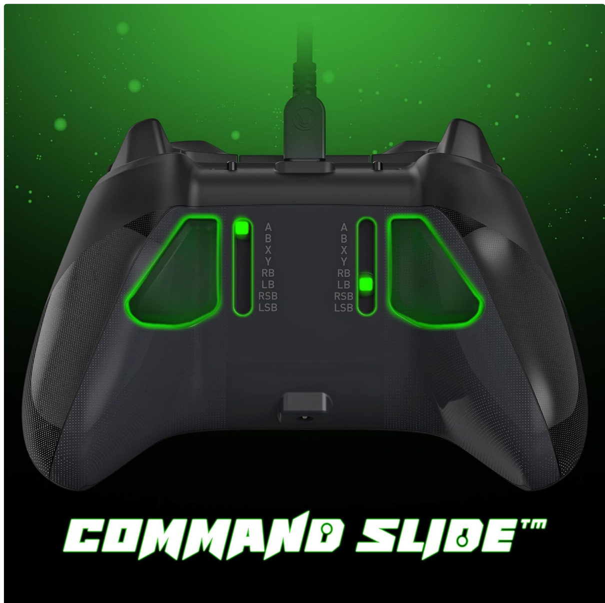
Image 3.2: Rear view of the Snakebyte Xbox Gamepad Pro X, highlighting the two assignable paddles and the 'Command Slide' switches used for on-the-fly button remapping.