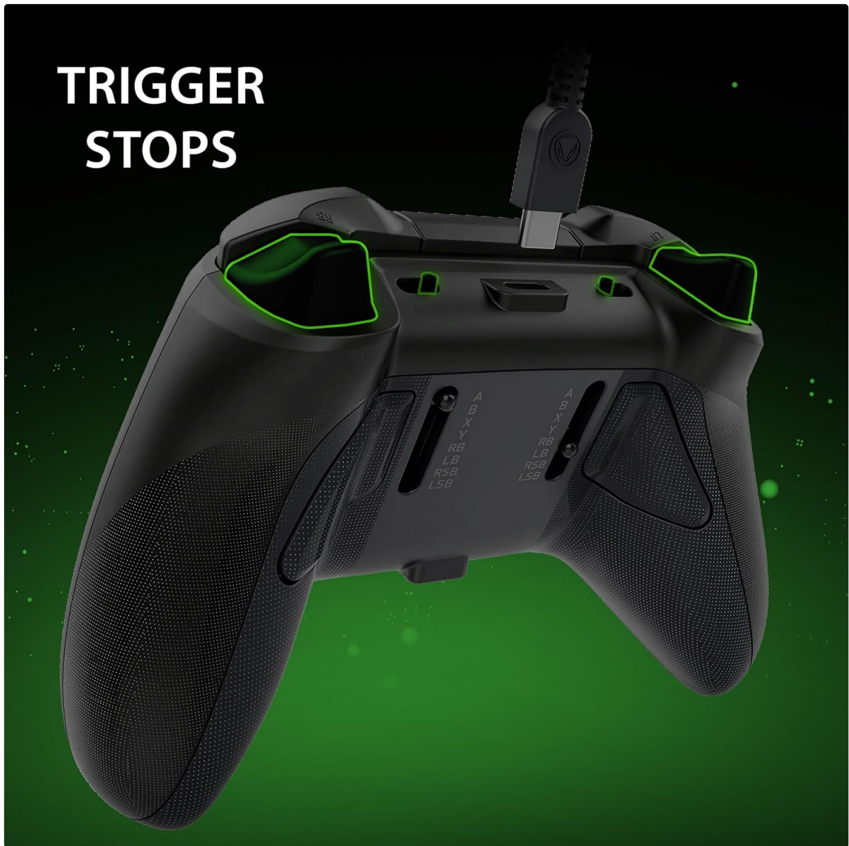
Image 3.3: A close-up of the rear of the controller, illustrating the trigger stop mechanisms engaged to reduce trigger travel distance.