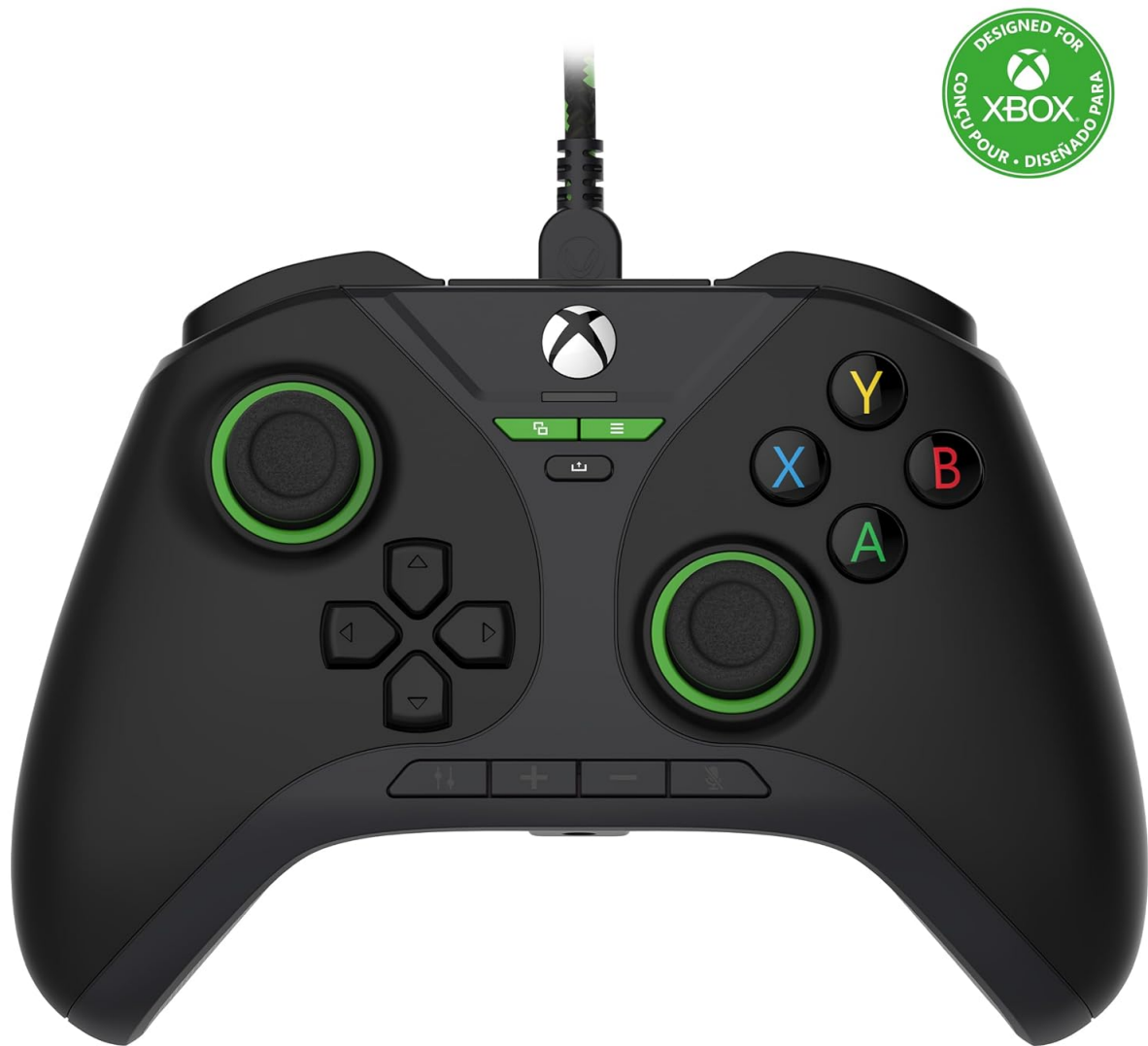
Image 1.1: Front view of the Snakebyte Xbox Gamepad Pro X (Schwarz) controller, showcasing its black design with green accents on the thumbsticks and buttons, and the Xbox logo.