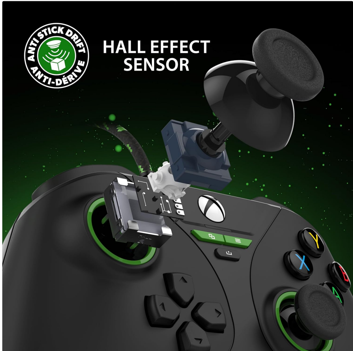
Image 3.1: An exploded view diagram illustrating the Hall Effect sensor mechanism within a controller's thumbstick, highlighting its magnetic components for precise input.

The controller is equipped with Hall Effect sensors for both triggers and analog sticks. This technology uses magnetic fields to detect movement, providing increased precision, faster reaction times, and reduced wear compared to traditional potentiometers, minimizing stick drift.