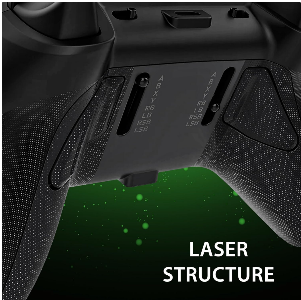
Image 4.1: A close-up view of the controller's handle, showcasing the 'Laser Structure' textured grip designed for improved handling and comfort.