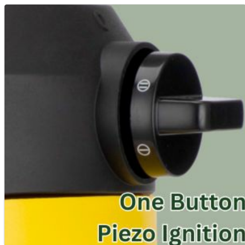
Control knob for one-button piezo ignition.