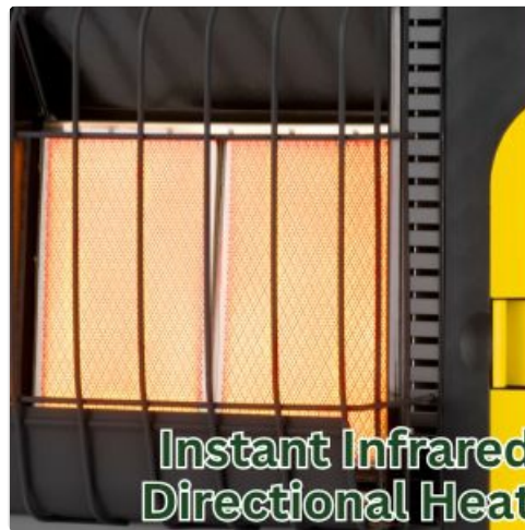
The glowing infrared heating element during operation.