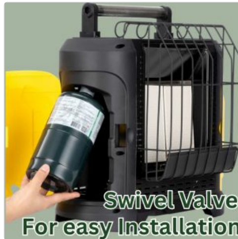
Attaching a 1 lb propane tank to the heater's swivel valve.