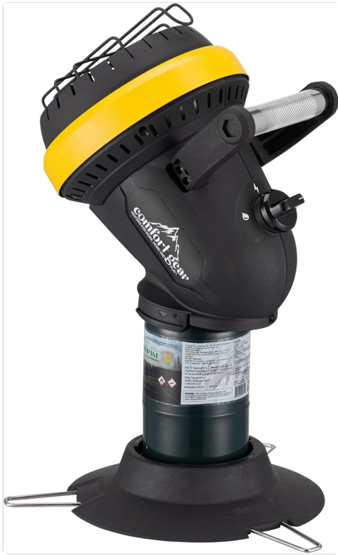
Side view of the heater, showing the control knob and carry handle.