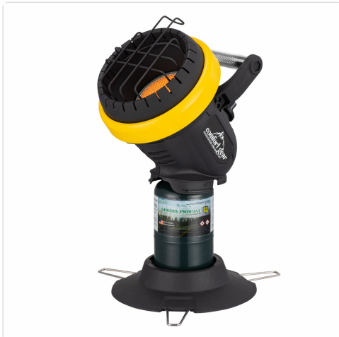
Front view of the Comfort Gear Portable Personal Propane Heater with a 1lb propane tank attached.