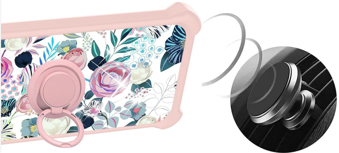
Image: Diagram showing the 180-degree and 360-degree rotation of the ring stand, and its compatibility with magnetic car mounts.

Not include magnetic car mount, not support wireless charging.