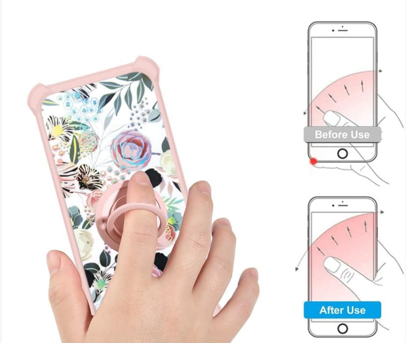
Image: Illustration demonstrating improved one-hand operation and reach across the screen when using the finger ring.