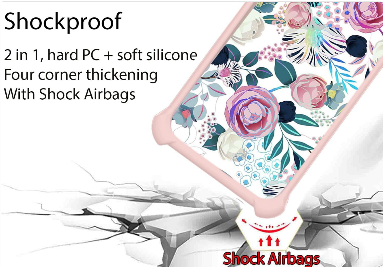
Image: Close-up of the case highlighting the shockproof design and corner airbags.

2 in 1, hard PC + soft silicone Four corner thickening With Shock Airbags