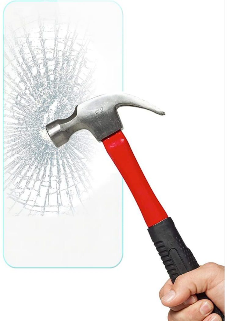
Image: Demonstration of the screen protector's scratch-proof capability, showing a hammer striking the protector without damage.

Scratch proof screen effectively avoids sharp objects scratching or abrasion