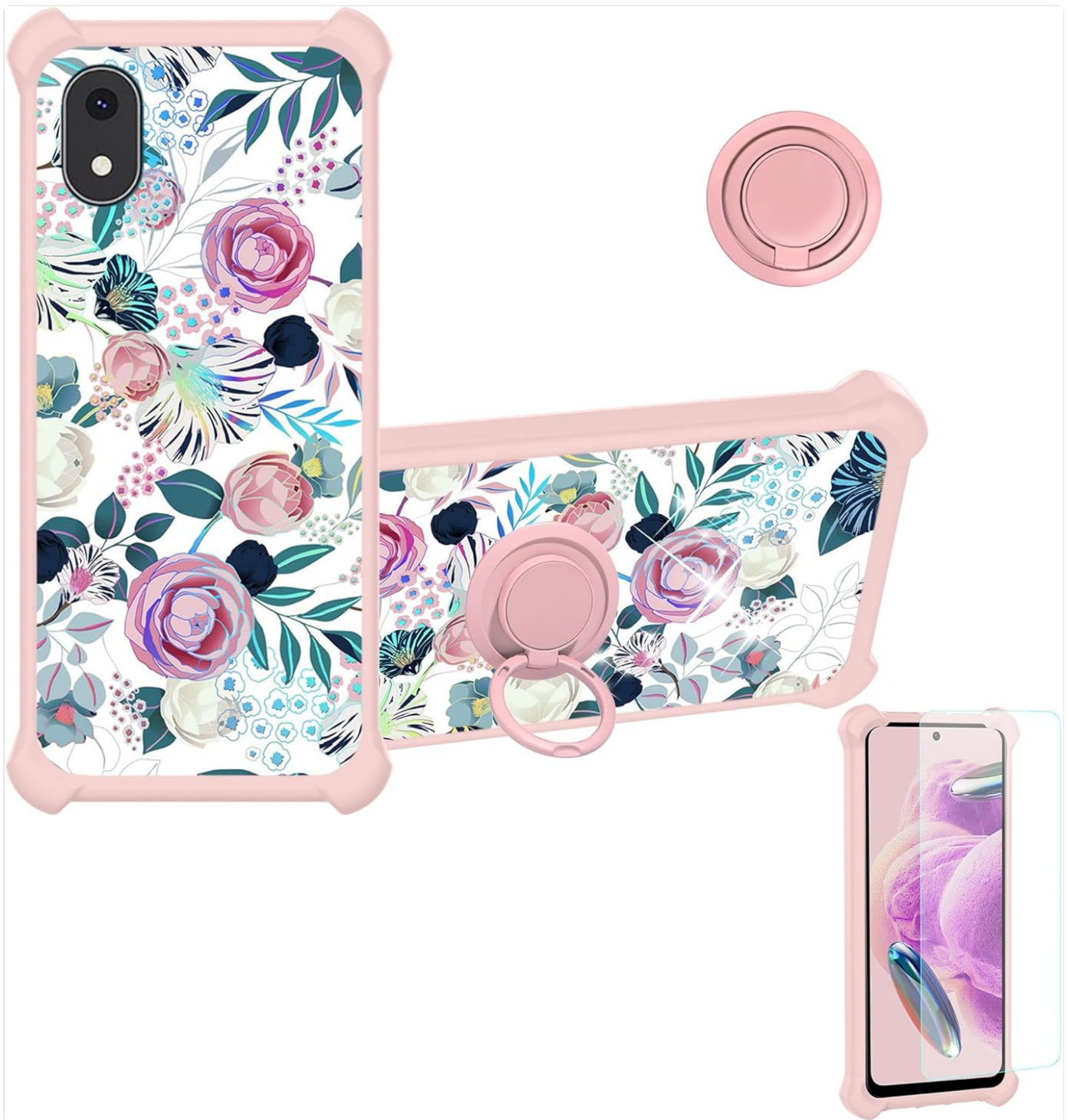
Image: Contents of the package including the phone case, detachable ring stand, and tempered glass screen protector.