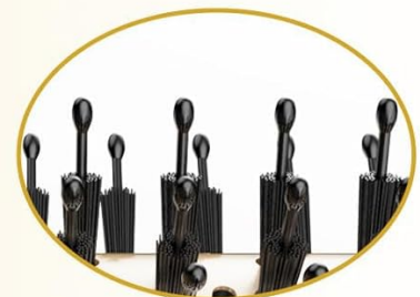
Soft Ball Pin And Tufted Bristles