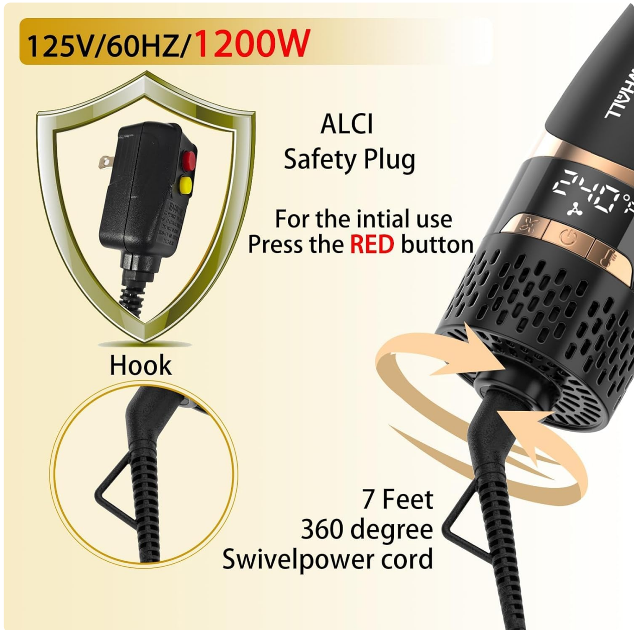
Image: Close-up of the Nicebay Hair Dryer Brush showing the ALCI safety plug, power specifications (125V/60Hz/1200W), and the 360-degree swivel power cord.