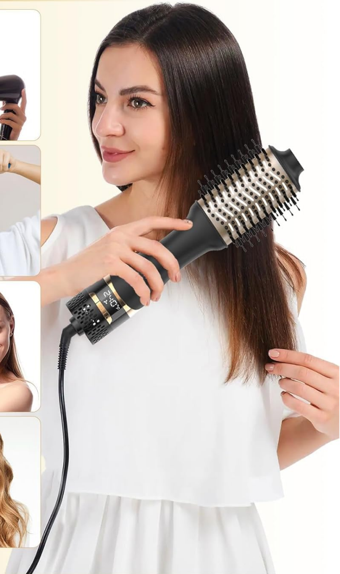
Image: Visual representation of the Nicebay Hair Dryer Brush's all-in-one capabilities, including hair drying, brushing, straightening, and curling.