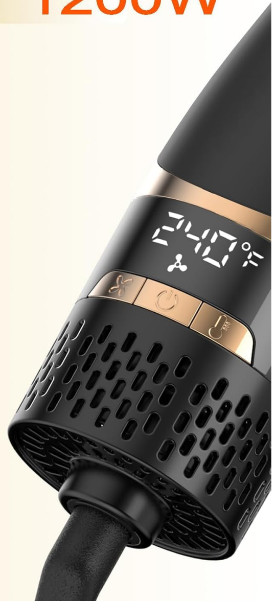
Image: Close-up of the Nicebay Hair Dryer Brush's visual display showing temperature and airflow settings, along with the extra cool air function.

Video: Official demonstration of the Nicebay hair dryer brush in use, showcasing its features and styling capabilities.