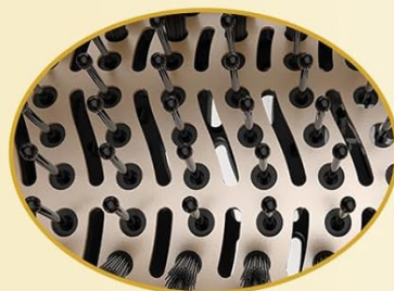
360 Degree Negative Ion Air Vents