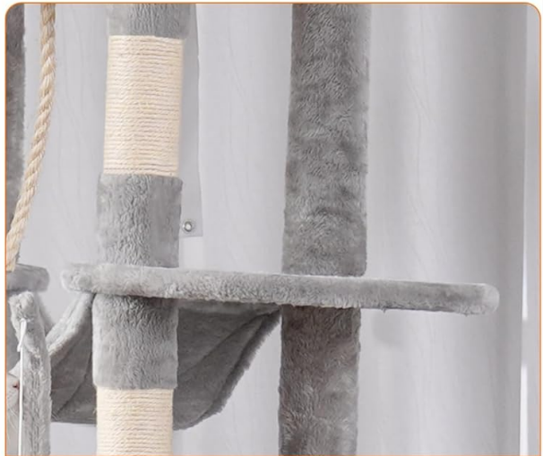
Multi-level big platform

The 2-in-1 scratching ramp allows cats to easily access different levels while also providing an ideal surface for sharpening their claws.