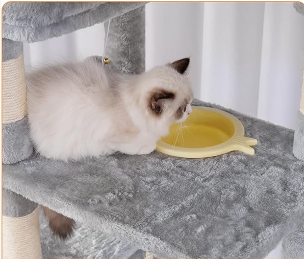
Feeding bowl with large platform