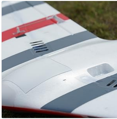
Image: Detail of the top surface of the wing, highlighting the vents for airflow and the smooth finish of the material.