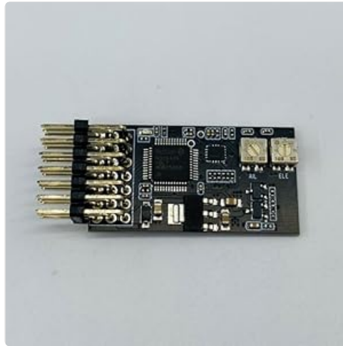
Image: Close-up view of the integrated gyro and receiver board, showing connection pins.