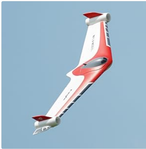
Image: The red version of the Eagle Twin flying wing aircraft in clear blue sky, demonstrating its flight capabilities.