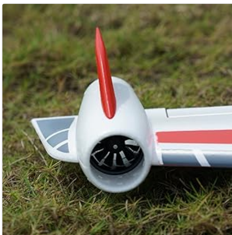
Image: A close-up view of one of the 40mm Electric Ducted Fan (EDF) units, showing the intake and fan blades.