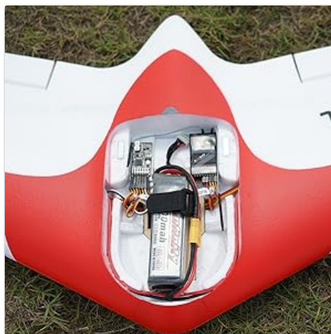
Image: View of the battery bay with a LiPo battery and receiver connected, showing the internal layout.