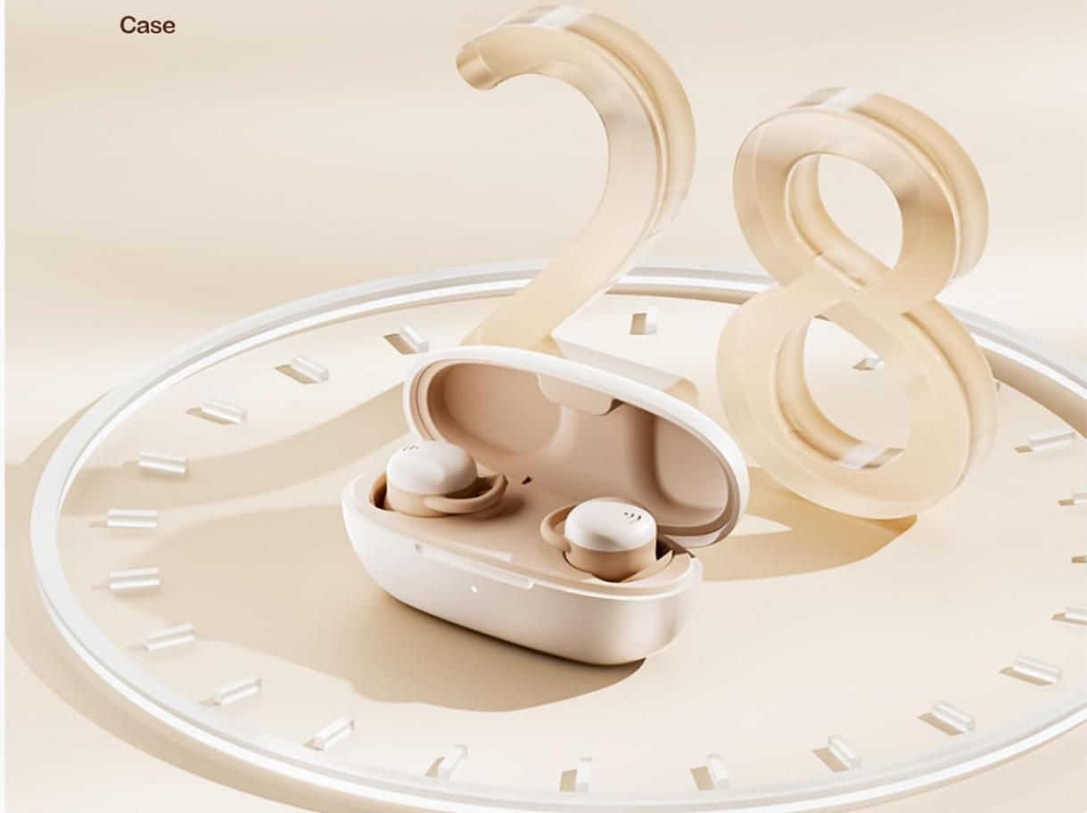
Image: An illustration detailing the battery life: 28 hours playtime with the case, 3-4 hours music time per charge, and 130 hours standby time. The earbuds are shown in their charging case.

28h 3-4h 130h Playtime With Case Music Time Standby Time