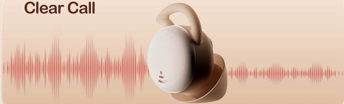
Image: A visual representation of the earbuds' intelligent noise reduction capability, showing how it suppresses environmental noise for clear call quality.