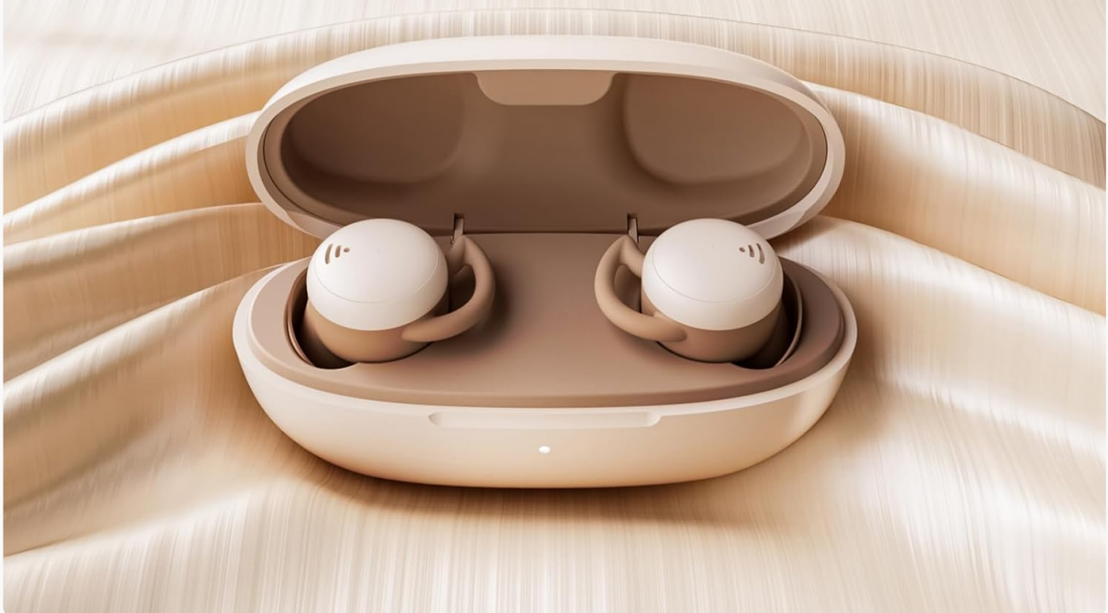
Image: The earbuds and charging case, emphasizing the new Bluetooth 5.3 technology for faster and more stable wireless connection, along with automatic pairing functionality.

Automatic Pairing & 38ms Insensitive Delay