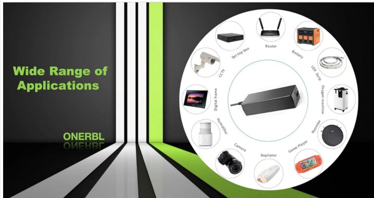
Image 5: Illustrates the wide range of applications for this type of power adapter, including various electronic devices, emphasizing its versatility.