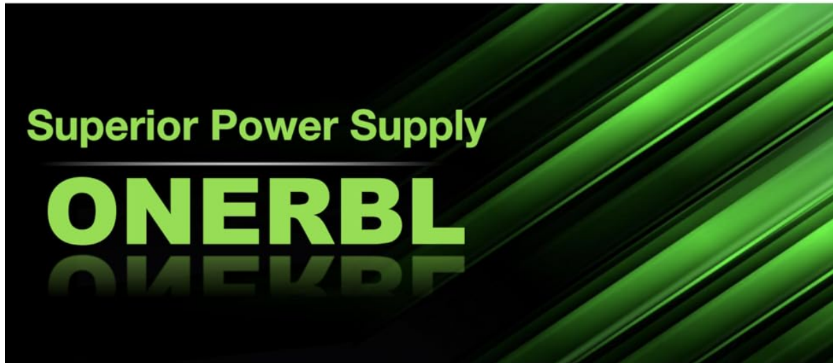
Image 1: The onerbl brand logo, indicating a superior power supply solution.

This manual provides essential information for the safe and effective use of your onerbl 6V AC/AC Adapter. This power supply is designed to be compatible with Vintage Disney Mr. Christmas Mickey's Holiday Carousel Models 27802 and 27807, providing a reliable 6VAC 1200mA (1.2A) Class 2 power source.