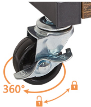
Image: Detail of the 360-degree swivel wheel with a locking mechanism, allowing for both mobility and stability.

Decide whether to use the included swivel wheels for mobility or the stationary feet. Attach your chosen option to the bottom of the stand using the appropriate hardware.