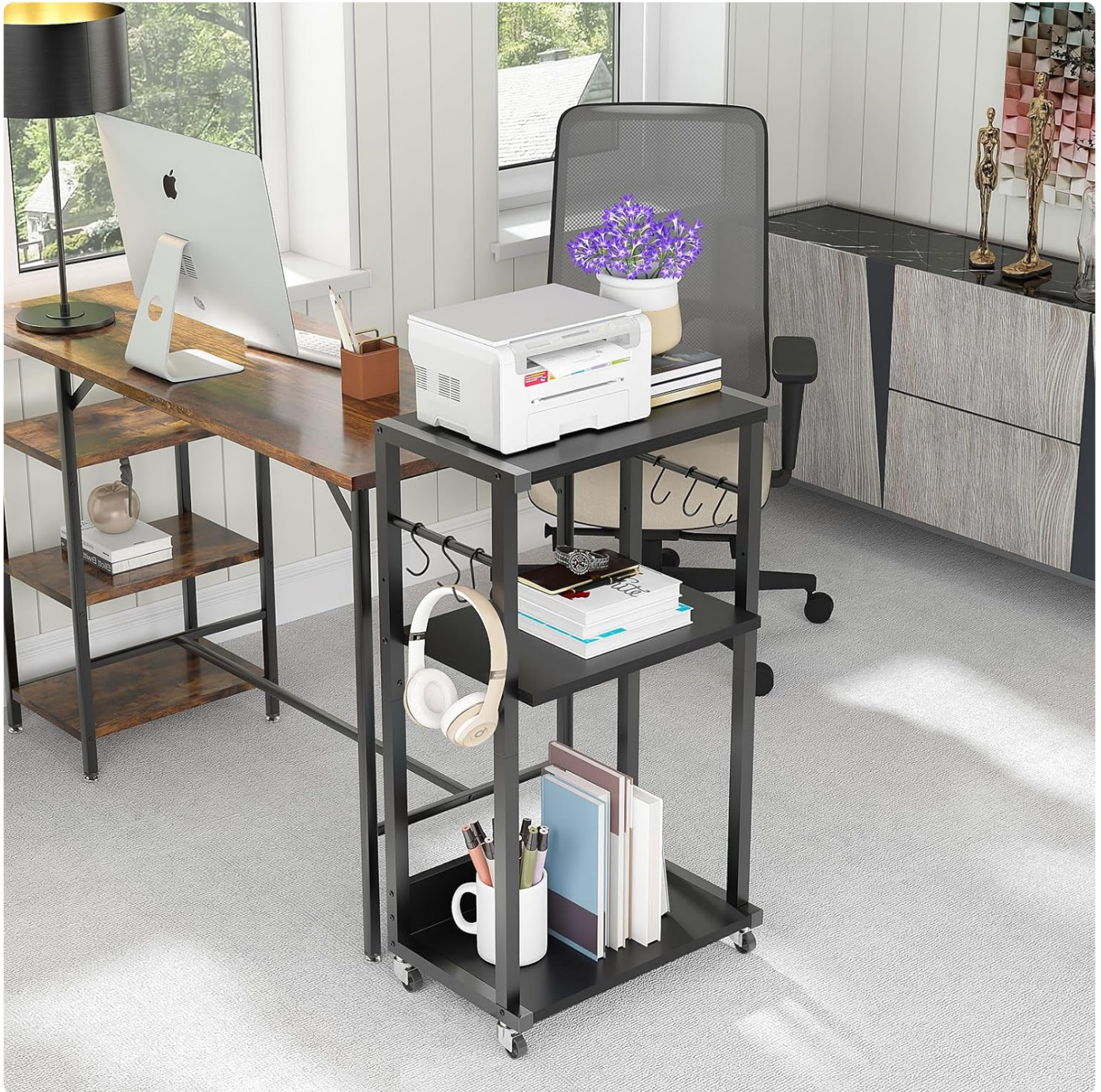
Image: The assembled printer stand in an office setting, showcasing its three tiers and potential for holding plants and office items.

Secure the MDF wood panels to the assembled frame. The middle shelf is adjustable; choose your desired height before fully tightening the screws.