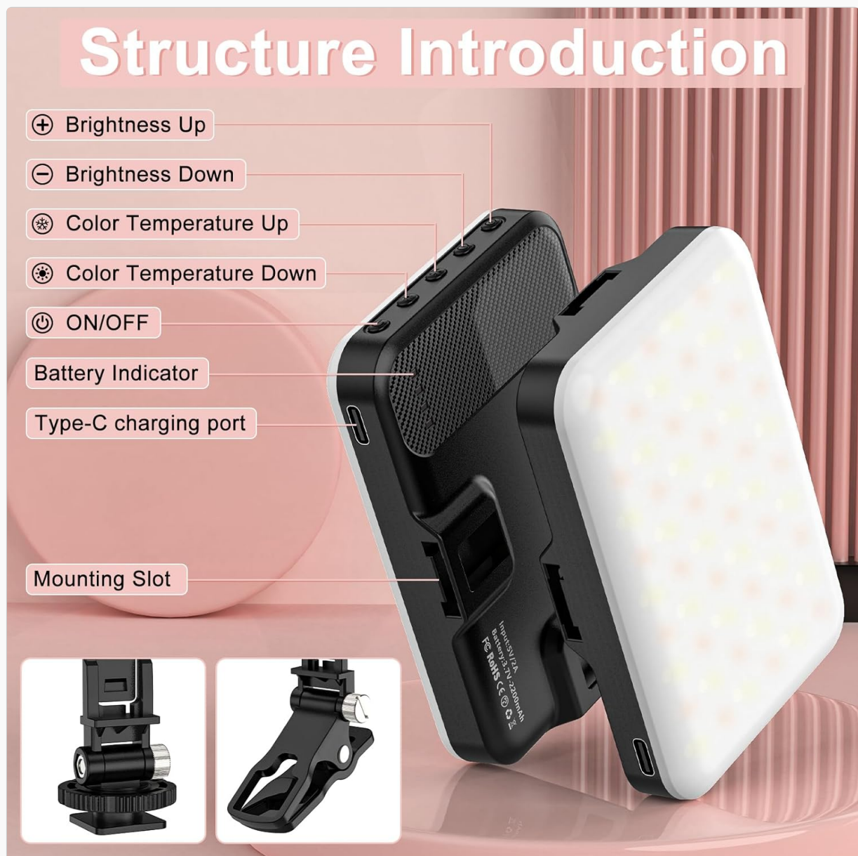
Image: Structure Introduction. This diagram highlights the various buttons and ports on the selfie light, including controls for brightness, color temperature, power, battery indicator, and the USB-C charging port.